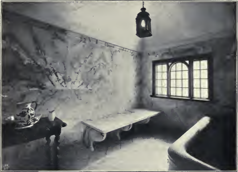
Marble Bath-room, Groote Schuur.