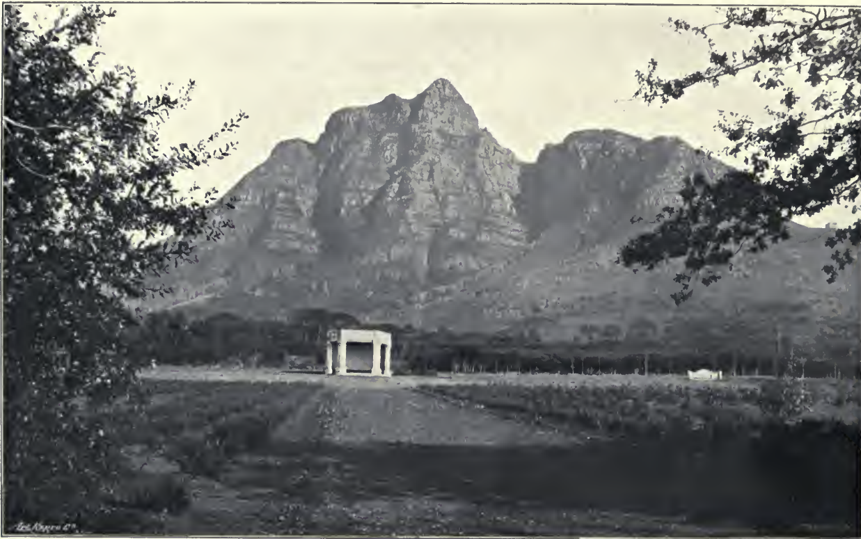
The Summer House at Groote Schuur (with the Devil's Peak in the Background).

This old restored Dutch belvidere is a favourite holiday resort of the poorer classes of Cape Town. Family parties picnic there.