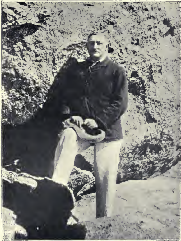
A Portrait of Mr. Rhodes taken in the Matoppos, 1899.