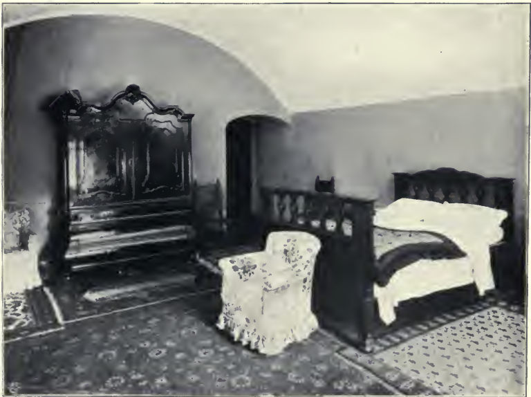
Mr. Rhodes's Bedroom.

The bed was made by local craftsmen from a South African wood of great hardness.