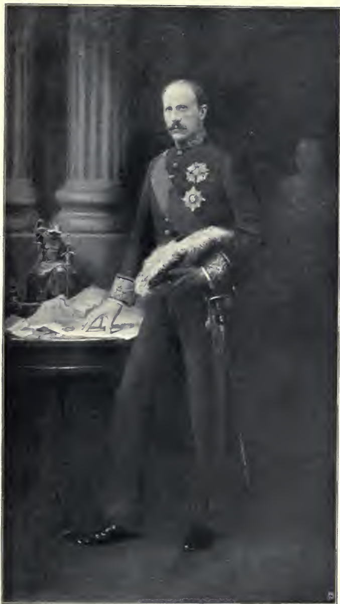
Lord Milner, G.C.B., G.C.M.G.