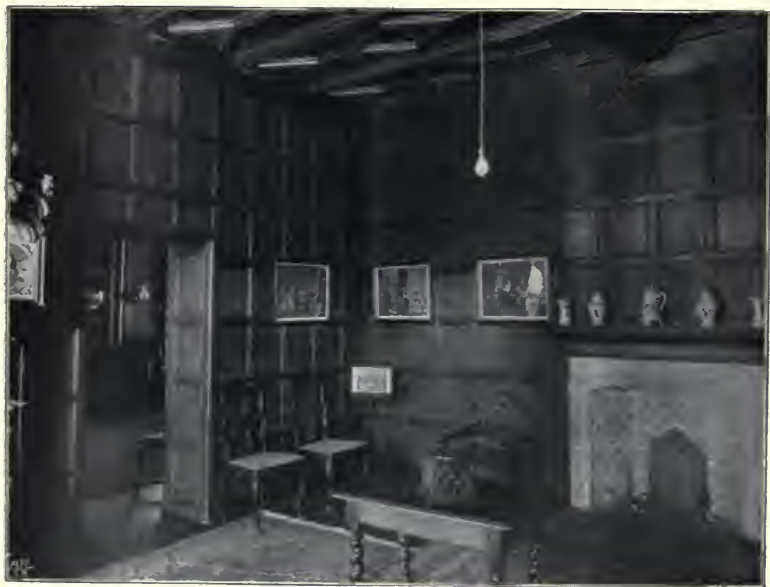
The Panelled Room.