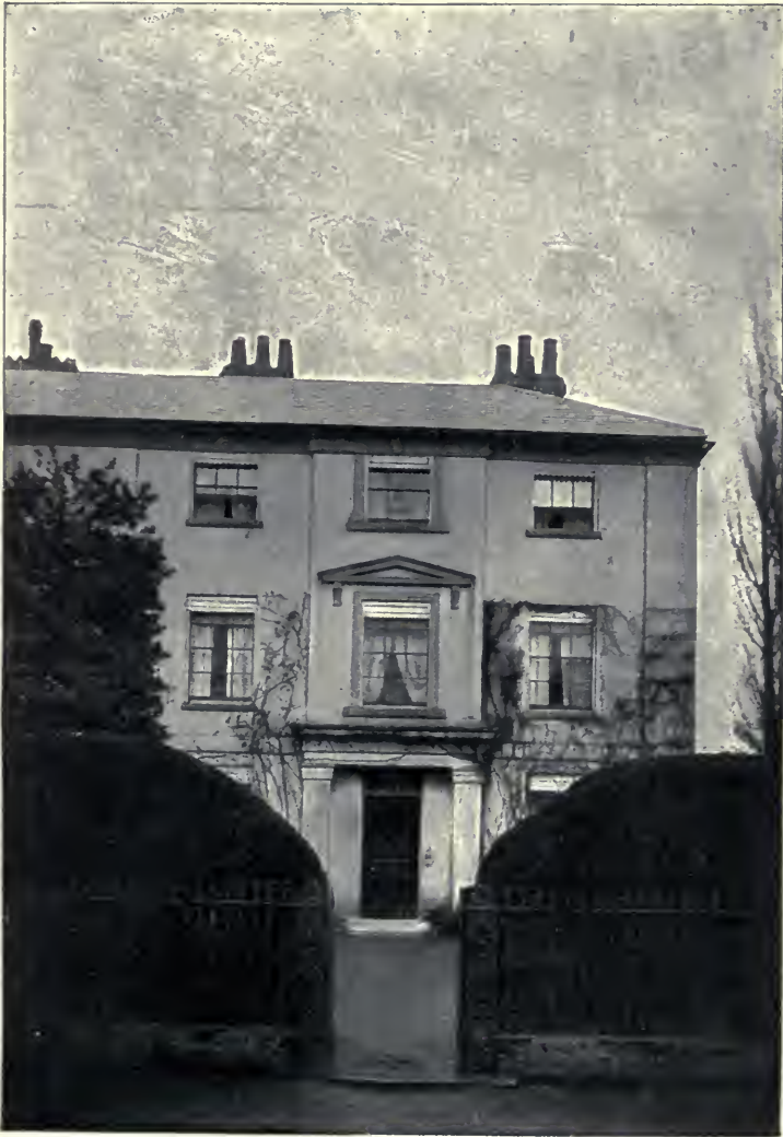
The House in which Cecil Rhodes was born.