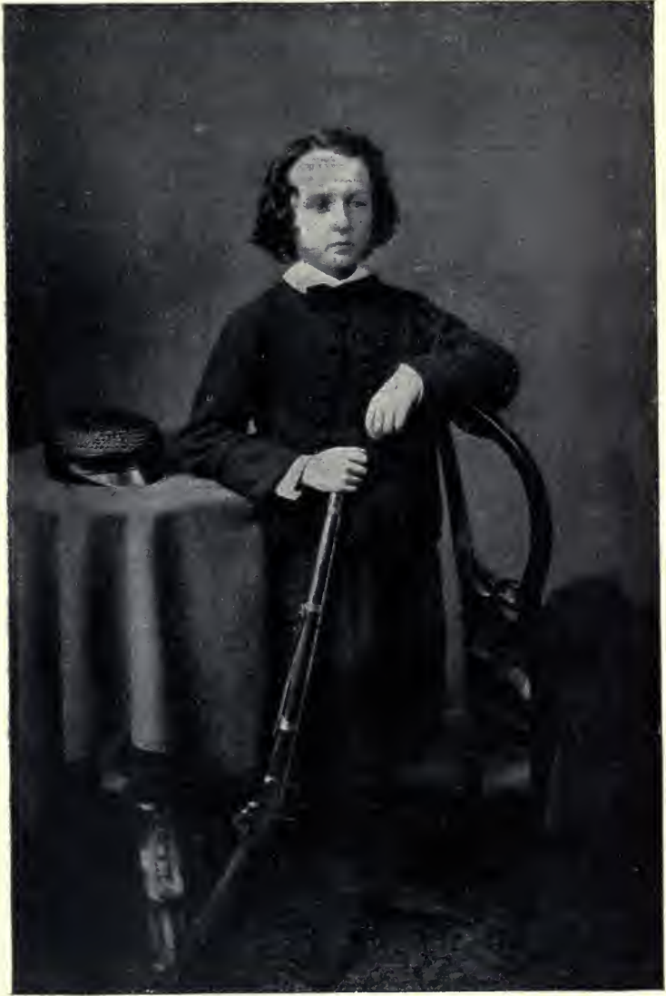
Cecil Rhodes as a boy.

(By kind permission of Wm. Blackwood and Sons.)