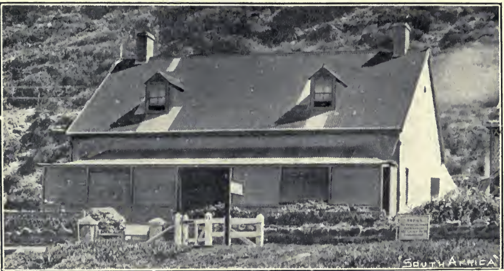
The Cottage at Muizenberg where Mr. Rhodes died.

to his companion he exclaimed, his face livid, white and drawn with an agony of dread—