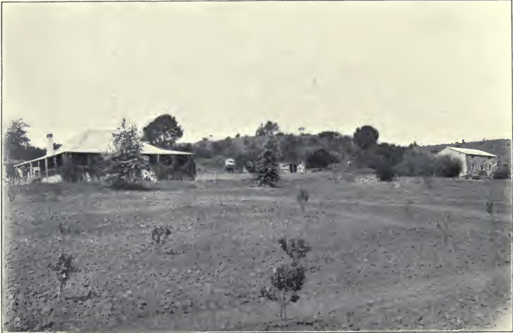
A View on the Inyanga Farm.