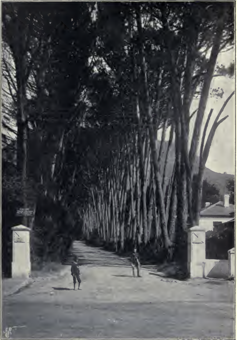
Approach to Groote Schuur.