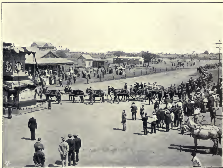
The Procession Passing the Memorial Column, Bulawayo.