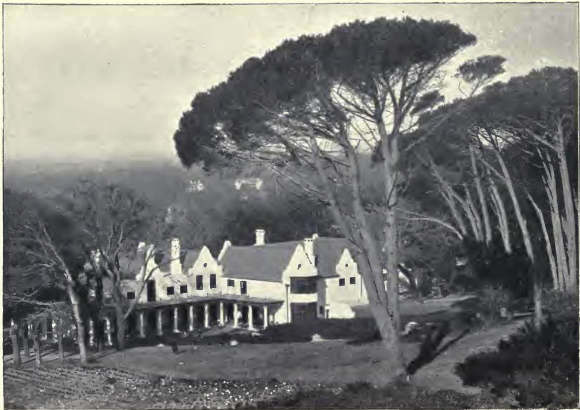
A view of Groote Schuur seen from the hill behind, running up to Table Mountain.