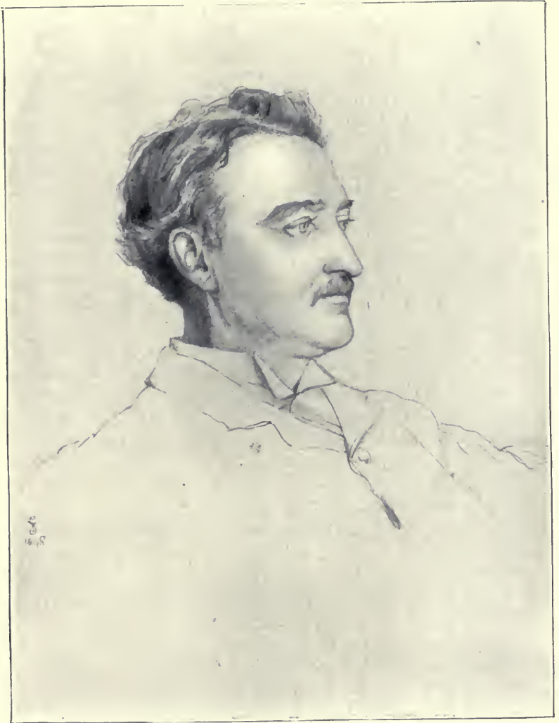
The Right Hon. Cecil J. Rhodes. (From a sketch by the Marchioness of Granby.)