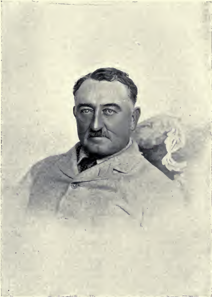
Photograph by S. B. Barnard,]