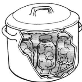
Figure 5. Boiling water bath canner and jars.