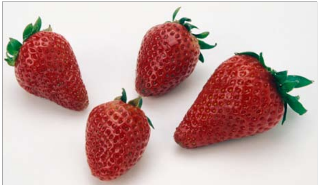
Figure 1. Photo of ripe strawberries.

The most common commercial varieties in California are the Camarosa, Diamonte, Chandler, and Selva. Proprietary and other varieties, representing about 32 percent of acreage, are bred and grown for individual shipping companies, and are not available to the public.