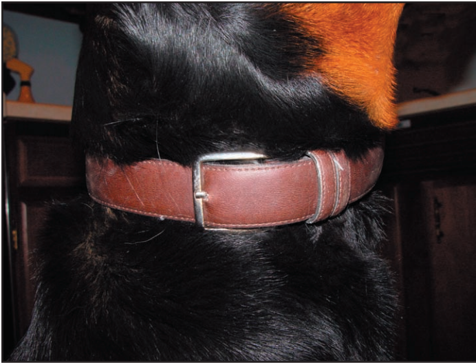
Leather flat buckle collar.

A harness will not place pressure on the dog's throat because it fits around the dog's chest and ribcage. Harnesses are also more difficult for a dog to slip out of than a flat buckle collar. The harness should be snug, but still allow two fingers to slip easily beneath it. Harness size is determined by the size of the dog's girth, the widest part of the ribcage just behind the elbows. To find your dog's harness size, simply measure the size around your dog's girth and add about two inches. Harnesses usually fasten with a buckle, so the size is adjustable. The harness package will list the size range in inches.