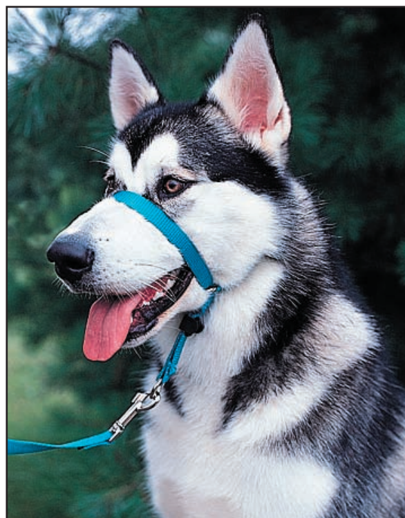
Gentle Leader® head collar.

Nylon collars are less likely to break or stretch than leather collars. They can be cleaned by simply using soap and water. A properly fitted flat buckle collar will be somewhat snug; however, you should be able to easily fit two fingers between your pet's neck and the collar. A