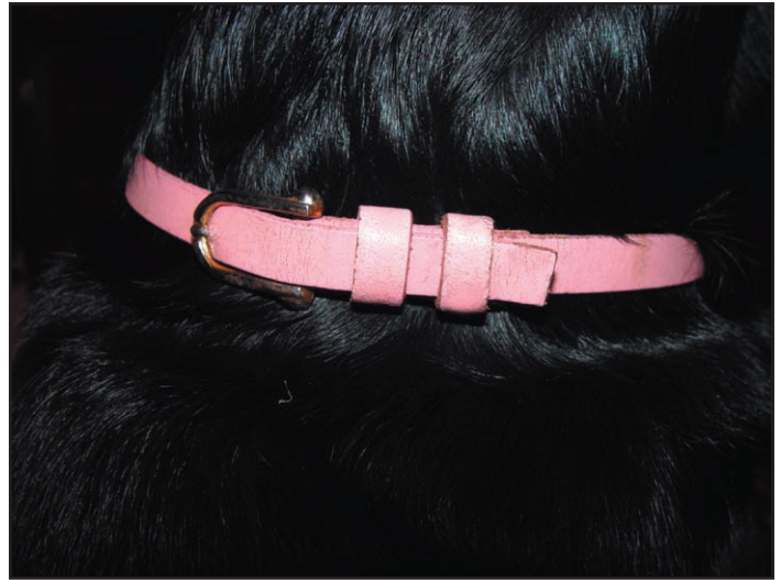
Leather flat buckle collar.

A head collar fits around the dog's muzzle and the neck. There is a nose loop and a neck strap, and is an excellent solution for a dog that pulls when it is being lead, or for a large dog with a small child. The head collar may look