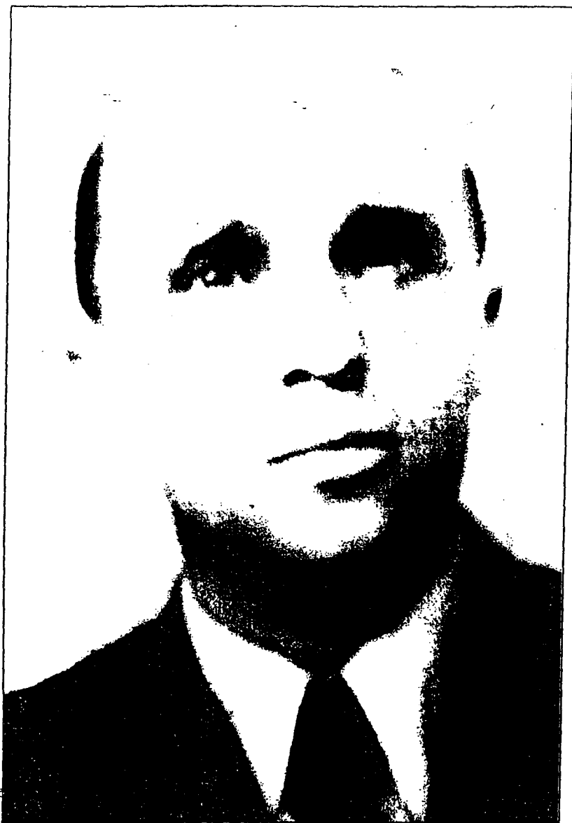
Mykola Lebed, a fervent Ukrainian nationalist, served as the UHVR's foreign minister. (C)