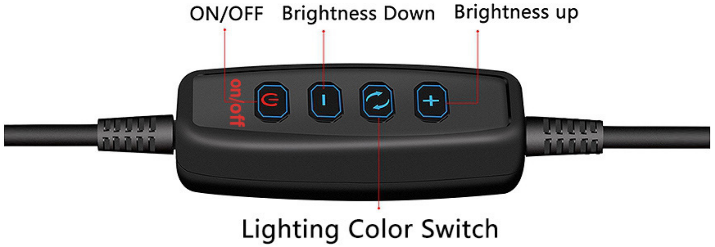
Mode1 : White