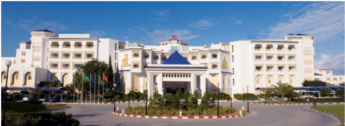
Le Palace Tunis Hotel

The venue of the 61st session of the WHO Regional Committee for the Eastern Mediterranean is Carthage Le Palace Hotel. This hotel is located on Cape Gammarth, 14 km north-east of Tunis.