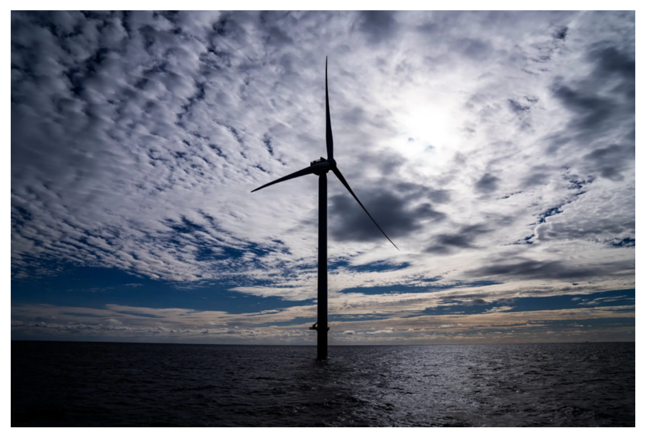
A wind turbine off the coast near Montauk, N.Y.

There is no evidence that offshore wind farms cause whale deaths. Mr. Trump has also railed against wind farms, saying falsely they cause cancer.