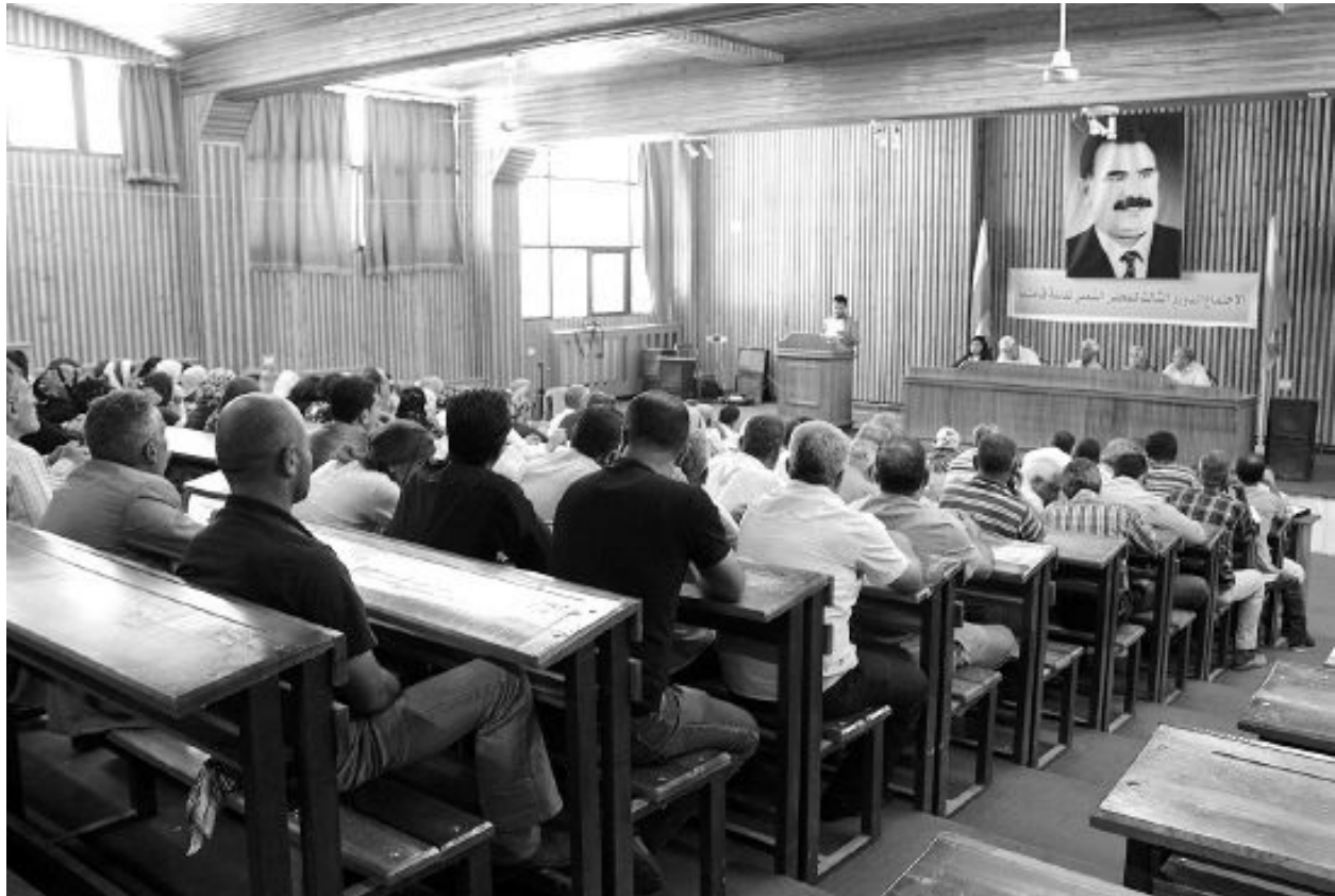
Figure 6.2 A meeting of the people's council of Qamişlo district