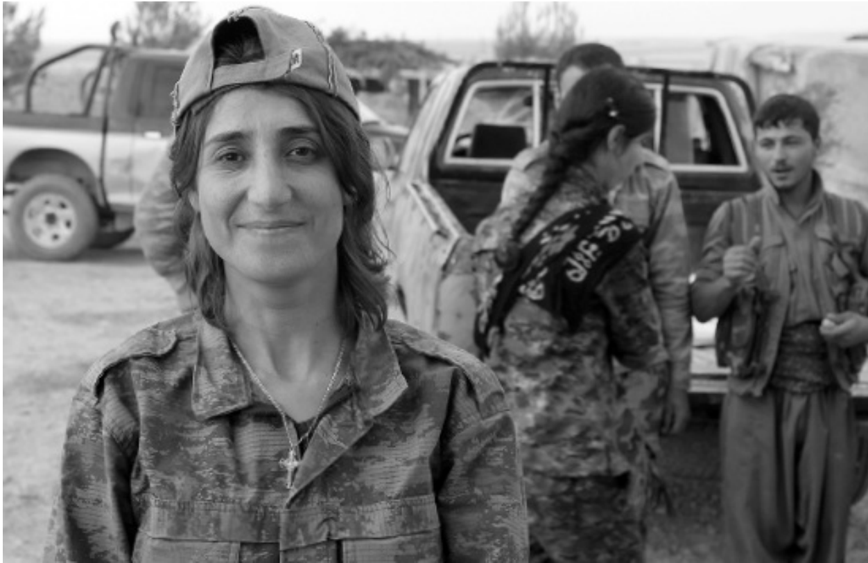
Figure 8.3 A Syriac YPJ fighter at Serêkaniyê