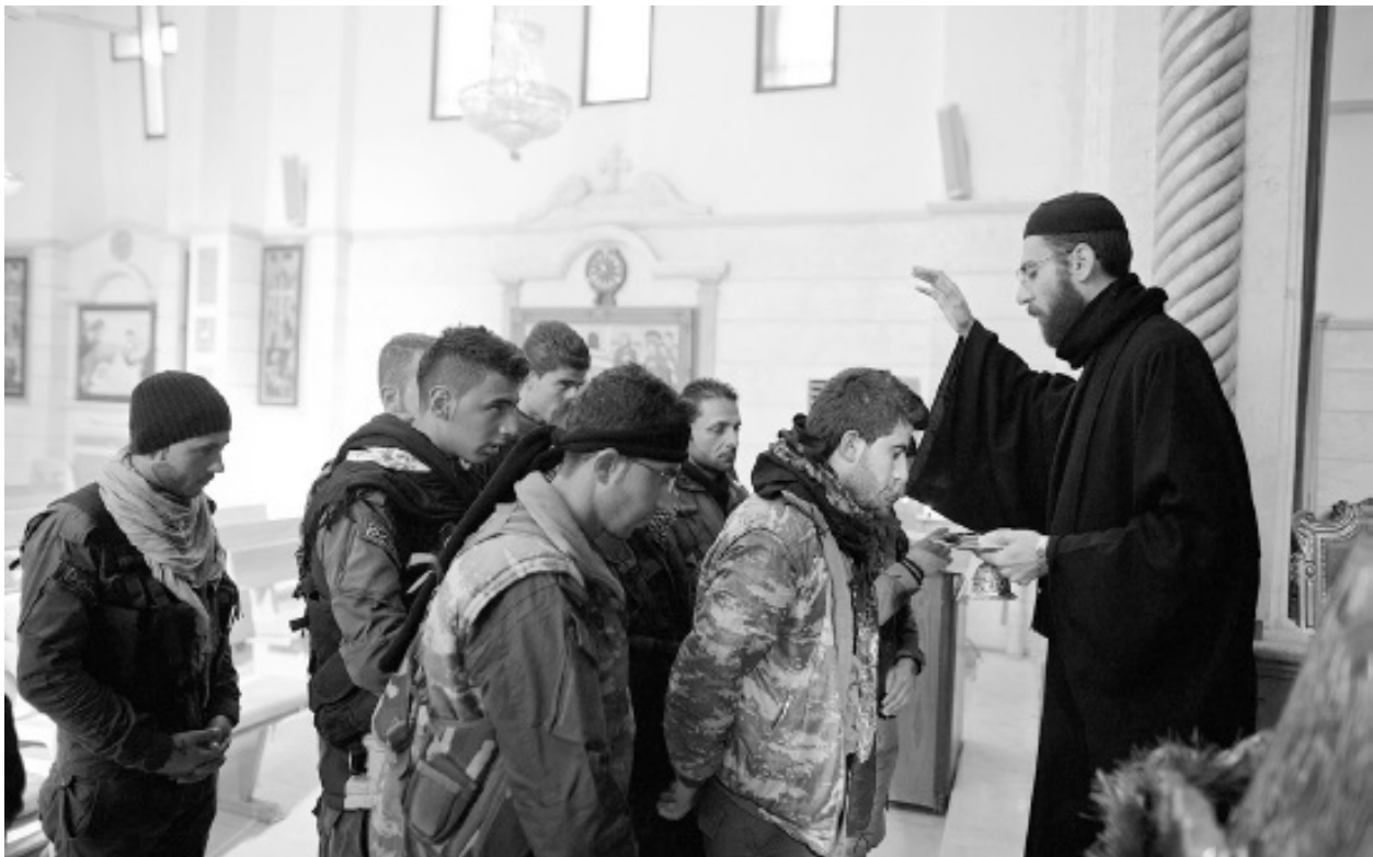
Figure 2.2 A Syriac priest blesses MFS fighters, Christmas 2014 in Dêrîk

He continued, "The Syrians and Armenians know well that without the YPG/YPJ, our homelands would have been lost and that the Democratic Autonomy system grants them an equitable place. For the first time in recent history, our languages are officially recognized."