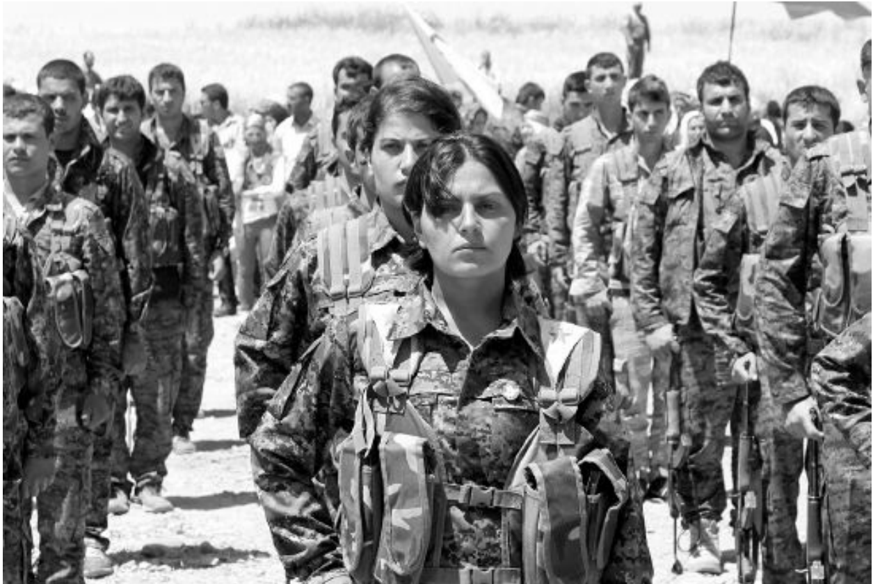
Figure 8.1 A YPJ and YPG muster