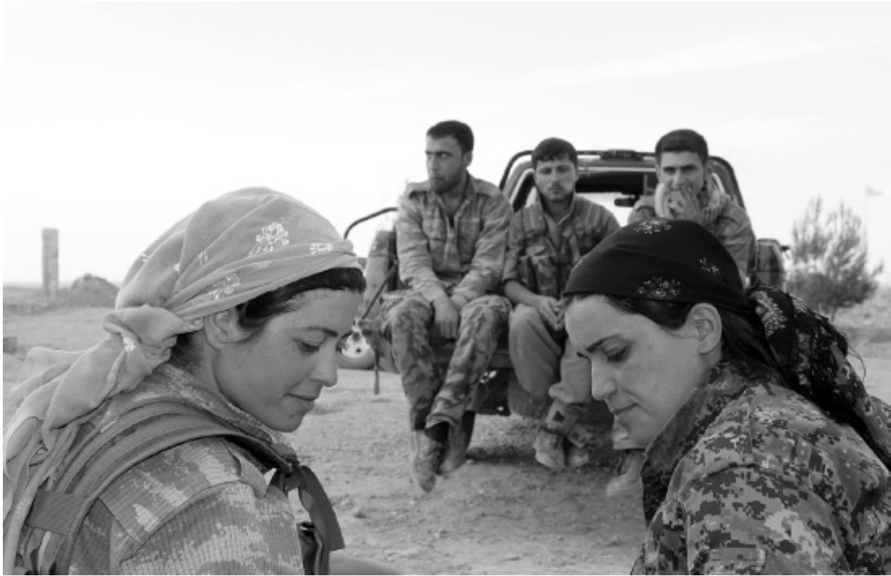
Figure 8.2 YPG and YPJ fighters at Serêkaniyê

The expanded defense force turned out to be absolutely necessary. In the summer of 2013, the first anniversary of the revolution, the war began: Jabhat Al-Nusra, IS, and parts of the FSA were all involved in attacks on Serêkaniyê [see 8.4], soon to be followed by attacks on places in Afrîn, Kobani, and Heseke. 6