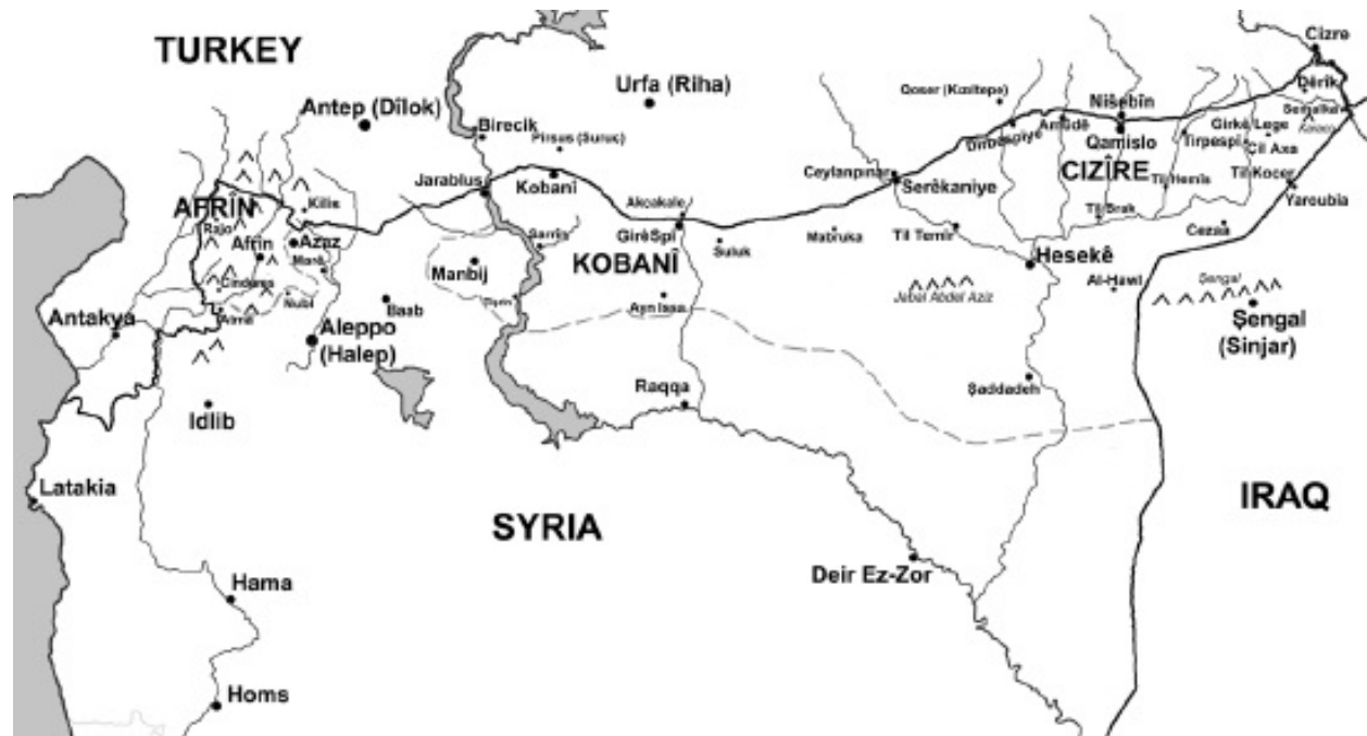
Figure 14.4 The war front as of July 31, 2016

Turkey, which delivers weapons and has even bombed the YPG/YPJ/SDF directly, in Jarabulus and in Girê Spî. While the United States supports the SDF through light weapons drops and air strikes, it does not take a clear position concerning Turkey or even Ahrar Al-Sham and the Al-Nusra Front, which control large parts of Idlib province as well as North Aleppo and are attacking non-Sunni villages. The YPG/YPJ are fighting these groups with all their might.