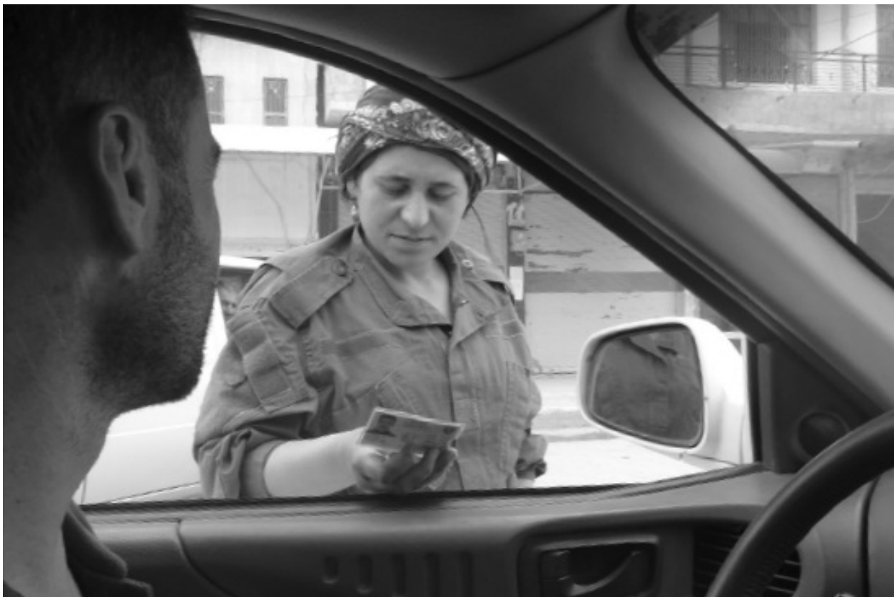
Figure 9.2 Asayîşa Jin, women’s security force, at a checkpoint in Tirbespî

The Asayîş are a mixed-gender institution—as of May 2014, women made up about 30 percent of the force. But there are also separate women’s units, Asayîşa Jin, that intervene especially in cases of patriarchal violence and domestic abuse. The principle is that women can talk to other women more easily and openly. Some women would feel very inhibited, for example, about reporting a rape, or an episode of domestic violence, to mixed or all-male Asayîş members. They have far fewer inhibitions about talking to young women. Asayîşa Jin units are closely tied to the women’s councils.