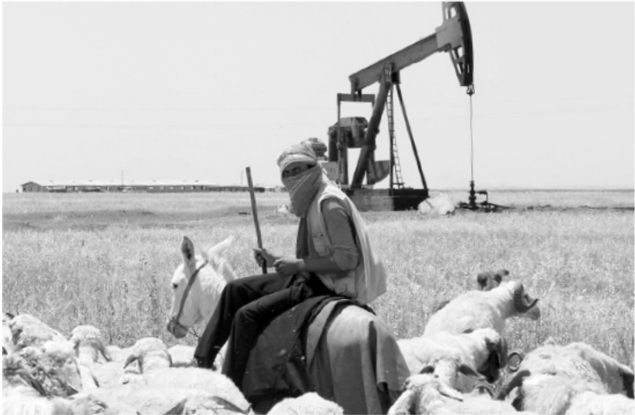
Figure 12.1 Oil, wheat, and animal husbandry in Cizîrê

mills—the wheat was transported to other parts of Syria. Cotton picked in Rojava was shipped south for textile processing. Then the milled flour, processed fruit and vegetables, textiles, refined oil, and other goods were brought back into Rojava for consumption.