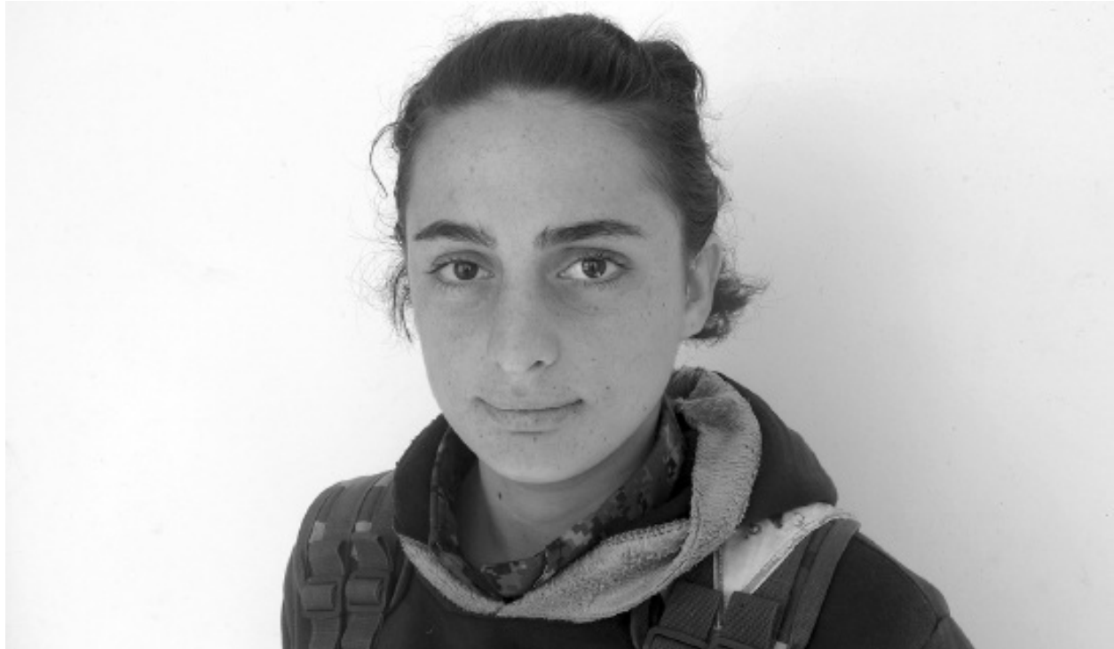
Figure 8.7 A student at the Şehîd Şîlan Women's Military Academy

twelfth grade. After eight months of education and training, she saw combat at Heseکہ and Til Hemîs. She doesn't think much of the IS fighters: "They can't fight. They don't resist. They run away."