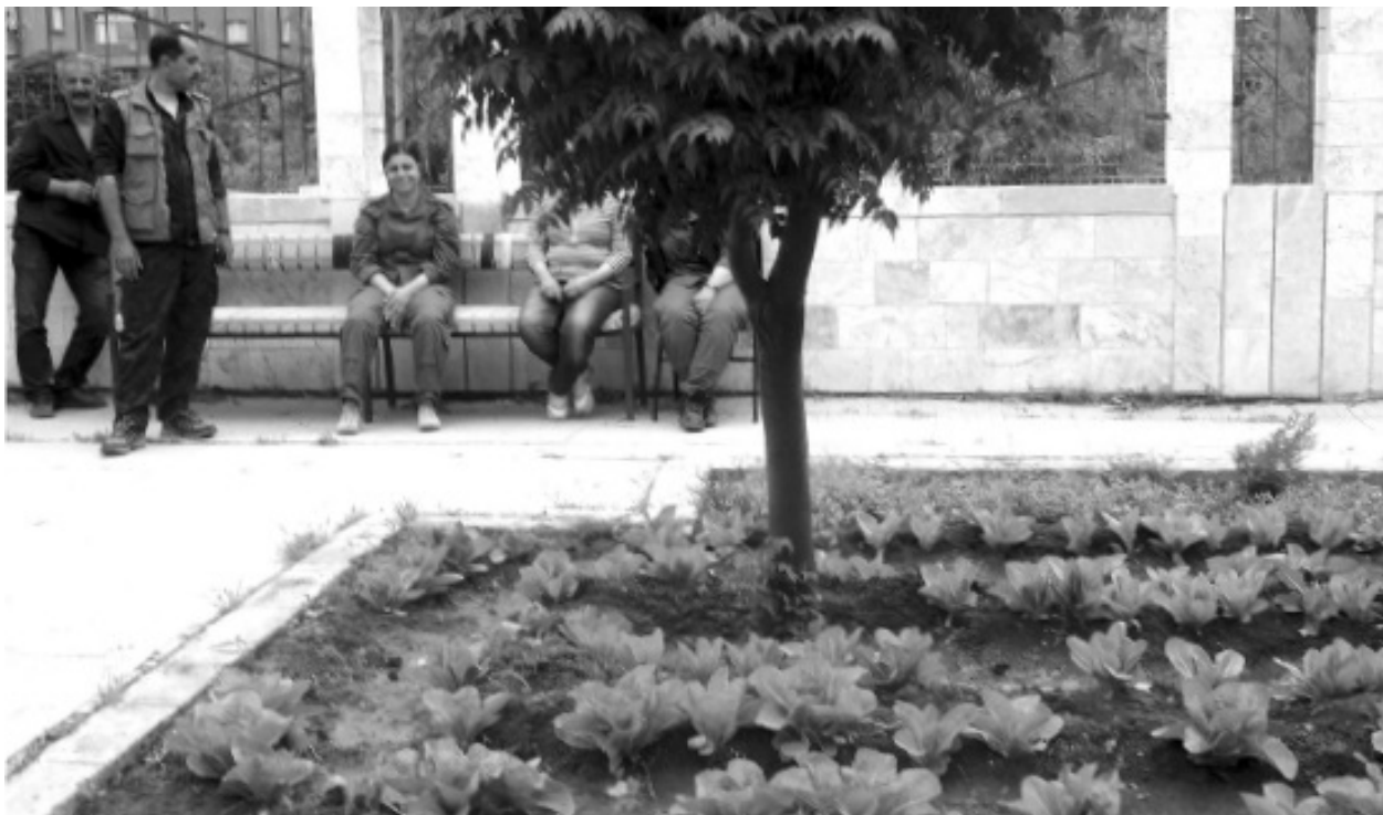
Figure 13.1 Urban gardening at the economics ministry in Dêrîk

In the 1970s, the Syrian state began applying chemical fertilizers and pesticides to crops, which doubtless damaged both soil quality and groundwater. But the imposition of the embargo has forced most farmers to use fewer chemicals, applying them at only a quarter or a third of previous levels. The big landholders make much more use of chemicals since they can afford them. Some small farmers are reverting to traditional use of manure, but as of 2015, not many. Using organic wastes as fertilizer has helped protect the soil, the water, and nature, even if it has reduced production. Since Cizîrê grows more than enough wheat, a decline in harvests of up to 50 percent would not be a serious problem from a nutritional standpoint, although a way of compensating the affected farmers will have to be found.