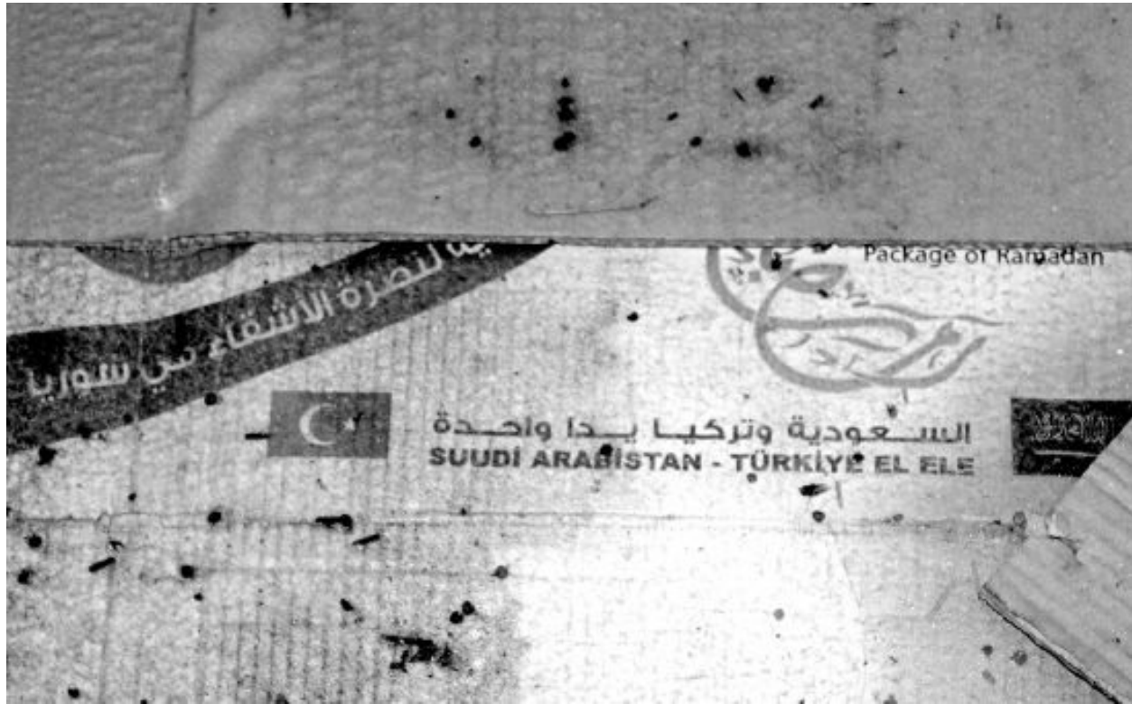
Figure 14.3 Discovery in a former IS training camp: the inscription says “Saudi Arabia and Turkey hand in hand”

Turkey provided weapons to the Al-Qaeda affiliate Al-Nusra, and as we saw, it allowed Al-Nusra to invade Serêkaniyê over its border. 49 On January 19, 2014, in Antep, a truck was stopped and found to be transporting grenades for the MÎT (Turkish intelligence) into the border town of Reyhanlı. The truck driver admitted that once there, he was to hand over the weapons to Al-Nusra. 50 In 2015, Al-Nusra, as part of the Jaish Al-Fatah alliance, as well as Turkish troops, attacked Afrîn. 51