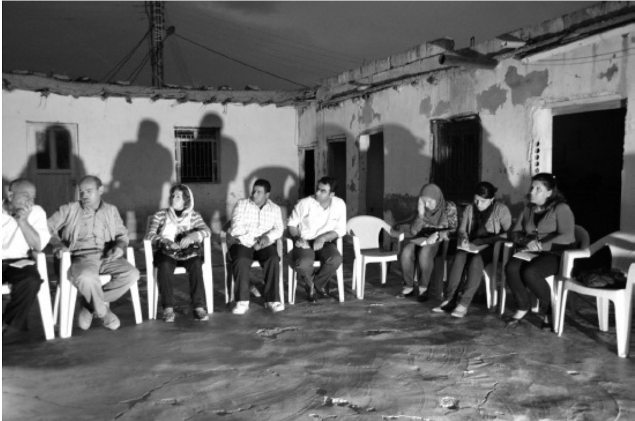
Figure 6.1 A meeting of a neighborhood people's council in Dêrk

Parties, NGOs, and social movements are not usually involved in the lower levels, since in these, people participate broadly, outside the context of political parties.