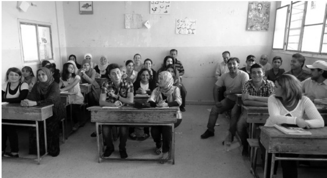
Figure 10.1 Kurdish-language instruction in Serêkaniyê

The academy stands on a hill in the outskirts of Qamişlo, on a spot formerly occupied by the Institute for Agrarian Economy; the building is ringed by great expanses of land, still available to staff and students for farming. The location, Berîvan explains, "creates an environment somewhat isolated from the city, suitable for study." The academy coordinates the whole education system of Cizîrê canton, provides materials for instruction, and trains teachers.