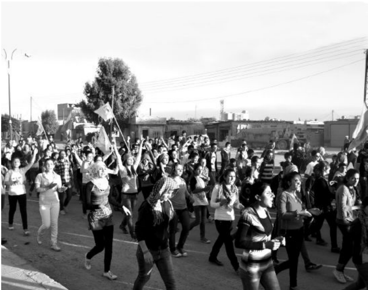
Figure 5.4 A women's demonstration in Qamişlo

Still, women have taken many steps forward in the liberation of women. The most important has been to organize. When women create strong organizations, they clarify for themselves and each other how to imagine another life, and when they use the organization's force to put their imaginings into practice, they have a lever to wield against any future structural oppression. And as Ilham Ahmed points out, now that they have made such considerable sacrifices, they are not going to back down.