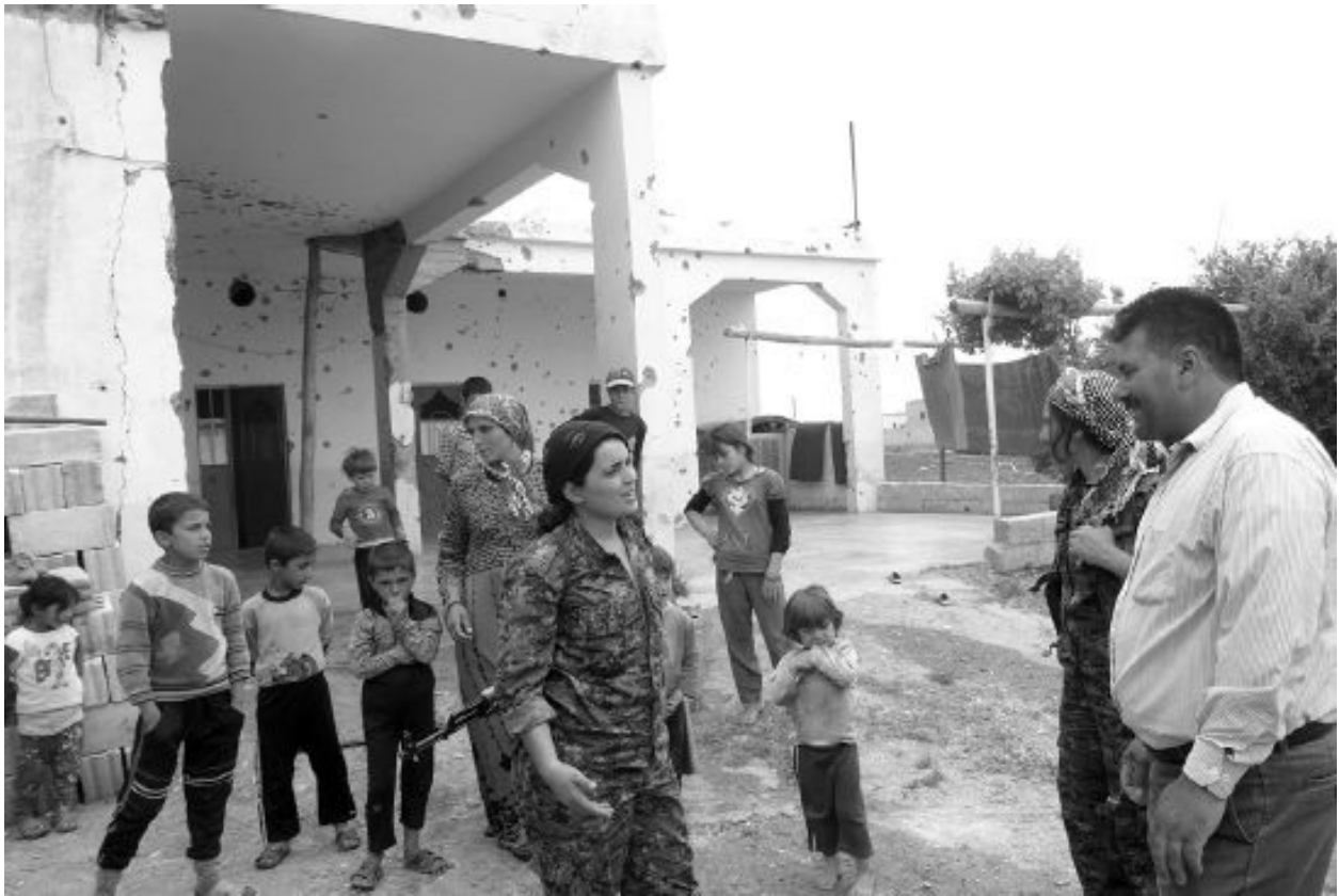
Figure 8.5 The ruined village of Keşte, near Til Xelef, May 2014. The inhabitants are returning only twenty days after the YPG/YPJ liberated the village

died along the way or were wounded.” The border crossing at Ceylanpınar was only one hundred meters away.