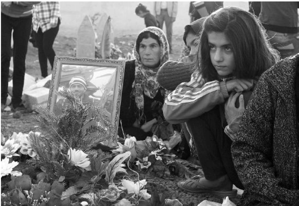
Figure 7.1 Memorial day for martyrs

Vital to any society at war is an institution that cares for the families of those killed in action. In Rojava, the Association of the Families of Martyrs (SMS) offers psychological support for families, keeps them socially active, and shares in their mourning. It offers funeral services and gravesite tending; it also provides material support, even food for widowers, widows, and orphans. SMS also organizes support for families of murdered civilians.