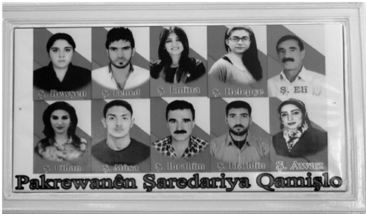
Figure 6.4 The martyrs of the Qamişlo city hall

Despite the terror from IS and others, the City Hall staff were not intimidated and those who survived returned as soon as possible to continue serving the people.