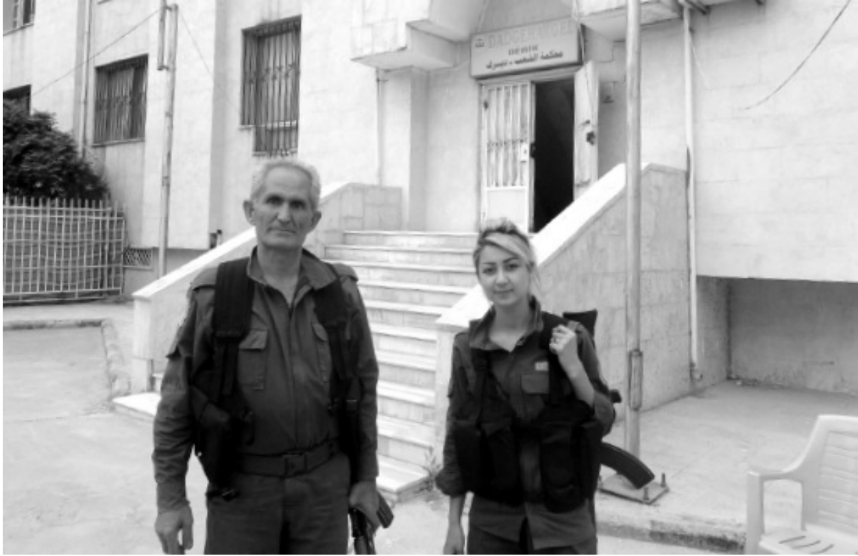
Figure 9.1 Guards at a courthouse in Dêrîk