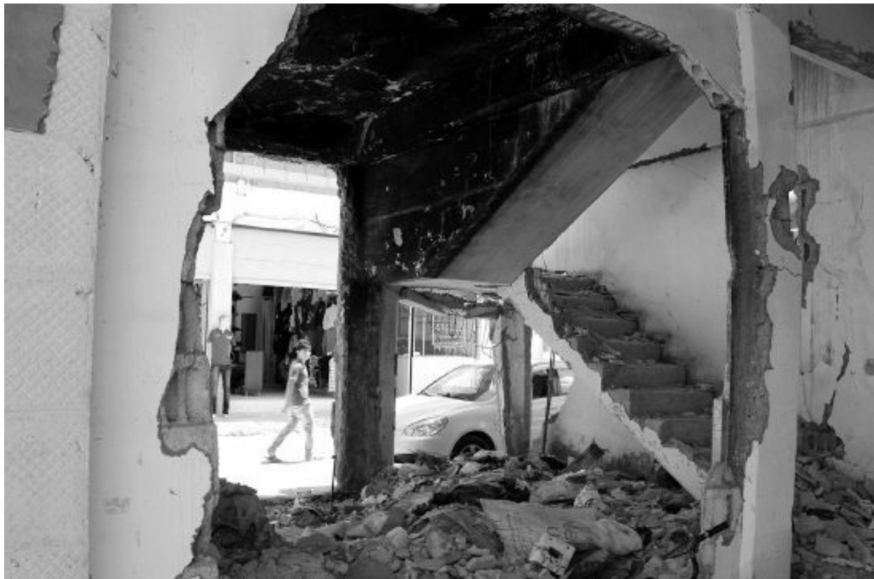
Figure P.1 A house bombed to rubble in Tirbespî

As we pass through the small city of Tirbespî (in Arabic, Al-Qahtaniyah), we see a bombed-out house. Two months earlier the Islamists attacked it, explains our companion Cûdî, martyring a heval . 3 But the YPG [see 8.1] fended them off, so they are now trying suicide bombs. To prevent attacks, Asayîş and volunteers patrol the streets in 24-hour shifts. They don't earn any salary—they just want to protect their free country.