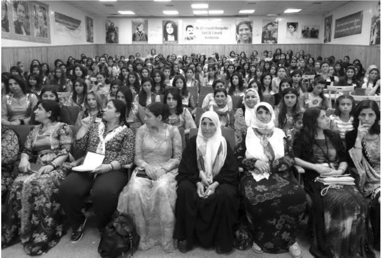
Figure 5.3 Conference of Young Revolutionary Women, May 2014 in Rimelan