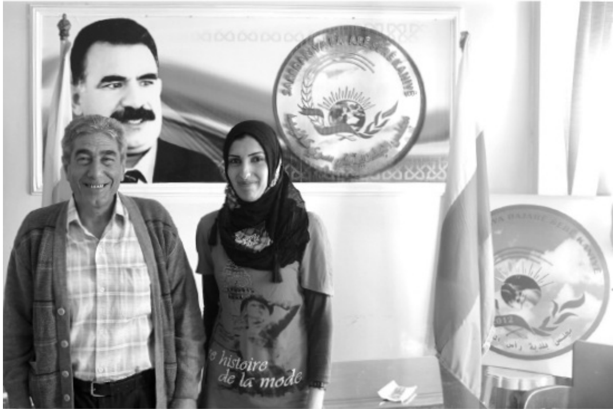
Figure 5.2 Dual leadership: The co-mayors of Serêkaniyê