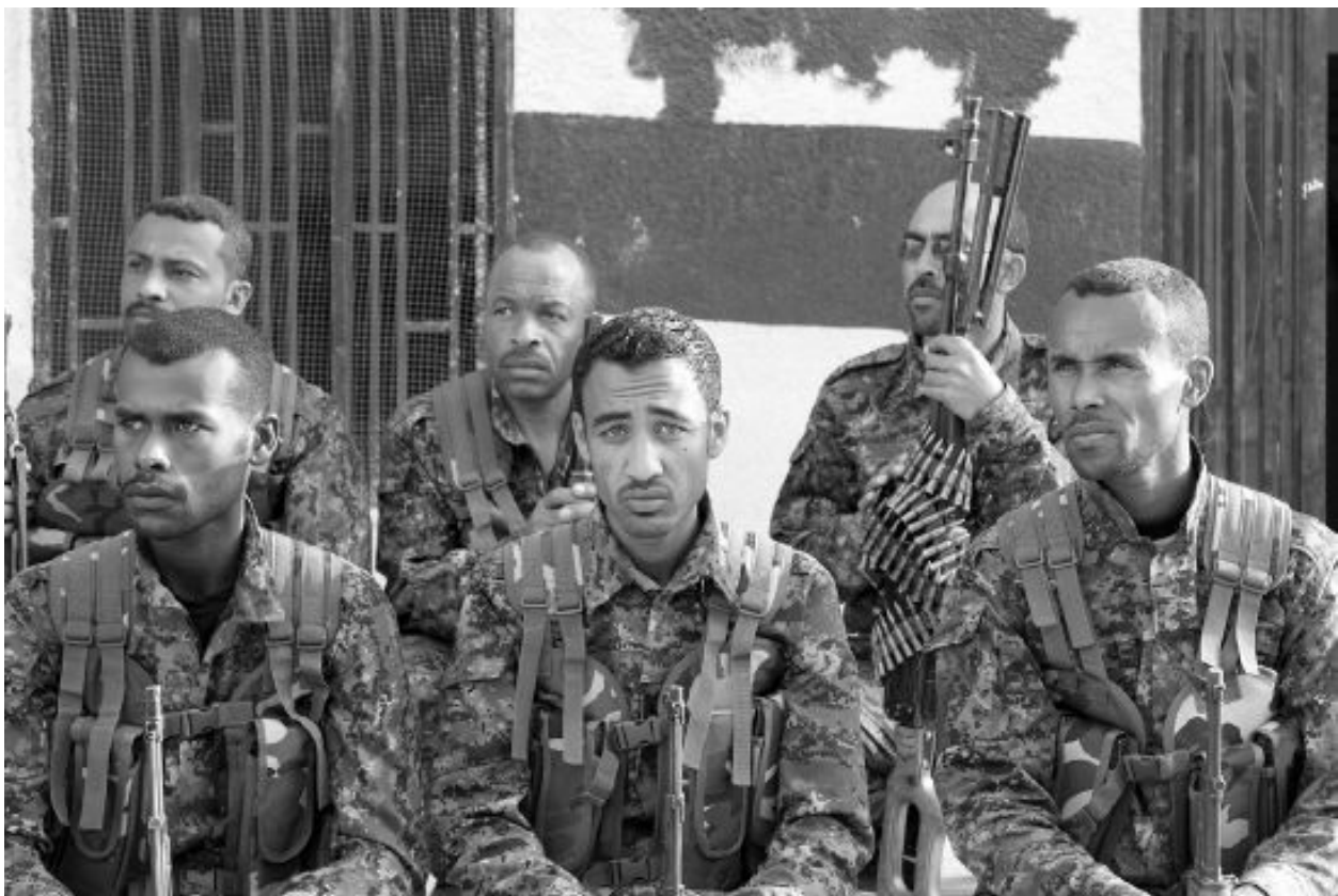
Figure 2.1 Members of an Arab unit at Til Koçer