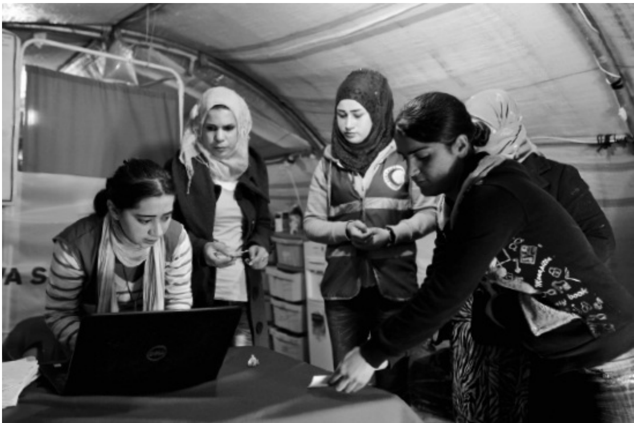
Figure 11.2 A team from Heyva Sor (Kurdish Red Crescent) coping with shortages

Kurdish Red Crescent (Heyva Sor a Kurdistanê, HSK), with 180 employees in Cizîrê canton (as of May 2014), helps the health assemblies organize medical and other humanitarian aid. In the larger towns, HSK offices accept donations of clothing and other necessities, which it then distributes under the supervision of the health assemblies.