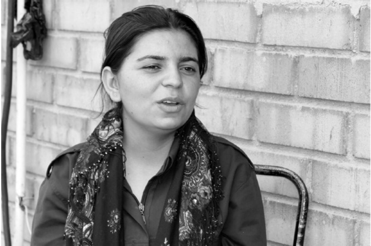
Figure 8.8 An Arab YPJ fighter undergoing officer training at the Sehîd Jînda Academy