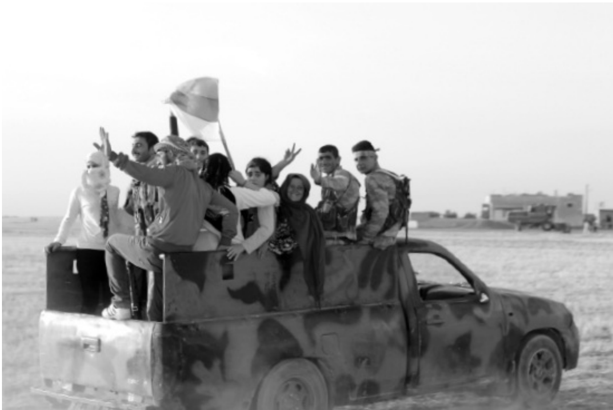
Figure 15.1 Civilians and YPG/YPJ fighters in a pickup after a demonstration