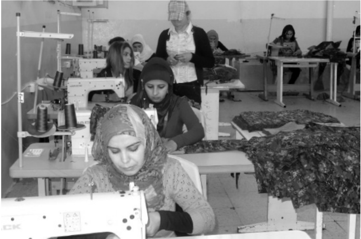
Figure 12.2 A sewing cooperative in Rimelan

“We urgently need generators, but they get seized at the South Kurdistan border. If we had more machines, we could provide other parts of Rojava with better-quality clothing at lower prices. There are many war profiteers—because of the embargo, they can set prices at their whim.”