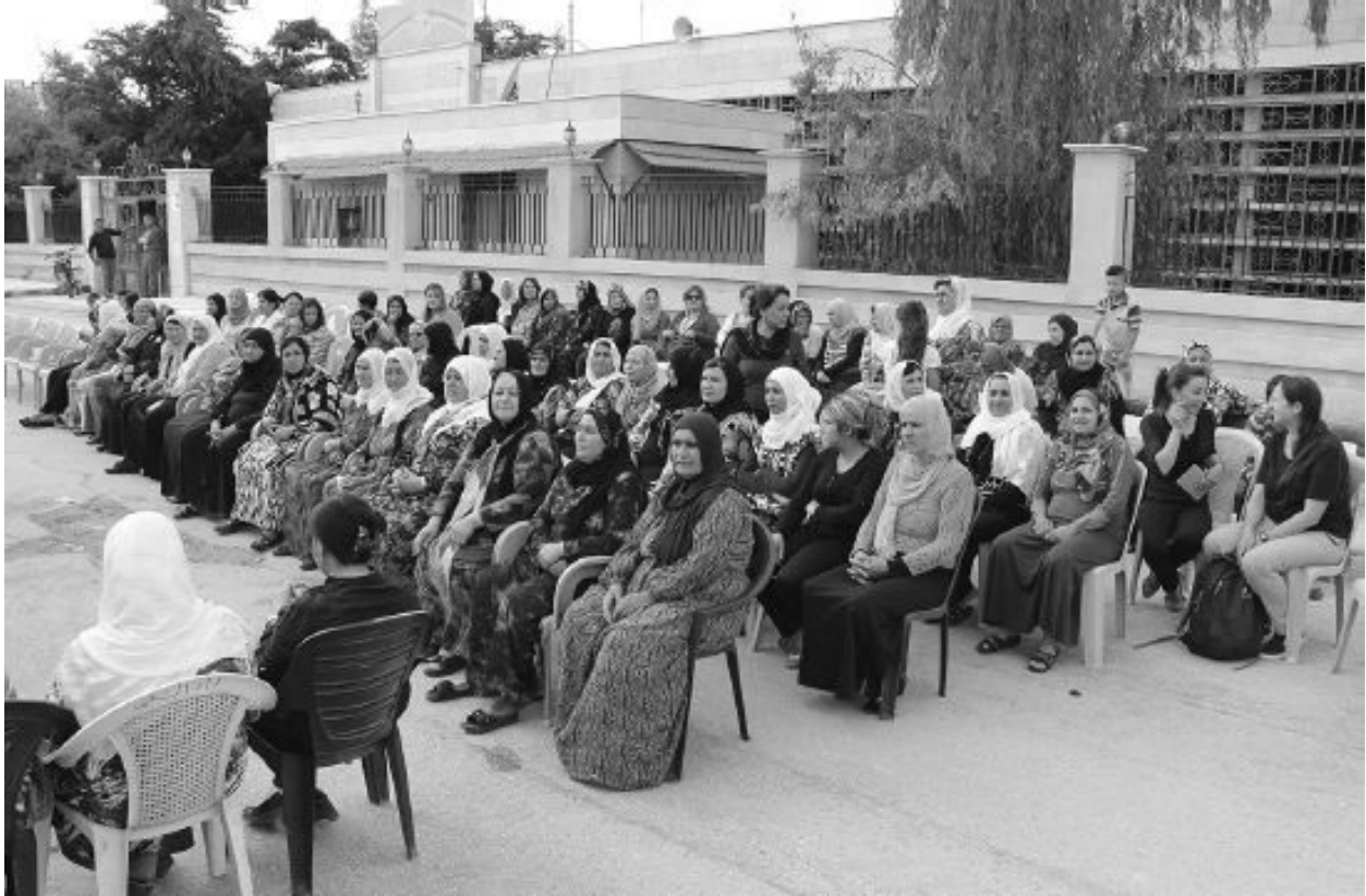
Figure 5.1 A Kongreya Star assembly, Dêrîk

In building Yekîtiya Star, explains Şîrîn, the primary goal was to educate the whole society politically. Political education is still the core of their work: “Twice a month we visit women in the neighborhood and explain the agenda of the revolution.” Their goal is to visit every woman in Hilelî at home, regardless of whether she is part of the Kurdish movement. “We even go to [women of] the KDP,” she says. “Many women still have the mentality of the state—they don’t see themselves as people who can function politically. They have lots of kids, and they have conflicts at home.