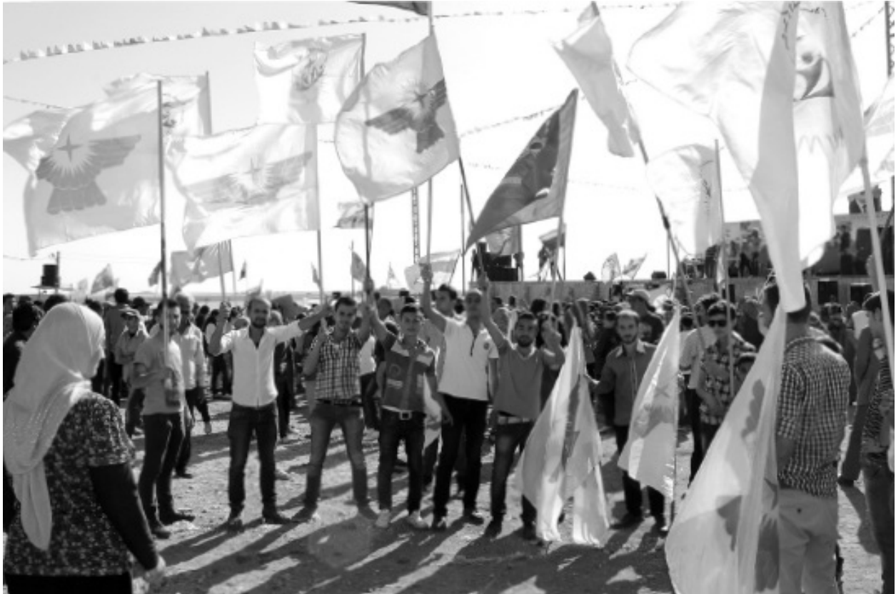
Figure 14.2 Syrians join a demonstration against the ditch dug by the KDP to reinforce the embargo

“active policy of exclusion and hostility toward the Kurds in Turkey, Syria, and Iran.” 38 Indeed, it shares responsibility for the embargo against Rojava, alternatively loosening and tightening it based on its own political interests. It opens and closes the pontoon bridge crossing at Semalka at will. In February 2014, the KDP even decided to dig a 20-mile-long trench along its border with Rojava, ostensibly in defense against jihadists but in reality to prevent cross-border trade and to complete the embargo.