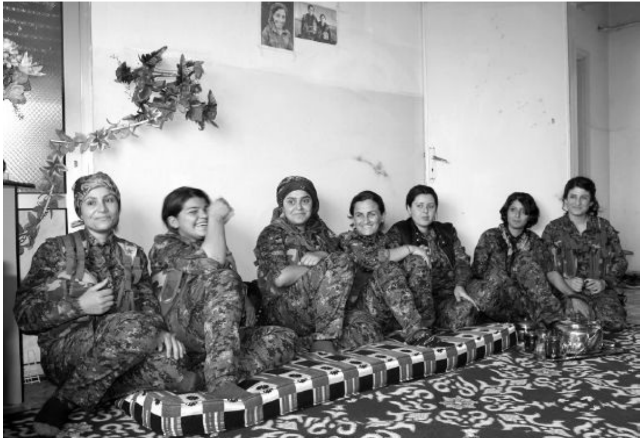
Figure 8.6 A mobile YPJ unit at Til Koçer

filthy. The Islamists hadn't built anything, only plundered and robbed and ruined. Everywhere we came across their drugs and their trash. That's why the local people call them çete , 'gangs.' When the townspeople came back, they welcomed us, embraced us, kissed us. Some gave us gifts, a pitcher of yogurt or some cheese they'd made."