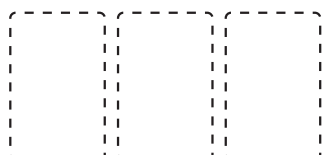
HAND PLAYER A