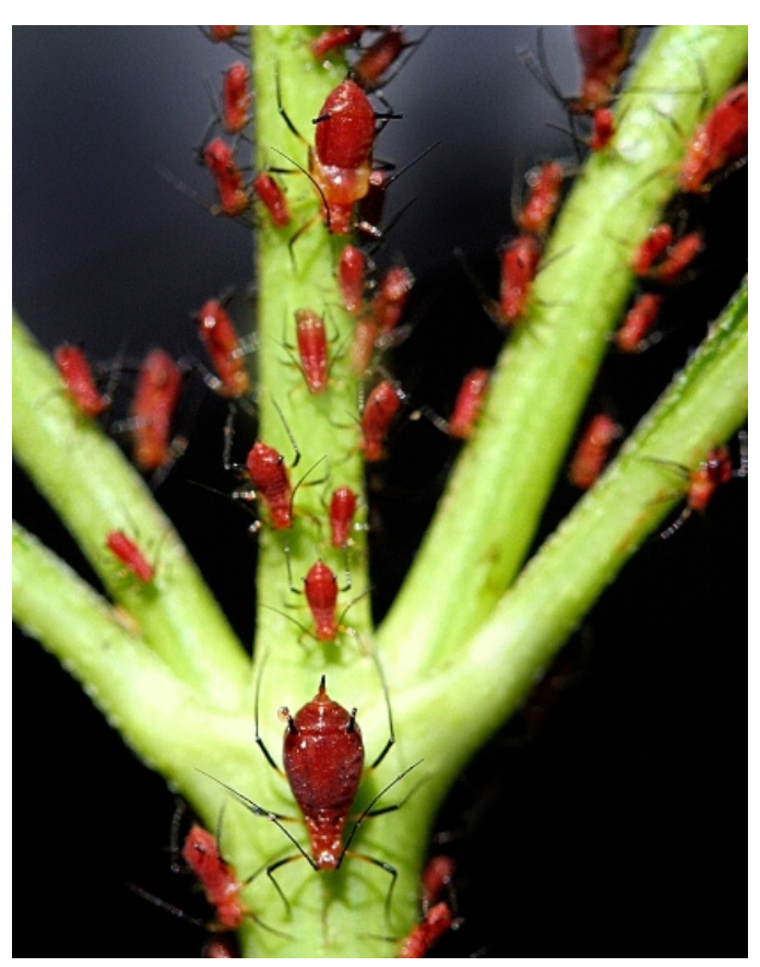
Pink and red potato aphid adults.