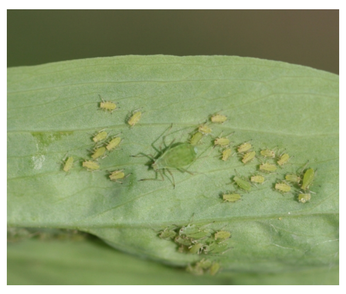
Adult aphid and various nymph sizes on a lettuce leaf.