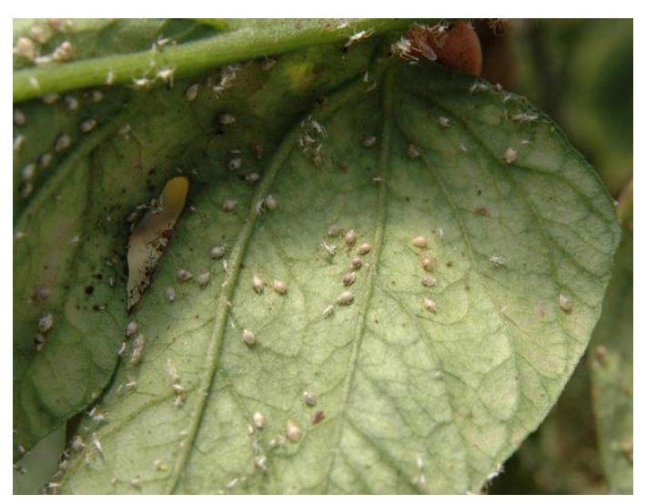
Tiny aphids on a tomato leaf.

Nymphs are similar to adults, but smaller. Aphids are born live for most of the season, so you usually won't see any eggs.