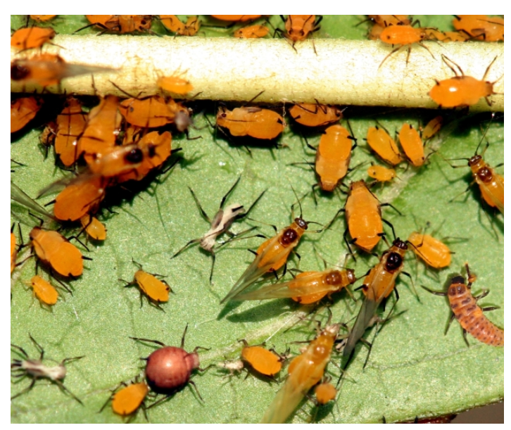
Many aphids, showing some with wings, ladybug larva predator, and mummy aphids.

4) Release predators . Lady beetles, parasitic wasps, aphid midges, and lacewings can also be purchased and released into the garden. Look for them in gardening and seed catalogs.