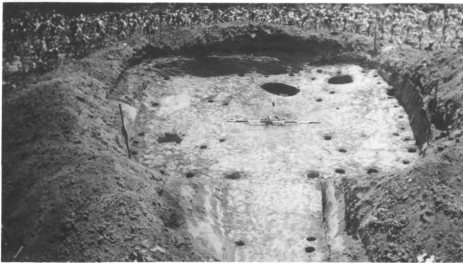
Criterion D - Champe-Fremont 1 Archeological Site, Omaha vicinity, Douglas County, Nebraska. This archeological site, dating from ca. 1100-1450 A.D., consists of pit houses and storage pits which have the potential to yield important information concerning the subsistence patterns, religious and mortuary practices, and social organization of the prehistoric residents of eastern Nebraska.