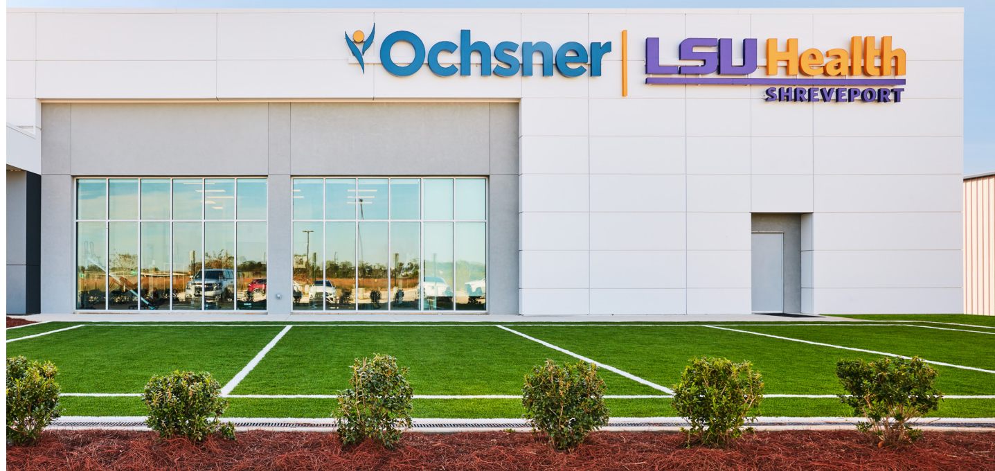
Ochsner LSU Health Shreveport - Viking Drive Multispecialty Center, Bossier City, La. opened in November 2021 greatly expanding our footprint in Bossier Parish offering primary care, neurosurgery clinical care, orthopedics and sports medicine.