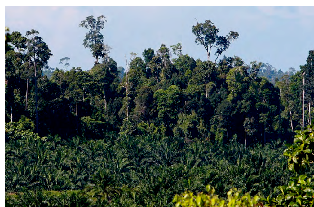
Fig. 4. Oil palm plantation adjacent to tropical forest in Sabah, Malaysia.