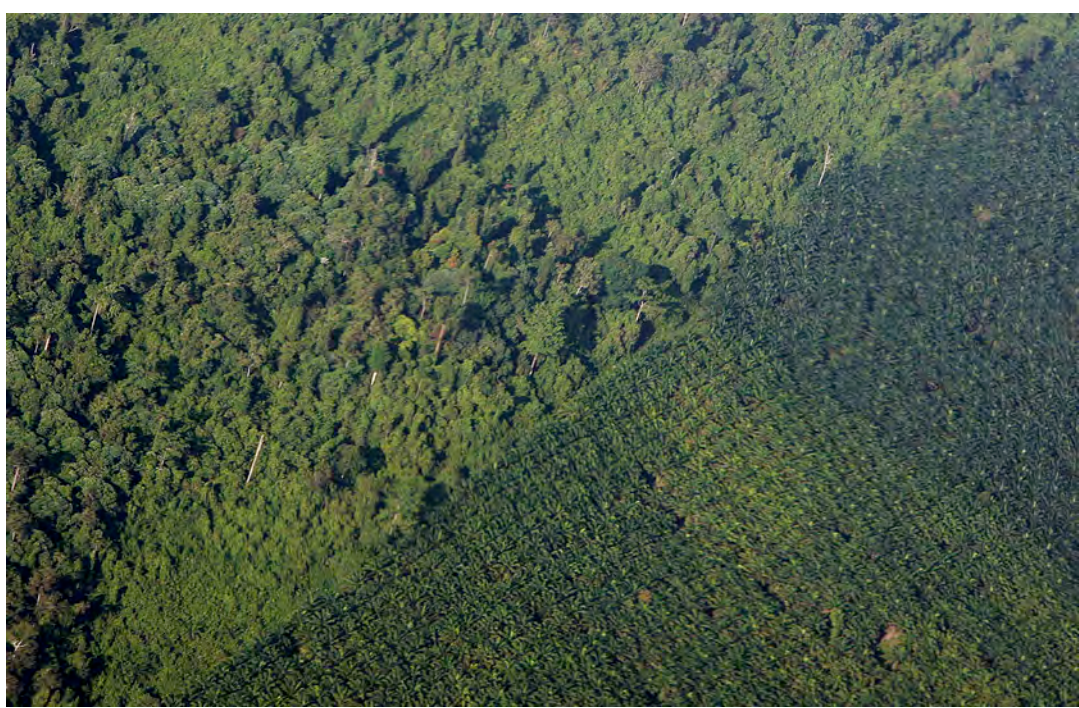
Fig. 3: Oil palm plantation adjacent to tropical forest in Sabah, Malaysia.

Key ecosystem services are also seriously diminished in oil palm plantations. On average, such plantations store less than 40% of the carbon found in native forests (assuming typical above-ground carbon values of 75 tons \text{ha}^{-1} for oil palm plantations and 200 tons \text{ha}^{-1} for native forest; [23-25]). At present, intact forests in the Amazon are a massive carbon stock, with forested lands suitable for oil palm storing around 42 billion tons of carbon [4], an amount equivalent to all global, anthropogenic carbon emissions for six years. Thus, large-scale expansion of oil palm production into forested areas could have serious, long-term impacts on carbon storage [25; 26] and other ecosystem services in the Amazon.