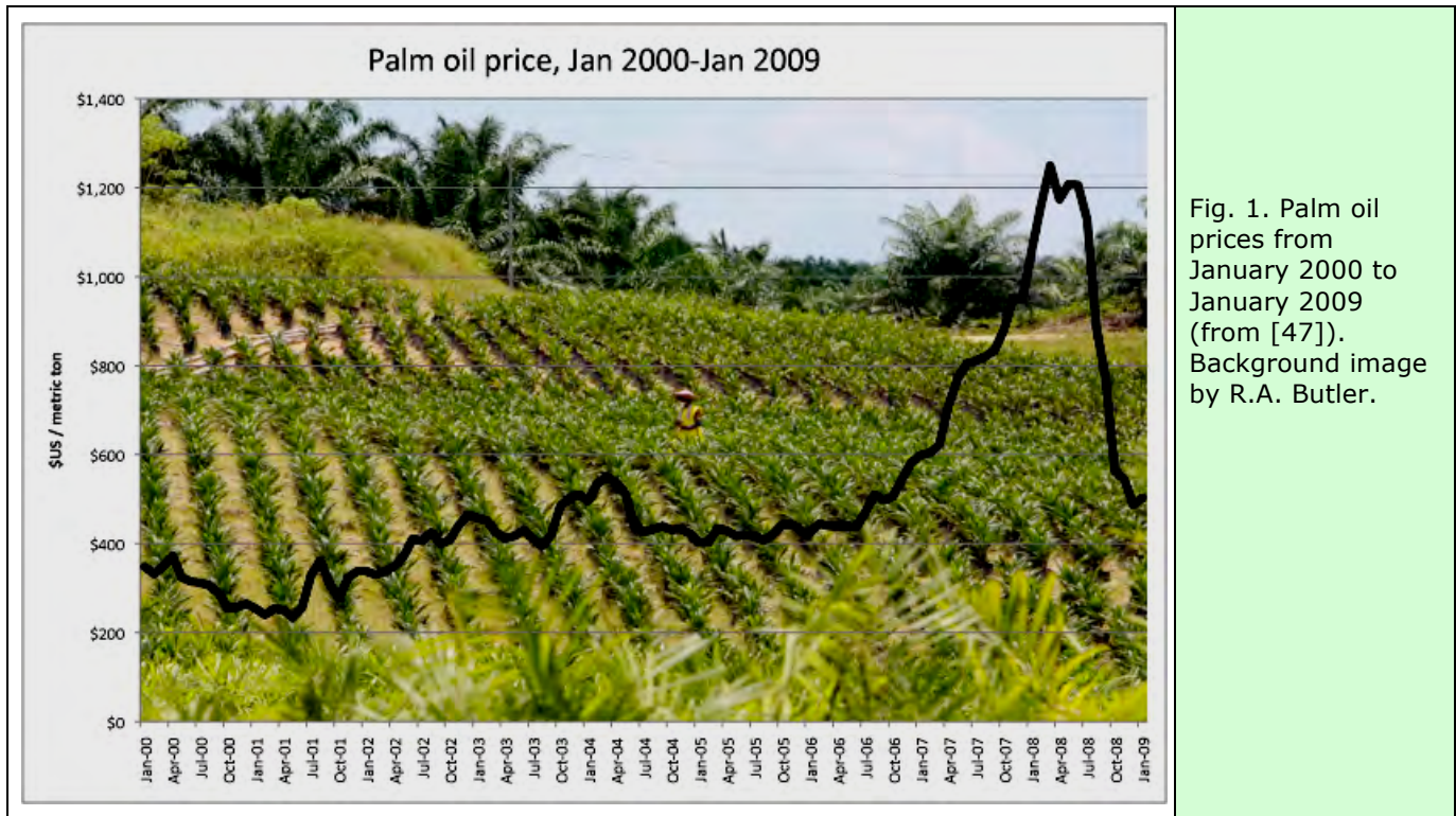
Fig. 1. Palm oil prices from January 2000 to January 2009 (from [47]).

Yet few realize that oil palm could soon drive similar forest loss in Amazonia, the world’s largest expanse of tropical forest. Here we briefly describe the confluence of factors that could promote a sharp increase in oil palm agriculture in the region. Although the crop is being established in various parts of Latin America, we focus here on Brazil, where geographical, political, and corporate forces appear particularly aligned to pursue the aggressive expansion of an oil palm industry. We argue that, contrary to prevailing public discourse in Brazil, oil palm expansion would constitute a serious threat to Amazonian ecosystems and their associated biodiversity.