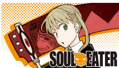
Soul Eater Atsushi Ohkubo