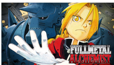
Fullmetal Alchemist Hiromu Arakawa