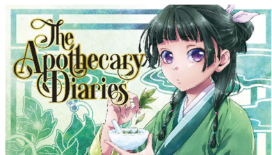
The Apothecary Diaries