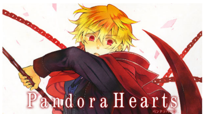
PandoraHearts Jun Mochizuki