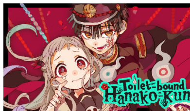
Toilet-bound Hanako-kun Aidairo