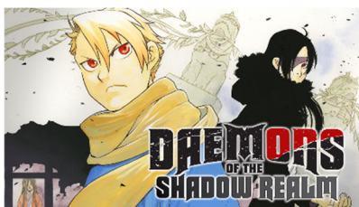
Daemons of the Shadow Realm Hiromu Arakawa