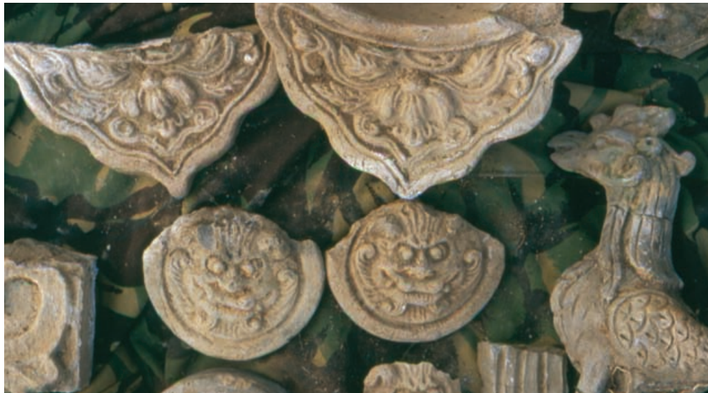
FACING PAGE: THE INTERIOR OF A WATCHTOWER, TOP, ONCE SERVED AS A HOME FOR SENTRIES. A RARE ROUND TOWER, BOTTOM, THOUGHT TO BE A DESIGN EXPERIMENT MAY HAVE PROVIDED A BETTER VIEW. ONE OF THE OLDEST-KNOWN PORTIONS OF THE GREAT WALL, BUILT IN CA. 300 B.C. NEAR THE MONGOLIAN BORDER, ABOVE, WAS INCORPORATED INTO WALLS OF THE QIN AND HAN DYNASTIES. VARIOUS DECORATIVE ELEMENTS, INCLUDING ROOF TILES WITH MONSTER FACES, WERE FOUND IN RUBBLE ON THE UPPER STORY OF A MING DYNASTY WATCHTOWER IN HEBEI PROVINCE.

economic growth, which in turn is changing lifestyles, the Great Wall takes on added importance by offering preservationists a new horizon in their seemingly futile quest to tackle conservation of the world's largest cultural relic in the world's most populous country and most rapidly booming economy.