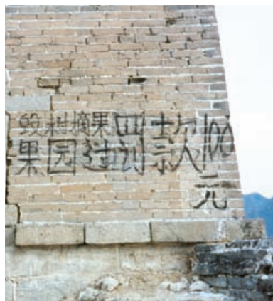
OVER THE CENTURIES, THE GREAT WALL OF CHINA HAS SUFFERED NOT ONLY THE EFFECTS OF OLD AGE BUT OF VANDALISM, LEFT, AND ENCROACHING DEVELOPMENT, BELOW. PHOTOGRAPHS AT RIGHT DEPICT THE SAME STRETCH OF THE WALL IN 1908, TOP, AND 1987, BOTTOM. THE TOWER WAS HARVESTED FOR BUILDING MATERIALS MOST LIKELY DURING THE CULTURAL REVOLUTION.