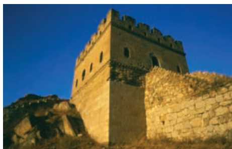
IN 1584, ABRAHAM ORTELIUS PUBLISHED THE FIRST MAP OF CHINA IN THE WEST, FACING PAGE, WHICH INCLUDED A DEPICTION OF THE GREAT WALL. SINCE ITS ABANDONMENT, THE ONCE-PAVED WALL HAS PROVEN AN IDEAL HOST FOR EXUBERANT VEGETATION, ABOVE. A WATCHTOWER, LEFT, AND THE FORTRESS AT JIAYUGUAN, BELOW, WHICH MARKS THE MING WALL'S WESTERN TERMINUS.