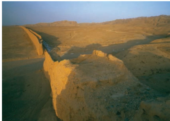
A SECTION OF WALL COMPOSED OF RAMMED EARTH RUNS THROUGH THE DESERT IN THE PROVINCE OF NINGXIA, ABOVE. WATCHTOWERS, FACING PAGE, PUNCTUATE A VAST STRETCH OF THE GREAT WALL NEAR BEIJING.

In mountain areas, village buildings themselves might also be considered part of the landscape, as many were wrought of material removed from the wall during the destructive revolutionary campaigns of the Great Leap Forward (1958–1959) and Cultural Revolution (1966–1976), when Chairman Mao Zedong urged