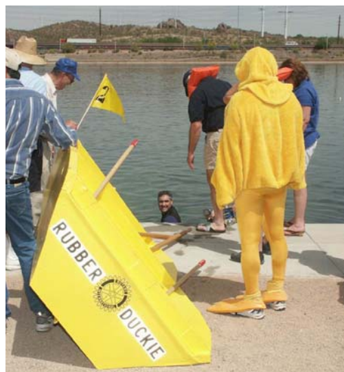
Everyone's favorite Rubber Ducky...