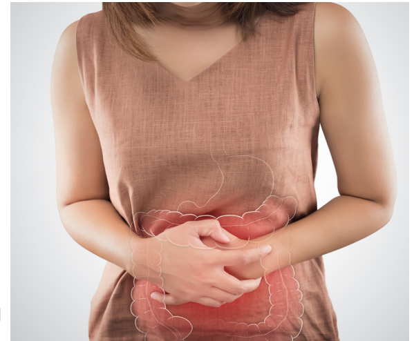
Laxatives can do more harm than good if used improperly: get the facts!

Some people take large quantities of laxatives at one time. Others take small amounts of laxatives, perhaps not more than the “recommended dose,” but on a fairly regular basis. Most young, healthy people should rarely, if ever, require a stimulant laxative, and laxatives should never be used in higher than directed doses or over long periods of time. Once the pattern has started, however,