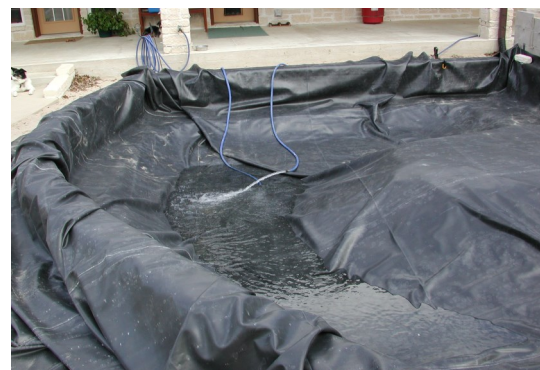
A pond properly constructed with tiered sides and ledges for plants. Fill the pond gradually, as above, to equalize the pressure between the liner and the ground. The above ground berm prevents contamination from stormwater runoff.

Ornamental ponds that are constructed 2/3 below ground are kept warm during cold weather and cool during hot weather, but such excavated pools may have problems with run-off. Run-off water may have contaminants and cause muddiness and oxygen problems in your ornamental pond. Additionally, rainwater saturation of the soil underneath the pool can float the ornamental pond structure, so it is important to use under-pool drainage or a water-pressure relief system and to know the soil type present in your area. Consult with the United States Department of