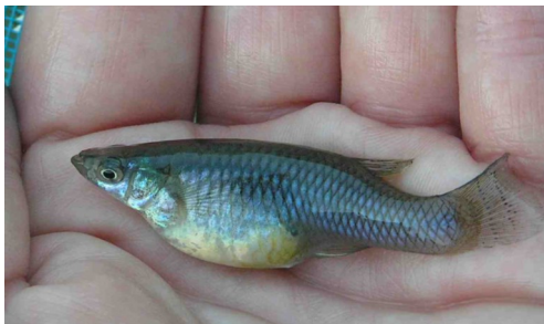
Gambusia , also known as mosquitofish, is a genus of small topminnows, shown here in the palm of a hand. These small fish are often stocked in ornamental ponds to help control noxious insect larvae.

Goldfish and koi host numerous forms or varieties that usually differ in coloration, fin shape, or eye or body conformation. However, normal body structure characteristics, such as those found in the comet goldfish or common koi, typically survive and thrive better in water gardens than some of their oddly-shaped or oddly-finned counterparts. Koi require a lot more room and dietary attention than goldfish, and can grow quite large sometimes living between 60 and 70 years, although 20 years or less is more common in ornamental ponds.