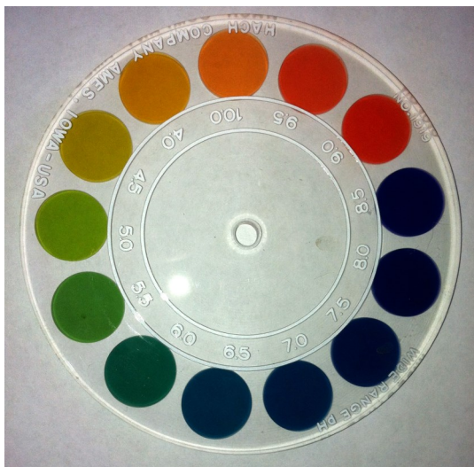
Simple water test kits may be purchased to determine the pH, alkalinity, hardness and ammonia concentration of your pond.

Pollutants may also harm the ornamental ponds health. A simple bioassay can be performed to test for the presence of such contaminants by placing a few baitfish, such as fathead minnows purchased from your