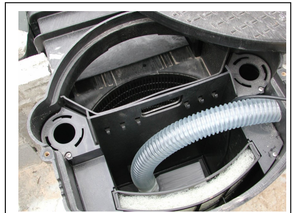
This mechanical filter collects leaves and larger debris in the reservoir while the fiber and foam filters help trap particles of dirt and organic matter.

Ornamental ponds and water gardens need water circulation to avoid stagnation, to remove solid materials, and to biologically degrade and detoxify dissolved materials. However, not all water gardens need filtration. Ornamental ponds and water gardens with large quantities of plants and a modest number of fish should not require filtration because ornamental plants are active biological filters. A pond ecosystem needs to be correctly balanced between the number of plants, number of fish, and amount of nutrients to be healthy. If the use of additional filtration is needed or desired, there are a number of different types of systems, most of which can be accommodated in areas of 6 to 50 square feet. Filtration systems should be placed as close to the water garden as feasible to avoid loss of water velocity from friction or the accumulation of materials within the piping.