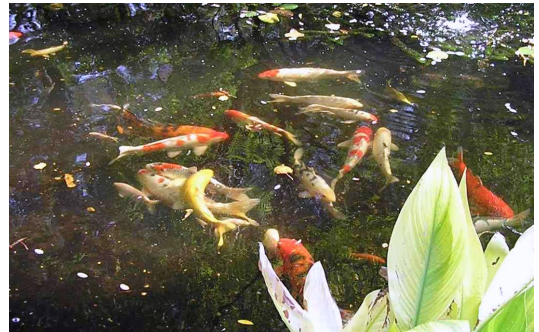
The most common types of fish used in ornamental fish ponds are koi (above) and goldfish. Koi and goldfish are often selected due to their various colors and body forms, but they are also tolerant of a wide range of water quality.

The most common types of fish used in ornamental fish ponds—goldfish and koi—belong to the carp family. Koi have been selectively bred for centuries from the common carp, Cyprinus carpio , to obtain their unique color, scale, and fin characteristics. Few people realize they are the same species as the common carp, just as a thoroughbred horse is the same species as a wild mustang. Development of the goldfish was accomplished by a millennium of selective breeding of the Prussian carp, Carassius gibelio or Carassius auratus gibelio . The coloration of the goldfish was obtained by breeding Prussian carp that had a recessive genetic mutation yielding a yellowish-orange coloration rather than the normal olive-grey appearance. After a millenium of breeding, the goldfish is now considered by many as a unique species, Carassius auratus , with unique scale counts and body morphology. However, it is not uncommon for feral goldfish to revert back to the olive-grey coloration after several generations of breeding in the wild.