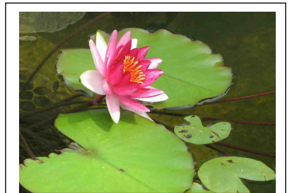
This lily has been planted in a pot to prevent unwanted expansion and protected with a wire mesh as seen below to protect it from grazing by fish.

Enclosures may be used to protect the plants from being eaten by plant-eating fish like koi. A simple cage-like structure constructed with PVC coated wire, plastic mesh, or net can be constructed for submerged and emergent plants. Use PVC with plastic mesh to float a cage around the plant for floating plants. Using browse resistant plants such as reeds and lilies, or feeding fish small amounts several times throughout the day can also help reduce destruction of plants. The enclosures also serve as sanctuaries for smaller fish and protection for spawned eggs.