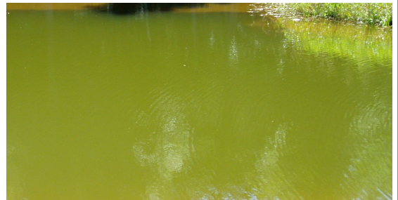
Excessive nutrient input may stimulate algal growth and should be controlled. Algal blooms can be controlled by avoiding over-stocking and over-feeding fish or over-fertilizing plants.

Ammonia and nitrite are also common causes of problems in ornamental ponds. Ammonia is the major nitrogen waste excreted by fish, and certain types of bacteria decompose or nitrify ammonia into nitrite. Both ammonia and nitrite are toxic to fish, but are usually removed by plants and used as nutrients for growth before they become problems in ornamental pools. They can both become hazardous if fish are over-fed, if plants are over-fertilized, or because of rapid decomposition of organic matter. Like other nutrients, these should be removed by adding plants, using bio-filtration, flushing, or adding bacterial water conditioners to speed the nitrification process.