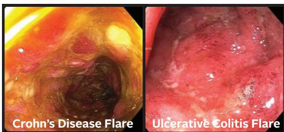
Colonoscopy pictures courtesy of Raluca Vrabie, MD

Crohn's disease and ulcerative colitis are characterized by times of active disease (when symptoms are present) and times of remission (when little or no symptoms are present). Medical treatment is aimed at bringing the conditions into a state of remission and keeping it that way for as long as possible.