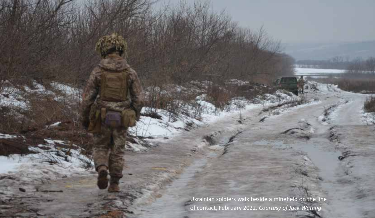
Ukrainian soldiers walk beside a minefield on the line of contact, February 2022.

sources and methods critical to protecting the state. It could also fracture Ukrainian politics, creating precisely the conditions to facilitate a Russian takeover. The result is that Russia has a bureaucracy in waiting. Western pre-emptive disclosure of individuals tied to these networks in an attempt to disrupt their coordination is a technique that can be effective, 41 but also suffers from diminishing returns as the disruption of plots also primes the audience to believe the authorities were exaggerating and thus underestimate what is, in fact, a very real and present threat.