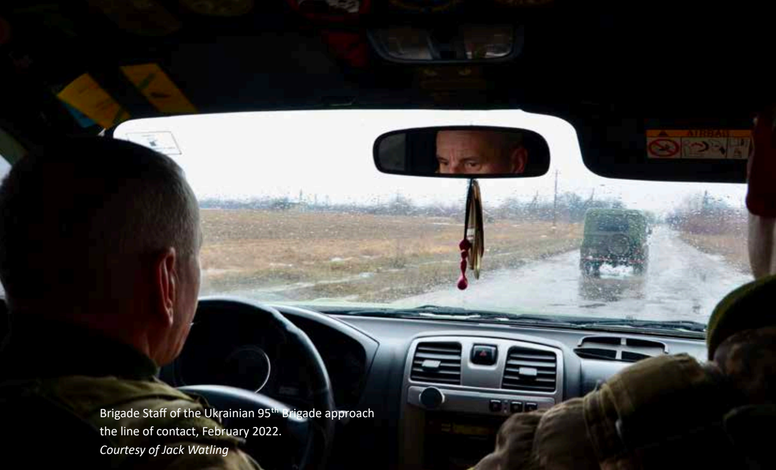
Brigade Staff of the Ukrainian 95 th Brigade approach the line of contact, February 2022.

Lavrov has called the post-Soviet republics ‘orphans’, or perhaps more accurately ‘masterless’, intimating Russia’s intent to exert control beyond its borders. 20 Like Belarus – where Russia has already stationed large numbers of troops and the government is increasingly under Putin’s sway – the Kremlin aspires to bring Kyiv to heel. Russia is not therefore aiming at a mere agreement with NATO, but rather at the subversion of Ukrainian independence and of its independent identity.