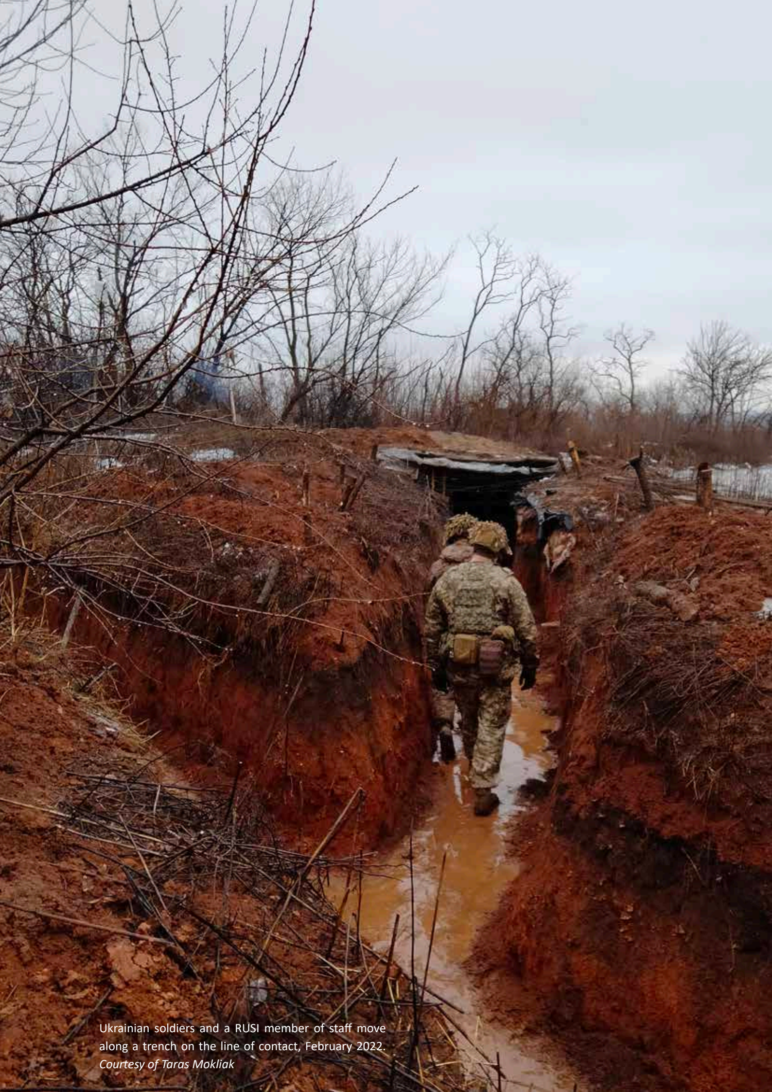
Ukrainian soldiers and a RUSI member of staff move along a trench on the line of contact, February 2022.