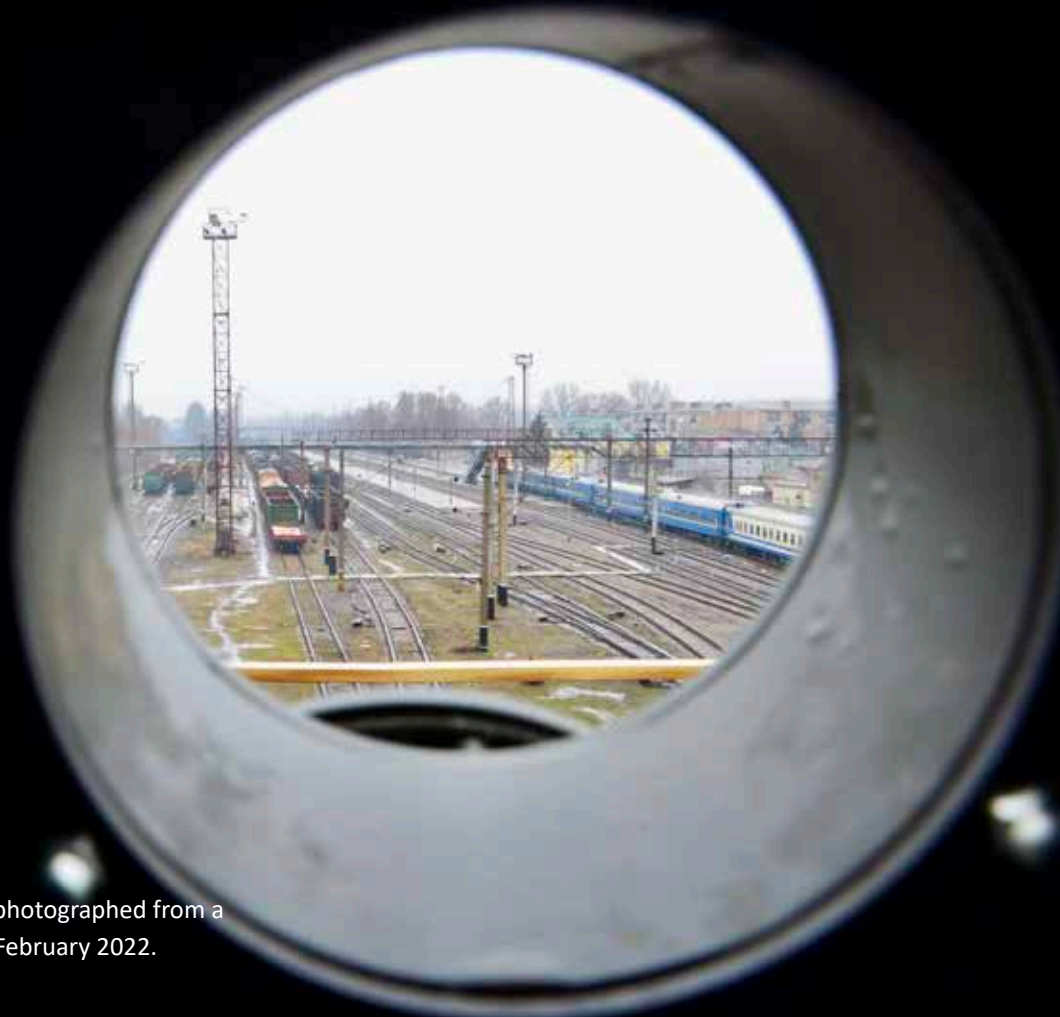
Kostyantynivka Train Station, photographed from a Ukrainian Army Kozak MRAP, February 2022.

collaborate in dismantling Serbia and thereafter fostering a political opposition to topple Slobodan Milošević, 6 Moscow took this as a blueprint for how Western policy destabilises its adversaries. 7 Western policy in Serbia stretched legal principles to erode national sovereignty, 8 and thereby shaped Russia's view that the West's pronouncements about a rules-based international order were hollow and hypocritical. Putin believes that Hillary Clinton attempted to drive such a campaign towards Russia in 2011. 9 And for the Russian state, Ukraine's 2014 Revolution of Dignity was yet another instance of the West subverting a Russian ally.