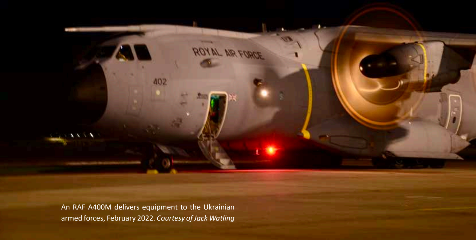
An RAF A400M delivers equipment to the Ukrainian armed forces, February 2022.

mobilise small business owners and civil society organisations to protest against the government’s inability to stabilise the cost of living. 28