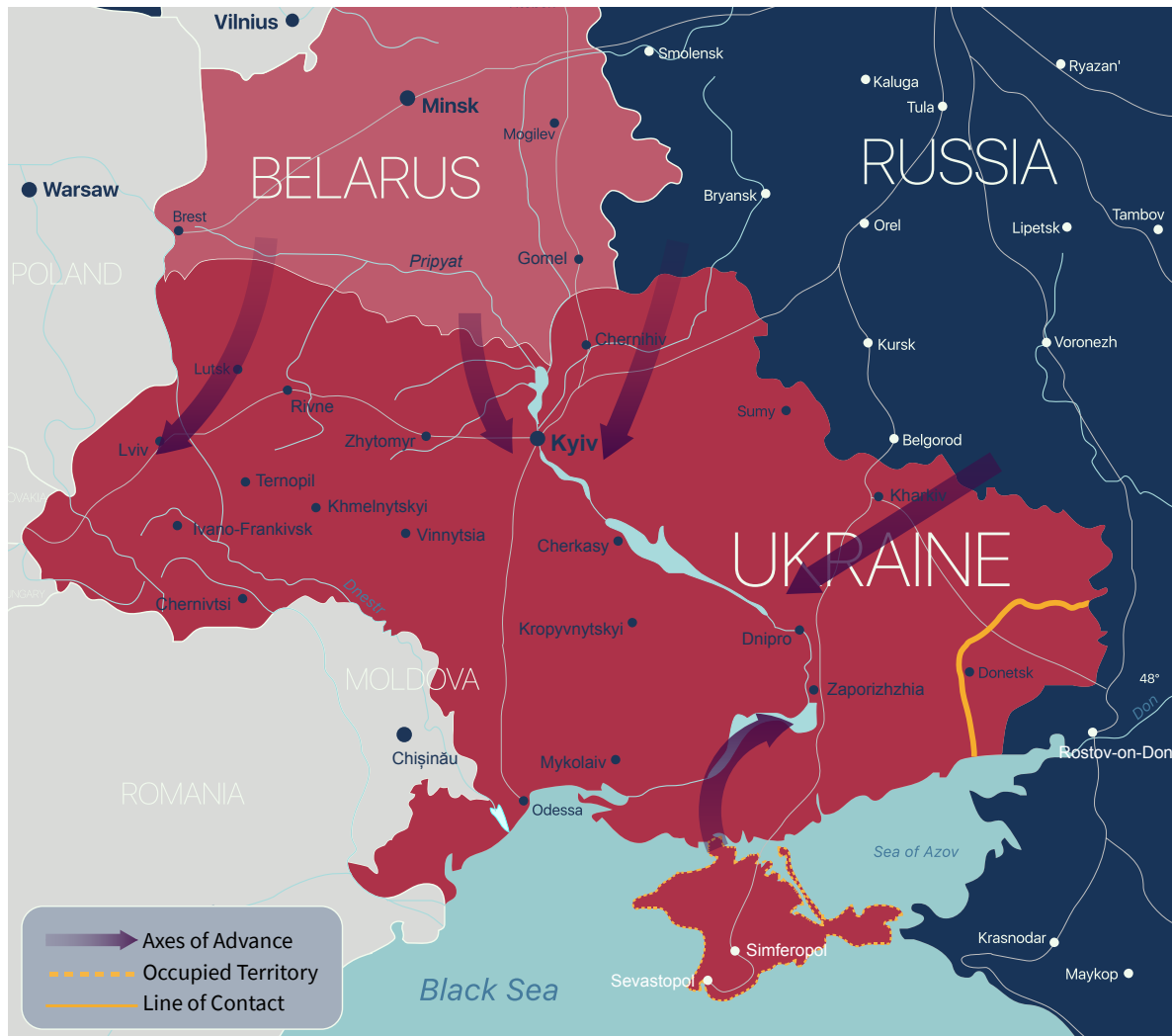
Figure 1: Map Showing Possible Axes of Advance Into Ukraine by Russia’s Armed Forces

Locations and borders are approximate.