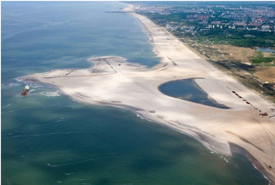
The Sand Engine

Since the 1990s, dredging as an NBS continues to be applied and studied throughout the EU. The North Seas’ Sand Engine, situated on the south coast of the Netherlands at Ter Heijde, is perhaps one of the most notable international best practices of NBS due to its scale. 4 Like De Haan, the Sand Engine utilizes dredge material and natural systems to strengthen flood defense infrastructure through the re-