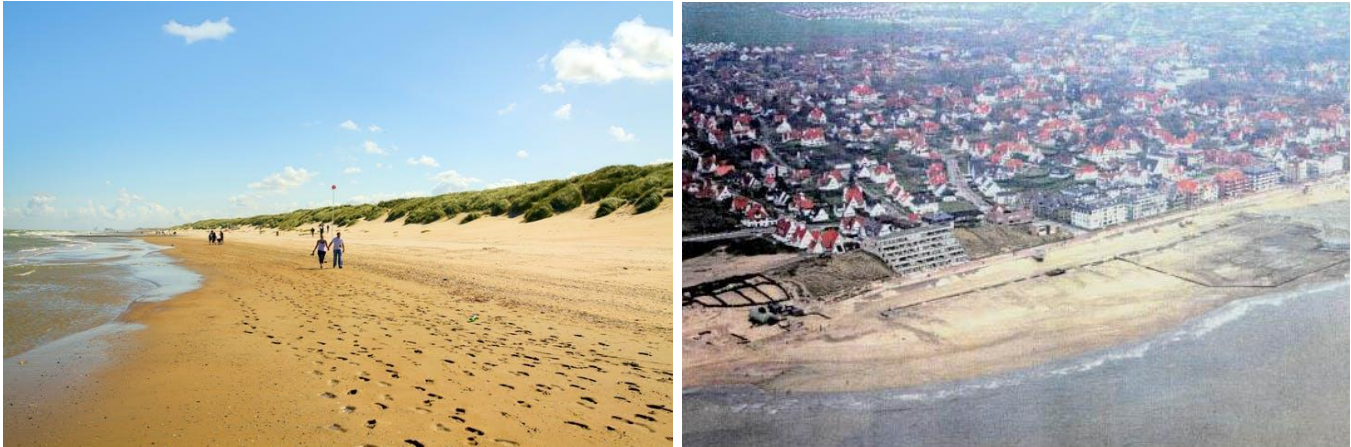
De Haan Beach, Belgium, before (right) and after investment (left).