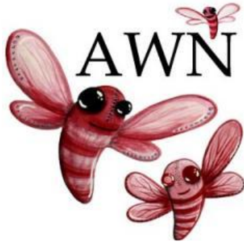
Image: Black Letters AWN surrounded by 3 pink and red whimsical dragonflies of various sizes