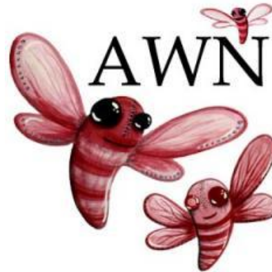
Image: Black Letters AWN surrounded by 3 pink and red whimsical dragonflies of various sizes