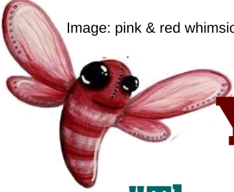
Image: pink & red whimsical dragonfly