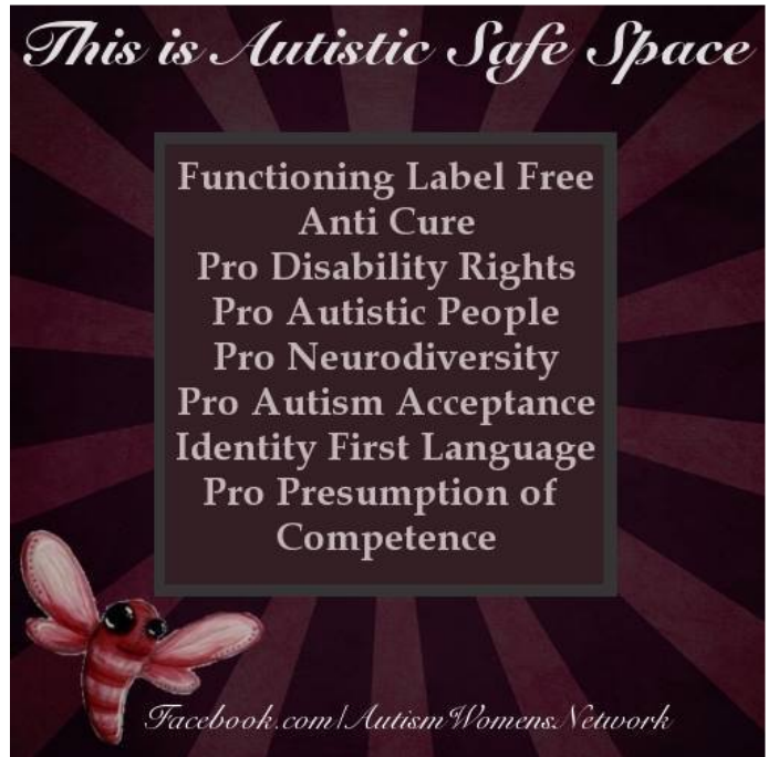
Image description: White text reads: "This is Autistic Safe Space. Functioning Label free, anti-cure, pro disability rights, pro Autistic people, pro Neurodiversity, Pro Autism Acceptance, Identity First Language Pro Presumption of Competence." Below the text box there is a dark maroon and pink starburst background with a whimsical pink dragonfly in lower left corner. At the very bottom it says: Facebook.com/AutismWomensNetwork.

25 Things I Know as an Autistic Person by Corina Becker