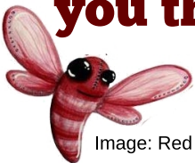
Image: Red & Pink whimsical dragonfly