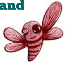
Image: pink & red whimsical dragonfly

Welcome to Autism Women's Network and welcome to a whole new understanding of you!