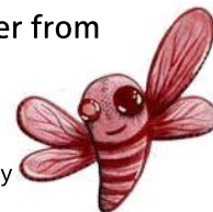
Image: Red & pink whimsical dragonfly