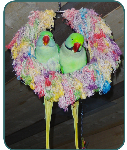
Alexandrian Parakeets Bonded pairs should stay together.

Cages shouldn't be placed on the floor, near cleaning supplies, or in front of air vents or other drafty locations.