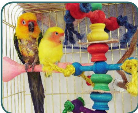
Sun Conure and Lovebird Birds often pick their own companion.