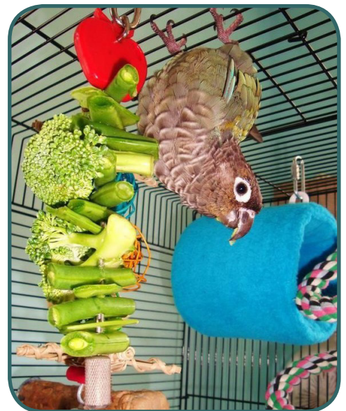
Green Cheek Conure A kebab made from fruit and veggies provides healthful nutrition and play!