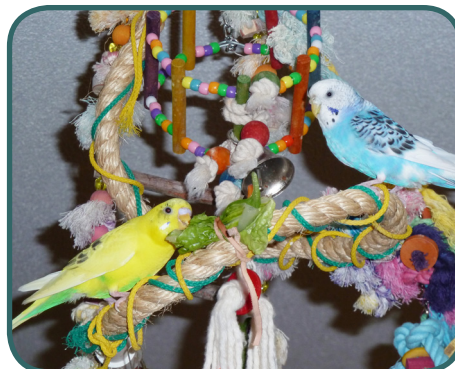
Parakeets Placing foods like leafy greens among bird toys encourages foraging.