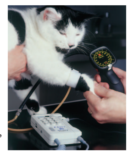
FIG 9 Blood pressure measurement should ideally be performed as a screening measure before NSAID therapy in cats

Based on appropriate use of NSAIDs in other species, the prevalence of ADEs is low in healthy patients. However, the frequency of certain ADEs increases in some patient groups, and these can therefore be classified