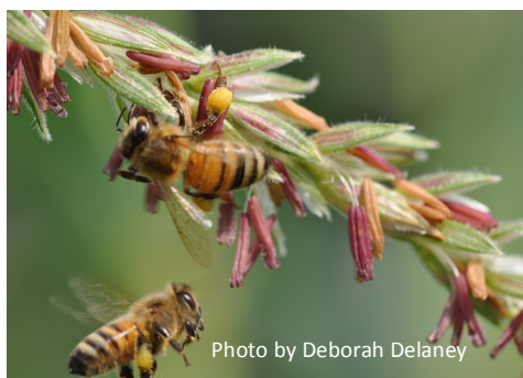
Honey bees foraging for pollen produced by the flower's male sex organ also known as the basal tassel.

One of the main sources of protein in a honey bee diet comes from pollen. Just as nectar is converted to a storable energy source in the form of honey, pollen is processed via fermentation to a storable protein source called bee bread. Pollen is the male gamete or sex cell that is produced by the male sex organ of a flower also known as the basal stamen and anther. During pollen collection bees inadvertently transfer these male gametes to the receptive female organ of a flower, which generally results in pollination. Early binges on bee bread during larval development aids in the formation of fat bodies, internal organs and glands. High consumption of bee bread also promotes egg laying in queens. Factors that affect the nutritive value of pollen are largely environmental such as temperature and soil moisture and pH, but protein levels also vary widely depending on the plant type. Protein levels from pollen of different plants range from 8 to 40%. Follow-up studies focused more on protein content and amino acid composition (Standifer, 1967) and how pollen converts to brood (Loper and Berdel, 1980). From these studies they found that pollen not only varies from species to species but from season to season and that bees seem to prefer mixed pollen sources.