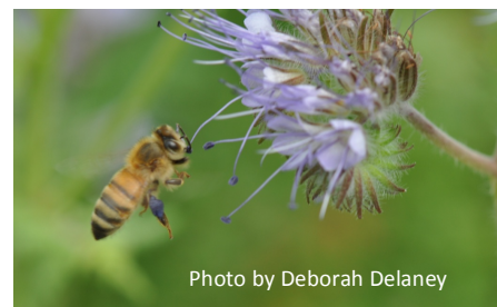
Honey bee foraging for pollen from Phacelia tanacetifolia

Unlike humans and many plants, insects (honey bees included) cannot synthesize sterols and therefore require a dietary source. Sterols are also components of cell membranes and many exterior surface waxes on the bee's exoskeleton. Honey bees use sterols acquired from plant sources as precursor molecules for the