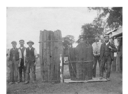
Figure 2: Photograph of a group of excavators with two wooden barrels found in wells in Insulae XVII and XVIII, 1897