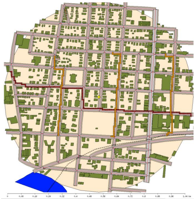
Figure 3. Scenario sc0126_005 generated from input in Table 1. The searcher path is shown with dark circles and the vehicle tracks with squares.

Utilizing both domain-specific ontologies and those containing latent-background terminology, we have created a software environment that generates an expanded number of scenarios from a general set of user input variables for purposes of testing algorithms for detection of SNM. The specific ontology developed, the SNM DO, was built using subjectmatter expert knowledge of the detection process for searchers on foot in an urban setting. The detailed dependence of the software construction and operation on the ontologies is described and a specific example of the user input variables used to create sixteen scenarios is elaborated. By using ontologies both to configure the software architecture and to drive inferencing based on ontological reasoning, we greatly expanded the number and variety of scenarios generated from a single set of user input. Such applications show the importance of incorporating ontologies into software frameworks for generation of scenarios for activities such as searching for nuclear materials.