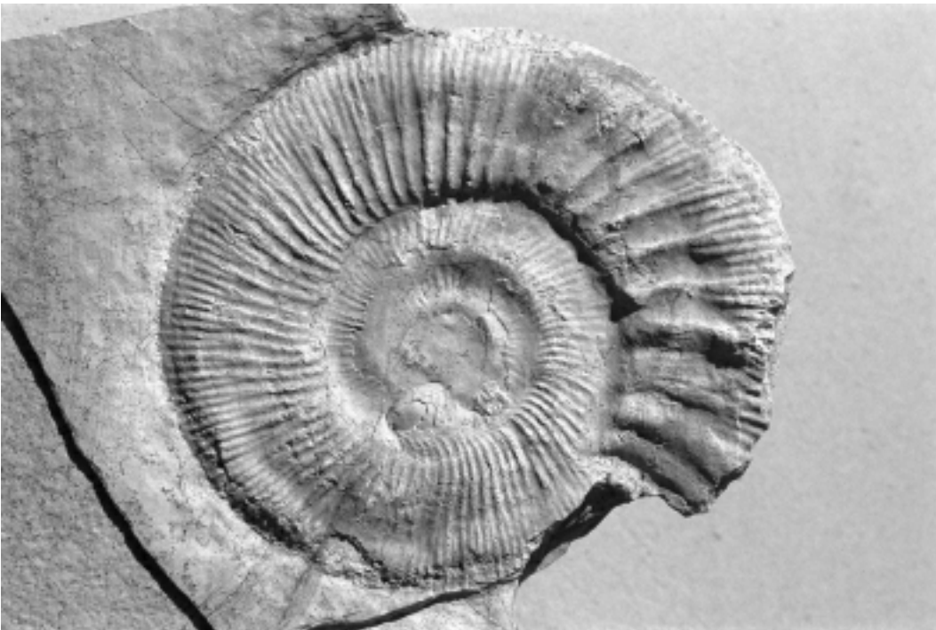
Fig. 3. Lithacoceras eigeltingense (OHMERT & ZEISS). Zandt Member, Zandt, Lower Tithonian, Hybonotum Zone, eigeltingense horizon; Staatliches Museum für Naturkunde Stuttgart, no. 66075 (diameter of specimen: 160 mm).

limestones dated into the Subeumela Subzone of the Beckeri Zone. Other occurrences in the same area higher up in the section are dated still within the lower part of the Beckeri Zone (Brunn: Beckeri Zone, Subeumela Subzone, RÖPER et al. 1996; RÖPER & ROTHGAENGER 1998b).