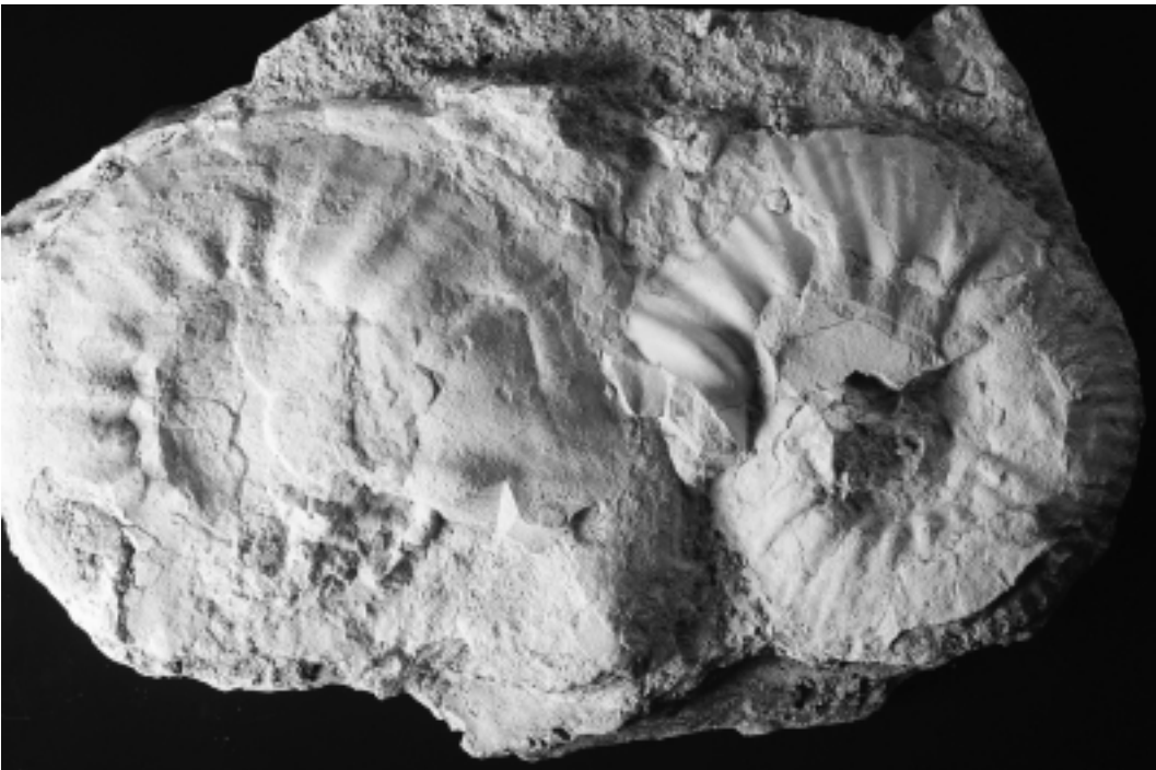
Fig. 4. Gravesia gigas (ZIETEN). Hienheim Formation, Ried near Hienheim, Lower Tithonian, Hybonotum Zone, riedlingensis horizon; Bürgermeister-Müller-Museum Solnhofen, without no. (diameters of specimens: 130 and 160 mm).

precisely within the Upper Jurassic succession of southern Germany. A specimen of Lithacoceras eigeltिंगense OHMERT & ZEISS (Fig. 3) was obtained from the lithographic limestones of Zandt. This taxon is typical of the lowermost Tithonian biohorizon according to present usage. The lithographic limestones of Zandt (Zandt Member) correlate with the micritic lithographic limestones in the upper part of the Painten section (the lower part of this section was studied by LINK & FÜRSICH 2001), which are famous for their ammonite rolling marks (SEILACHER 1963).