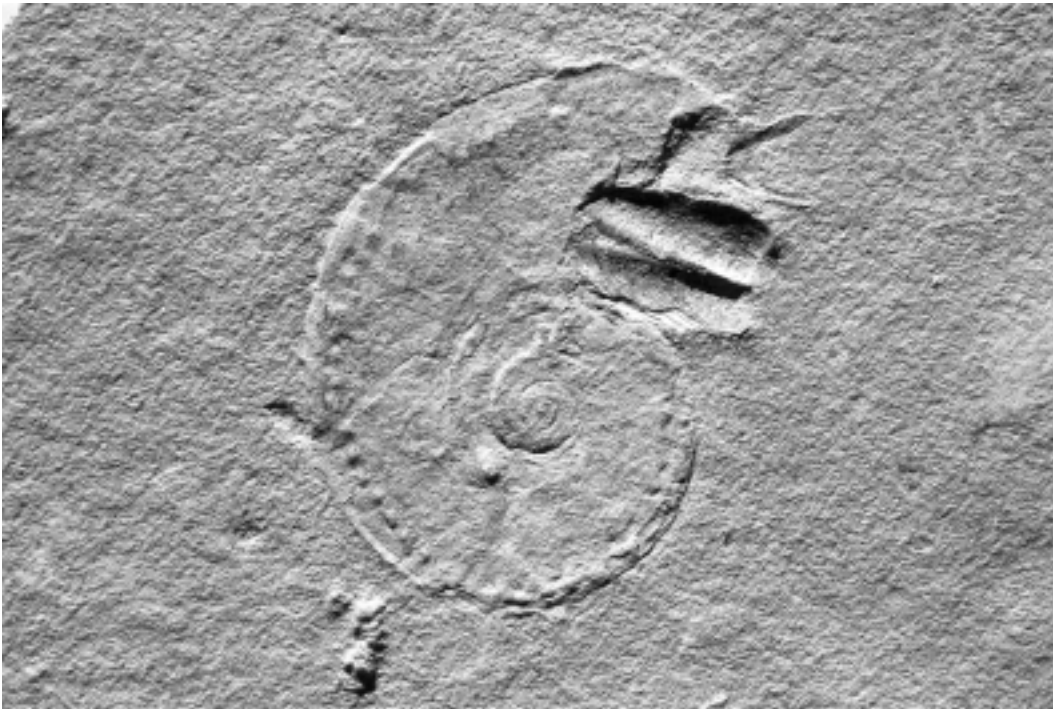
Fig. 5. Fontannesiella prolithographica (FONTANNES), specimen with preserved jaw apparatus. Mörsnheim Formation, Daiting, Lower Tithonian, Hybonotum Zone, moernsheimensis horizon; Staatliches Museum für Naturkunde Stuttgart, no. 66076 (diameter of specimen: 75 mm).

and correlations in the area. The exact position of the lithographic limestones of Eichstätt is still problematic. The very common occurrence of the smooth oppeliid Neochetoceras bous (OPPEL) and the complete absence of Fontannesiella or Paralingulaticeras points to an age older than the riedlingensis horizon.