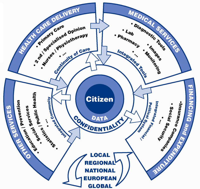
TMA Vision for Citizen-Centred Healthcare

The TM Alliance's Vision is therefore one of citizen-centred healthcare; the system should be built around the citizen rather than bending the citizen to fit into the system. In this vision, the citizen is the client who should be in a position to demand good services rather than the supplicant who is grateful for whatever services are thrown his way.