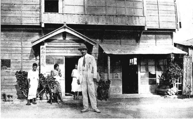
THE AUTHOR OUTSIDE A JAPANESE INN, THE ONLY FORM OF RESIDENCE IN THE SOUTH SEAS