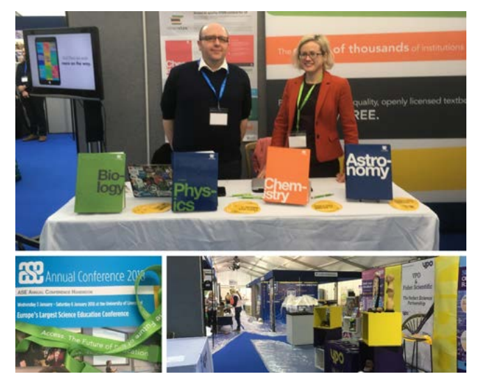
Image Credit: ASE Annual Conference 2018, Liverpool, UK (by Beck Pitt)