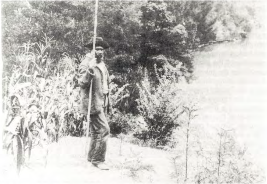
'An Aborigine on the Hawkesbury River with his garden', c. 1890, photo acquired by Mitchell Library in 1920.

If the land movement strategy had some success in economic terms, how far was this at the cost of Aboriginal identity? These Kuri small farmers of the north coast were using their profits to buy consumer goods similar to those bought by white small farmers, with reports of Kuris furnishing their houses with curtains, pianos and other physical symbols of European culture. The admiration of the Protection Board and local police was surely not consistent with an adherence to Aboriginal values, as Whites understood them. The Kuris of the Macleay, Nambucca and Bellinger Rivers appeared to be living the perfect example of