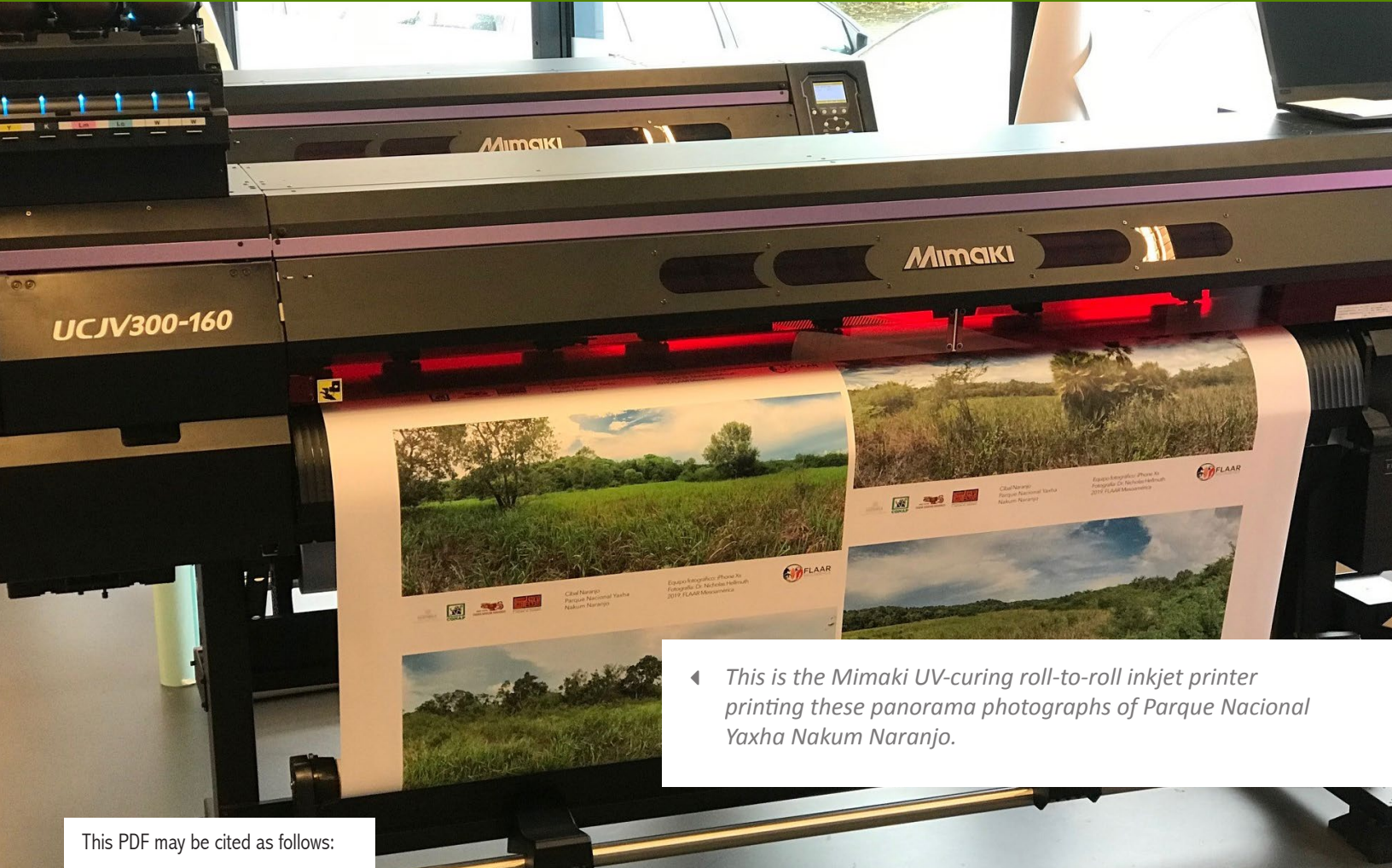
◀ This is the Mimaki UV-curing roll-to-roll inkjet printer printing these panorama photographs of Parque Nacional Yaxha Nakum Naranjo.