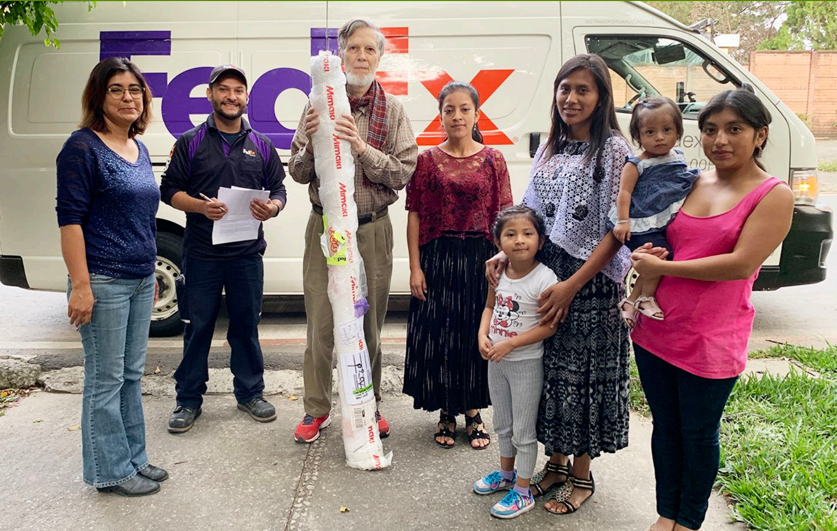
▲ Here are the prints arriving via FedEx to the office of FLAAR-REPORTS in Guatemala City, Central America.