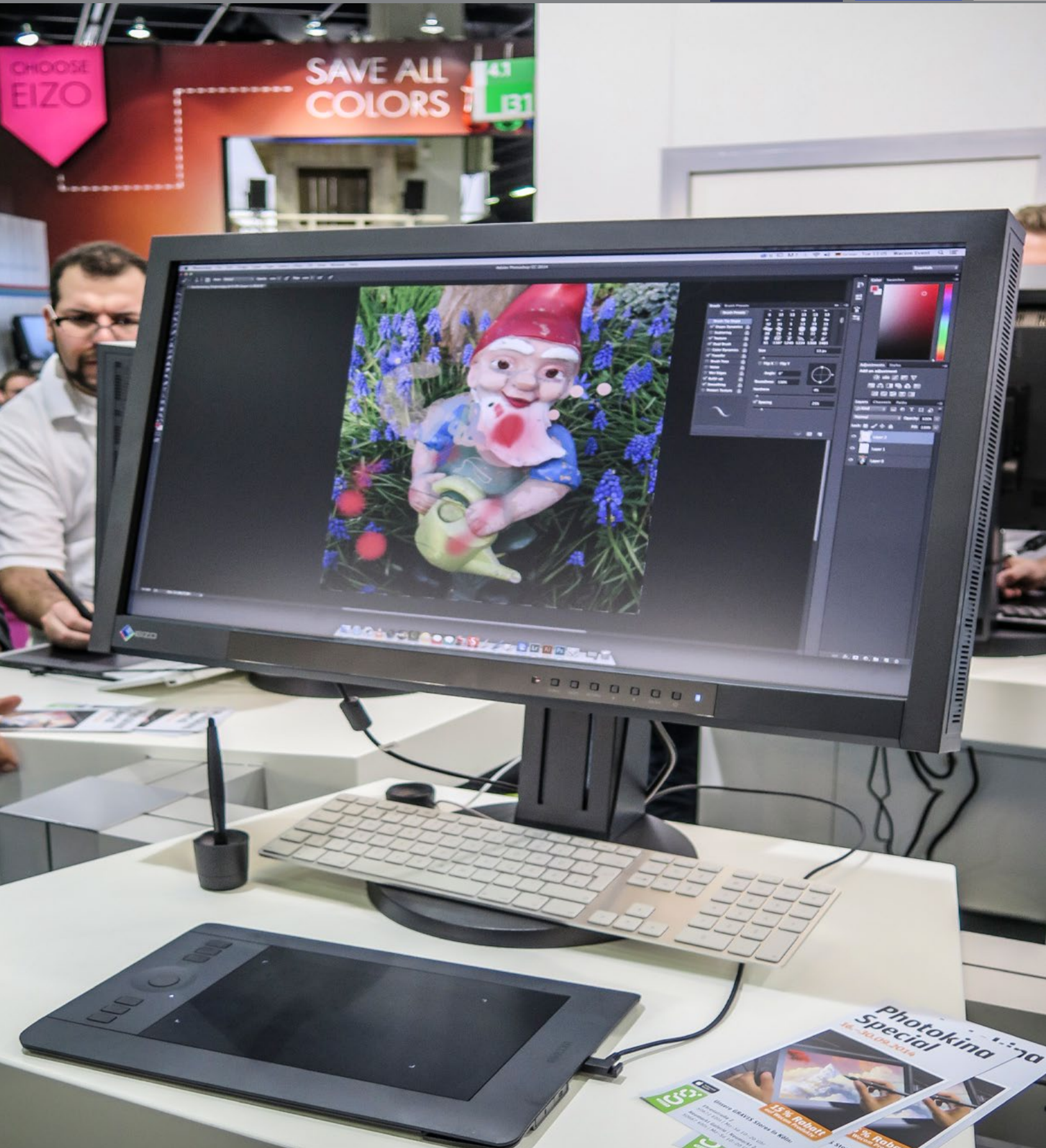
Wacom, pen tablets, USA, Hall 4.1, I 31, J 40