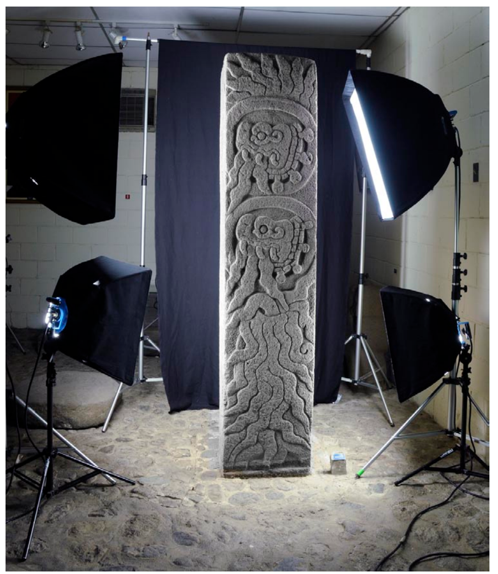
Figure 5. When you are taking photos of archeological pieces, you have to know where you will put the lights, the position is very important, if you want to obtain a good shadows to exalt the relief, the raking light is the best way to see the detail of your piece. In the image you can see who Dr. Nicholas Hellmuth likes to use this position of the light using Westcott Spiderlite.