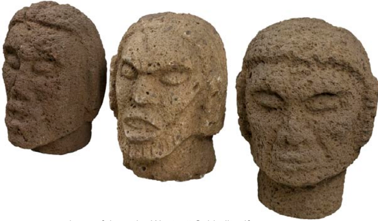
Figure 4. Here you can see who useful are the Westcott Spiderlite, if you don't want a hard light over your object, Westcott Spiderlite is a good option to use in your archeological pieces.