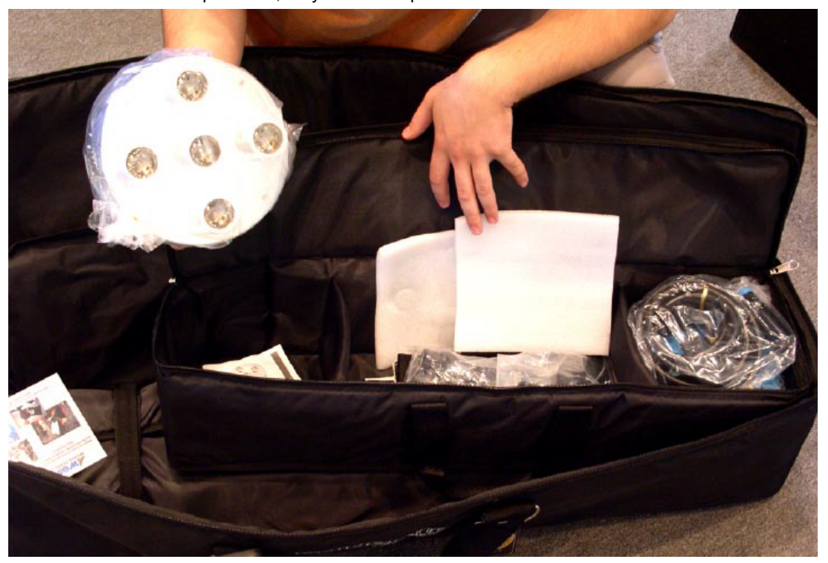
Here are the Westcott Liteboxes, Spiderlites as they arrived to our building.