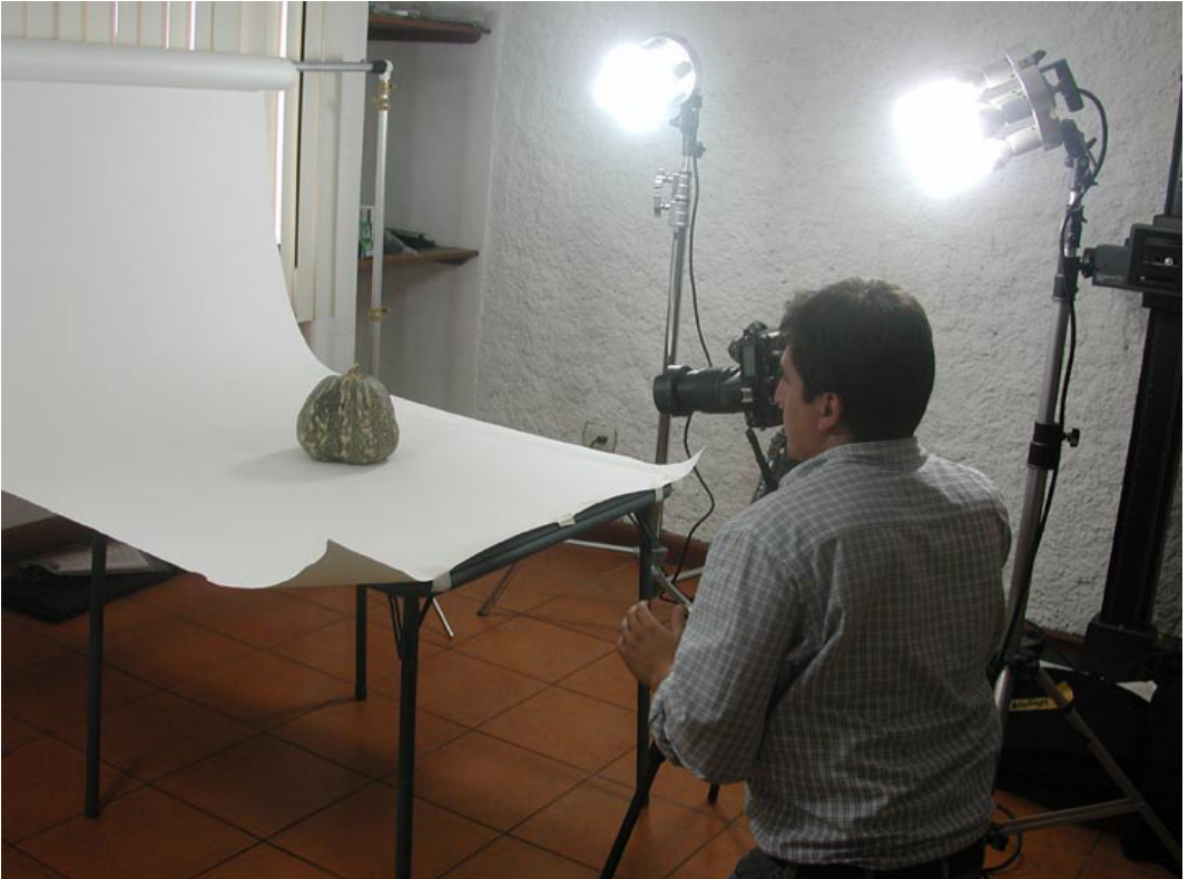
Members of our staff also find them very useful for our ethnobotanic studies.