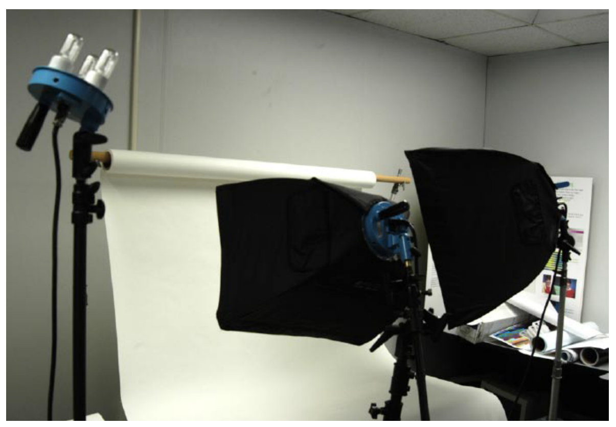
Here are the Westcott Spiderlites, they were set up with the softboxes.