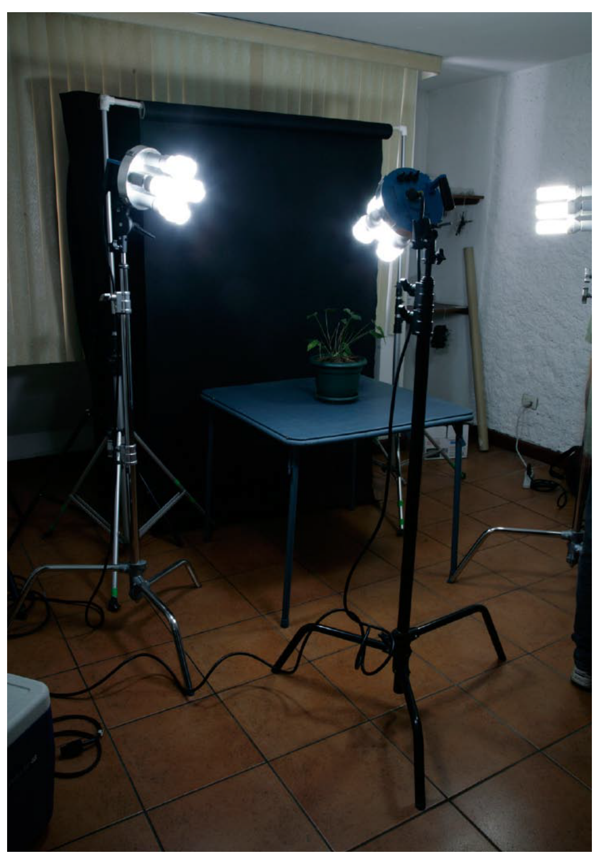
At FLAAR facilities in Guatemala we use the Westcott Spiderlites for photographing miniature orchids.