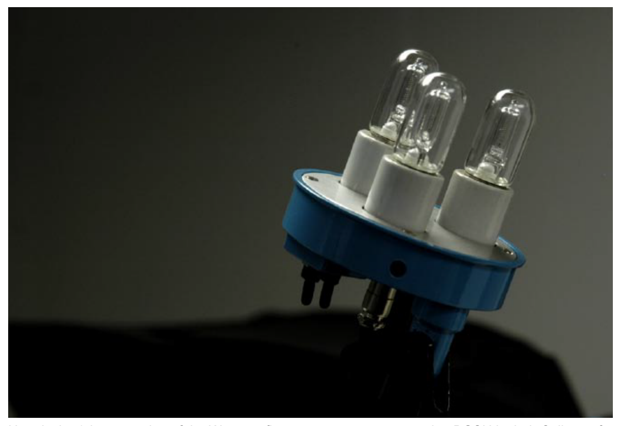
Here is the 3-lamp version of the Westcott fluorescent system, as used at BGSU in their College of Technology.