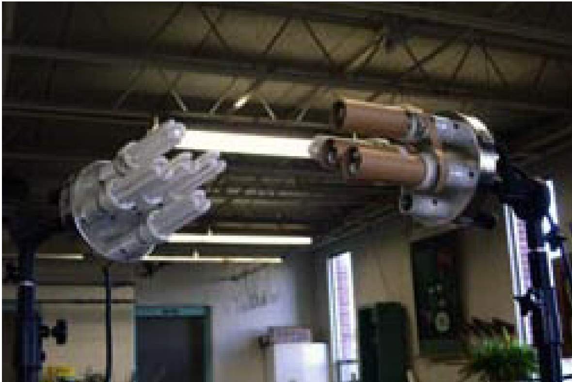
As you can see from the Trade Show images there are many configurations to choose from.