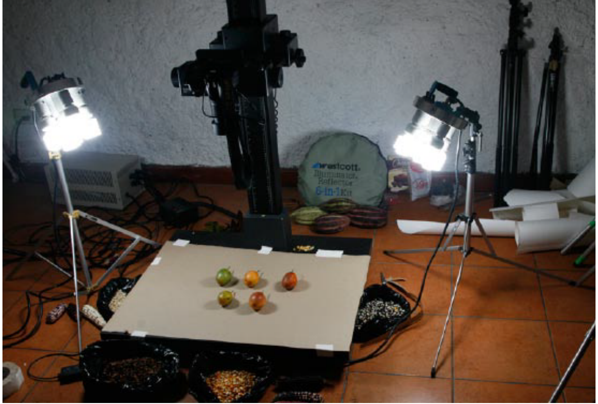
Westcott Spiderlites at FLAAR facilities in Guatemala.