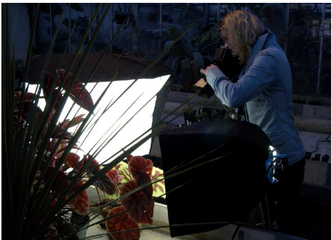
Westcott softboxes being used for nature photography in BGSU Greenhouse.