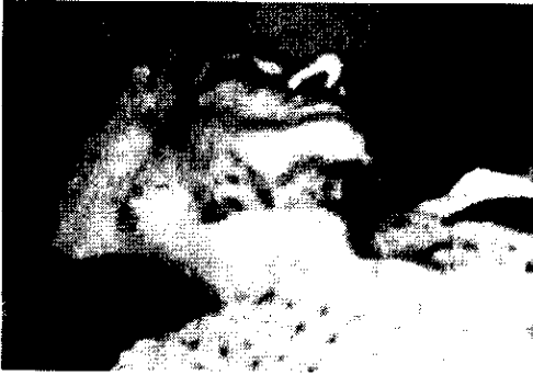
Figure 1 Chronic ulcer on nickel dermatitis after leech application