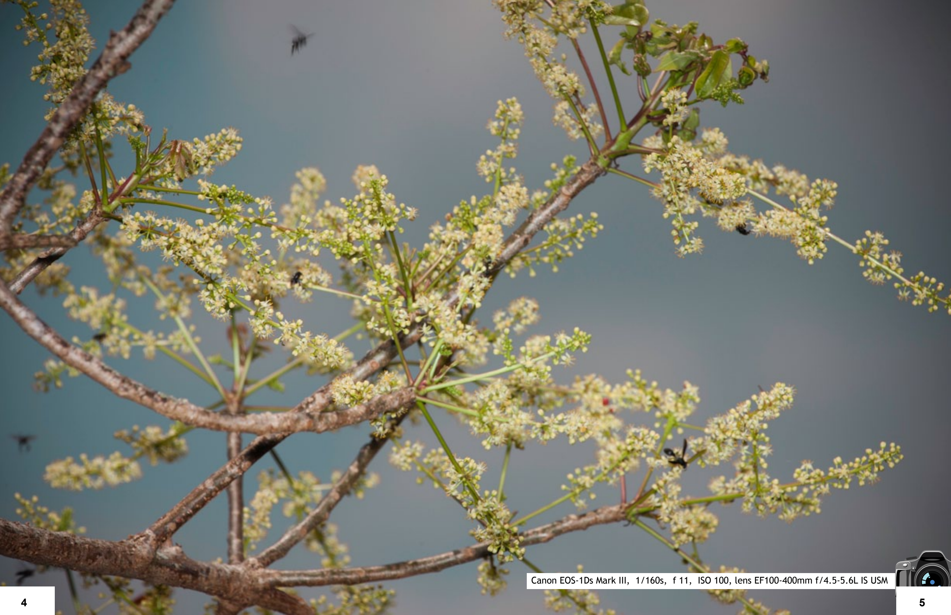
Canon EOS-1Ds Mark III, 1/160s, f 11, ISO 100, lens EF100-400mm f/4.5-5.6L IS USM