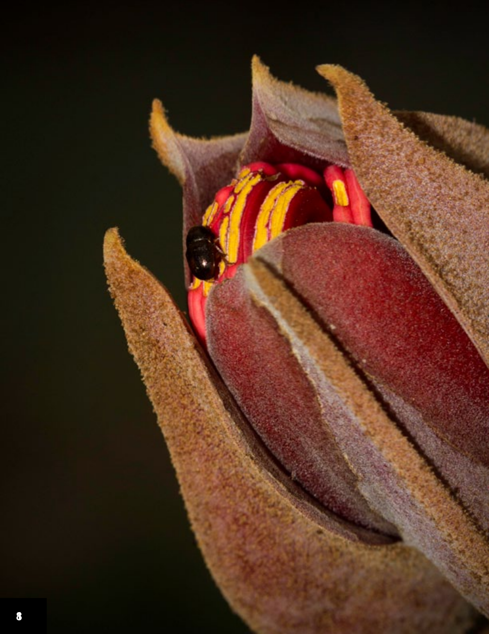
flor de manitas Devil's Hand Tree