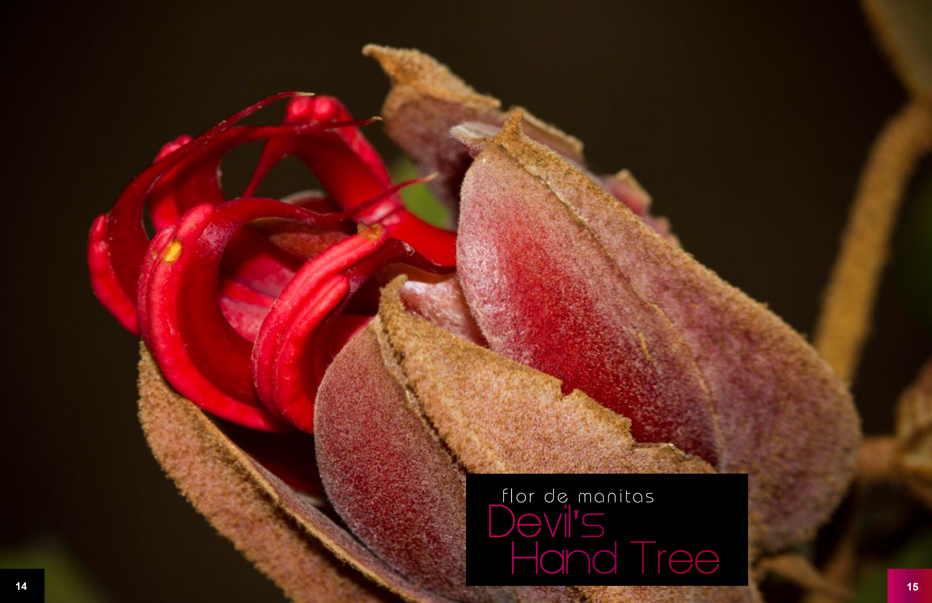
flor de manitas Devil's Hand Tree