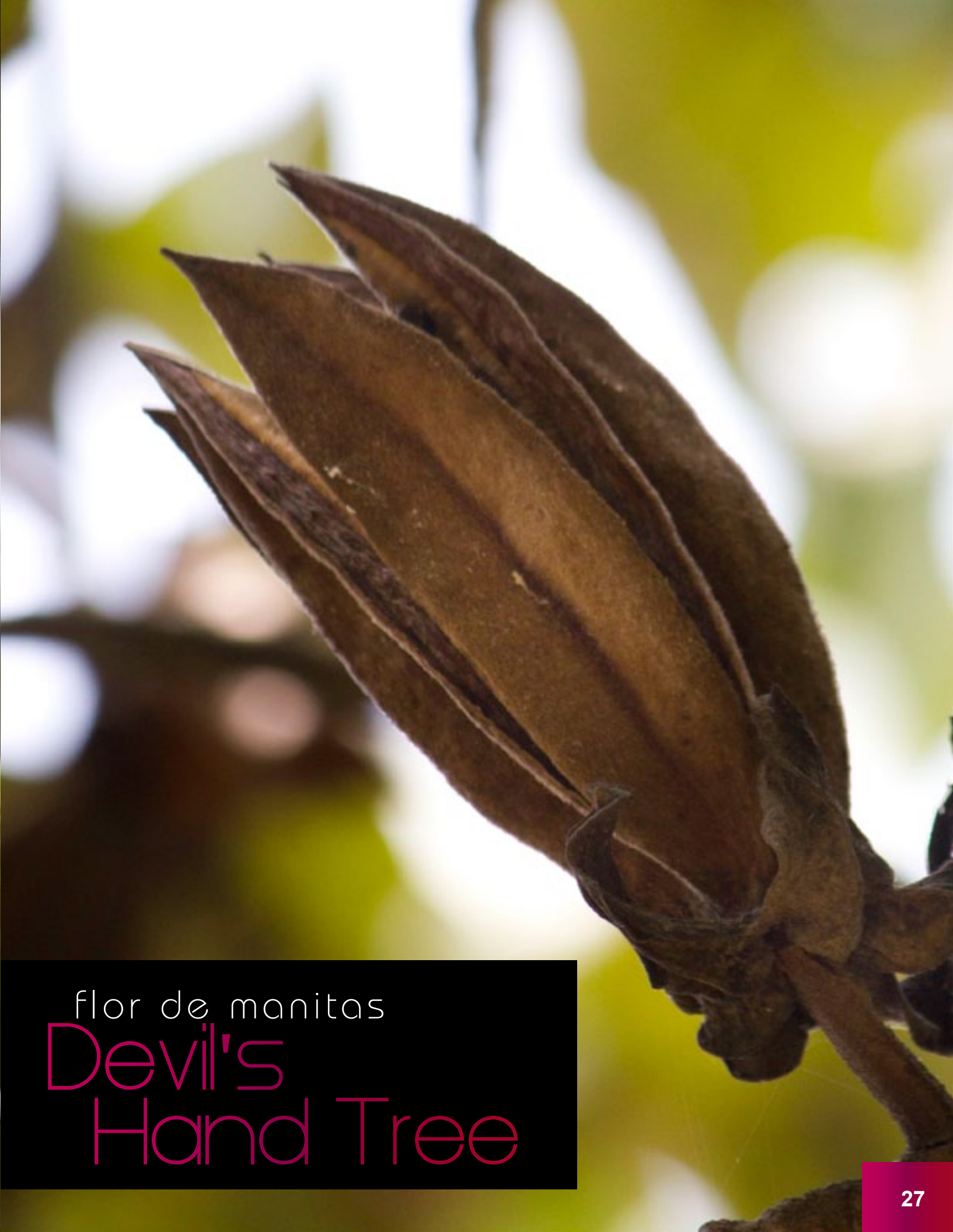
Flor de manitas Devil's Hand Tree