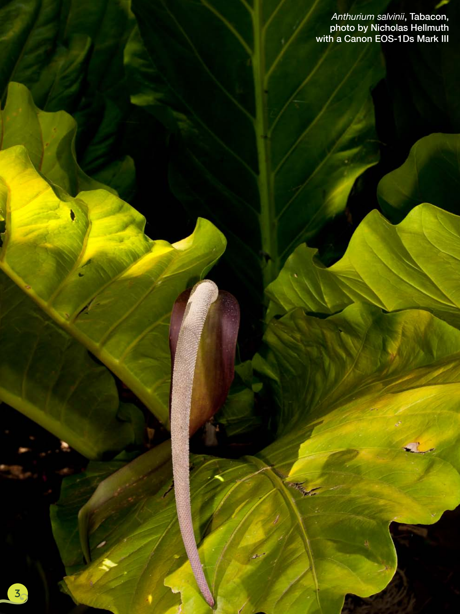
Anthurium salvinii, Tabacon