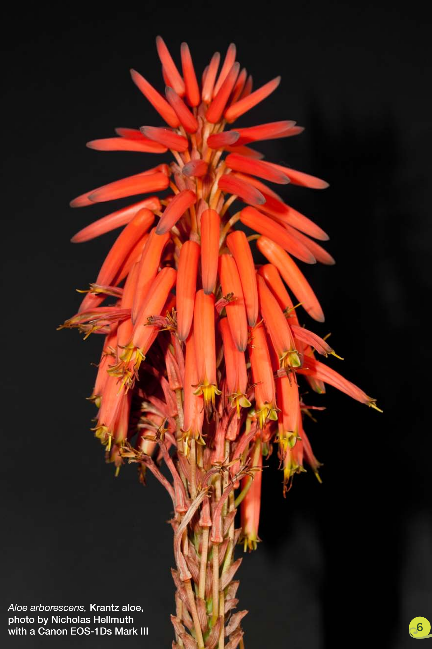
Aloe arborescens , Krantz aloe

You can stop at the hotel for lunch or dinner, or reserve to stay overnight. We enjoyed our stay. I would rate the waitresses and restaurant staff as definitely better (friendly, patient, pleasant) than hotels in other countries. It is also nice to see the local Maya woven clothing being worn in the hotel, but in a natural way (not as a costume for tourists).