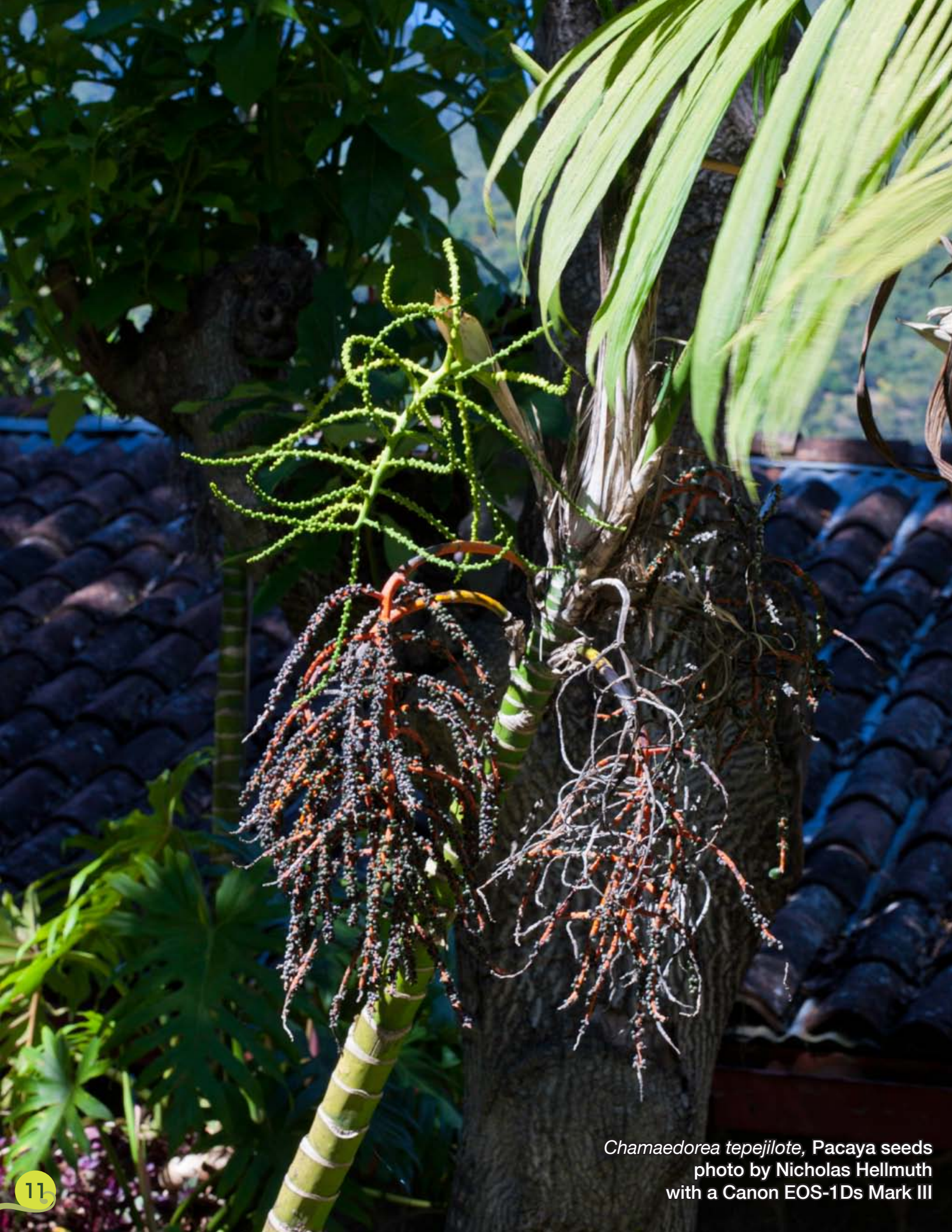
Chamaedorea tepejilote, Pacaya seeds