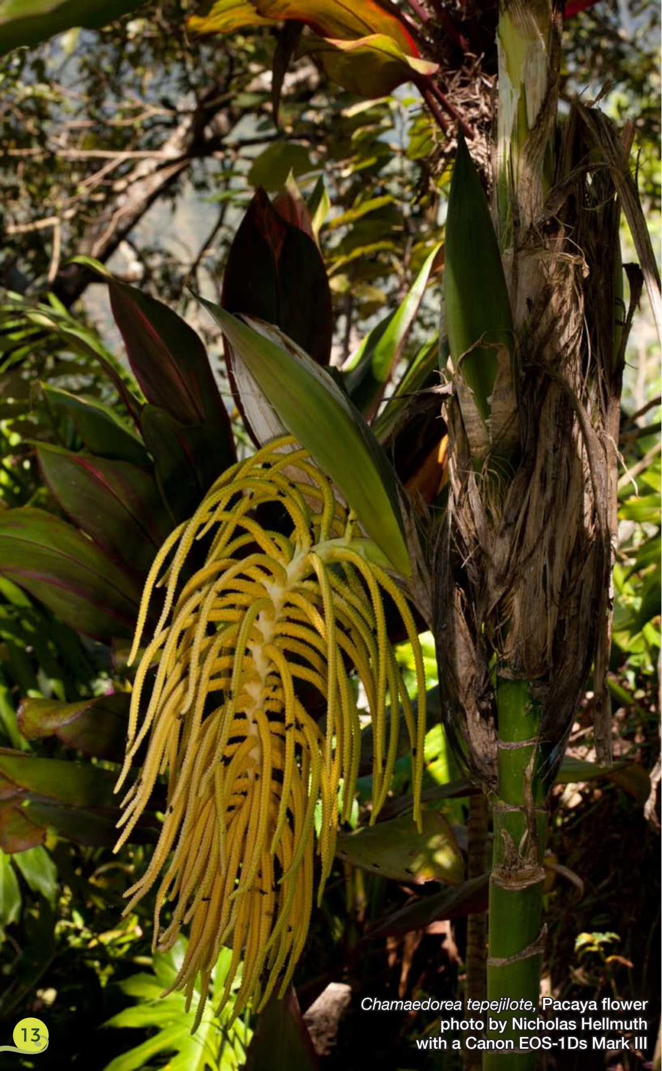
Chamaedorea tepejilote, Pacaya flower with a Canon EOS-1Ds Mark III