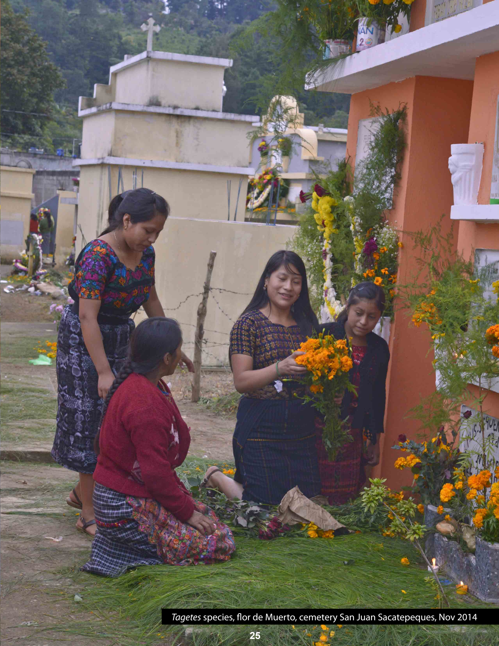
Tagetes species, flor de Muerto, cemetery San Juan Sacatepeques, Nov 2014