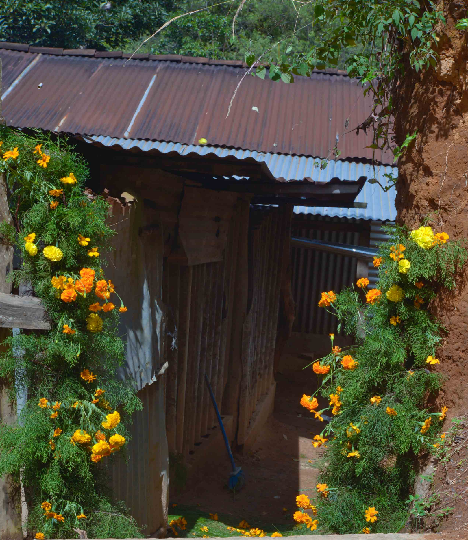
Most yellow and orange marigolds are called flor de muerto in Guatemala. Most Spanish terms are not biologically precise, and the number of different species covered by the designation flor de muerto varies by region.