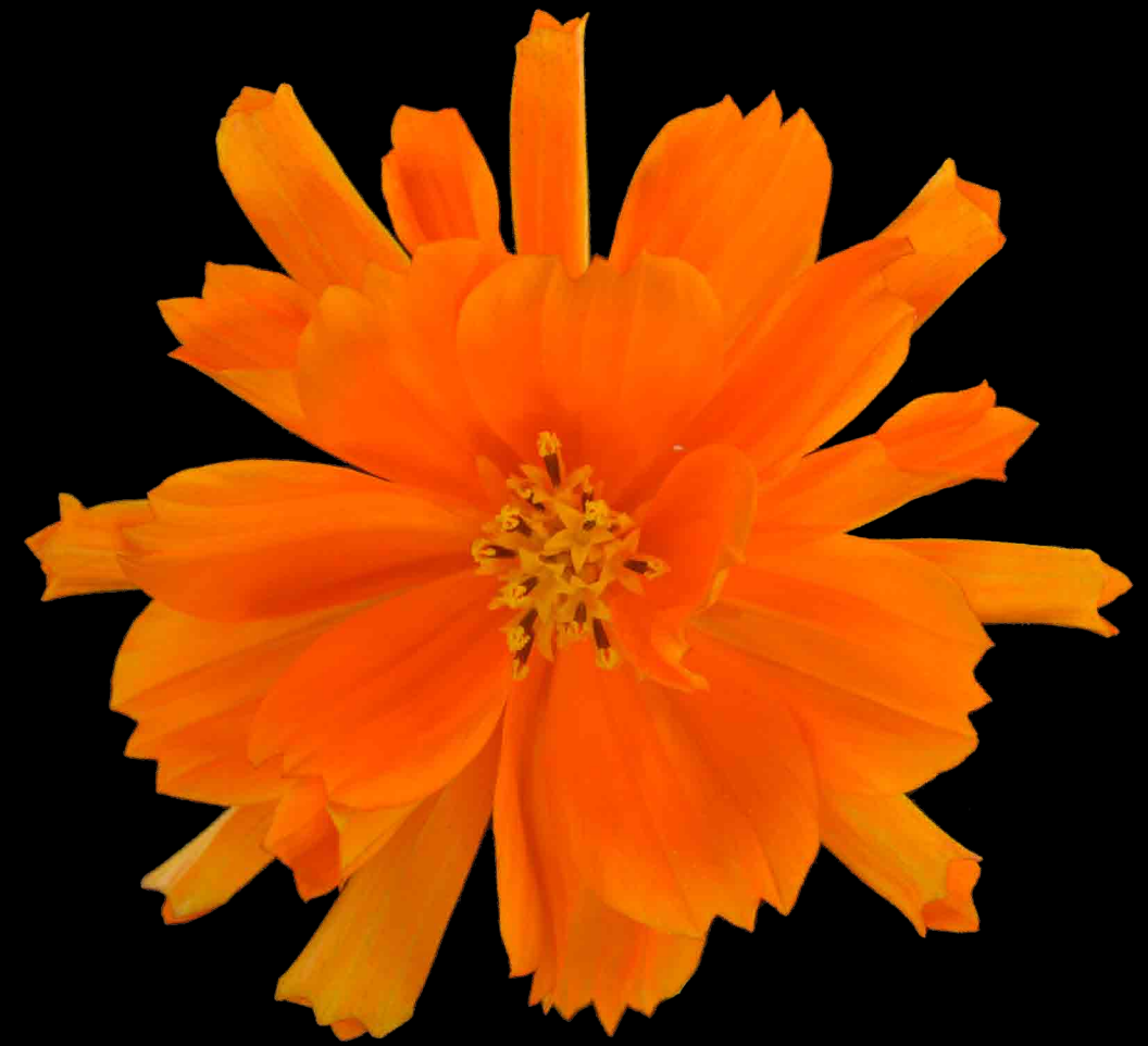
Tagetes species, flor de muerto Various Tagetes species grown in the ethnobotanical garden surrounding the FLAAR office building.