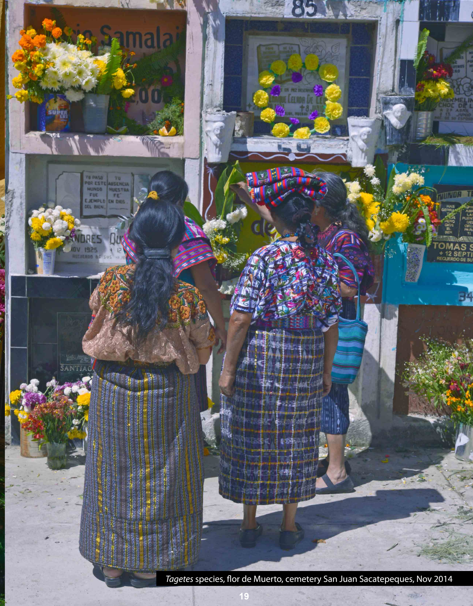
Tagetes species, flor de Muerto, cemetery San Juan Sacatepeques, Nov 2014