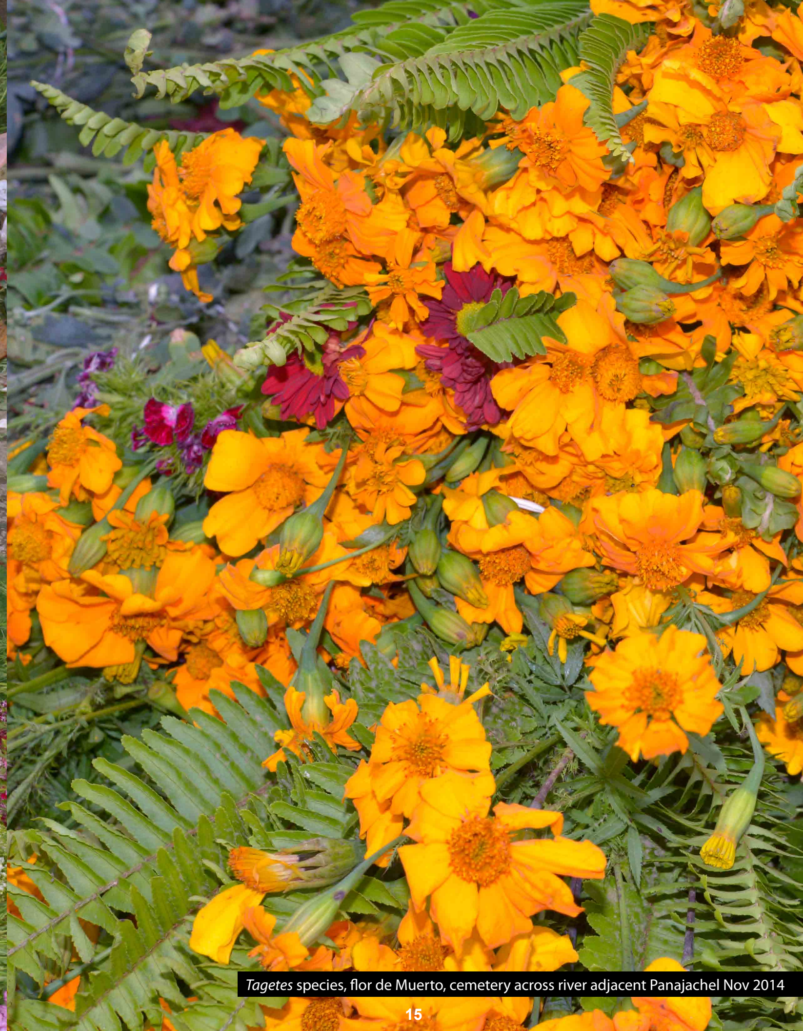
Tagetes species, flor de Muerto, cemetery across river adjacent Panajachel Nov 2014