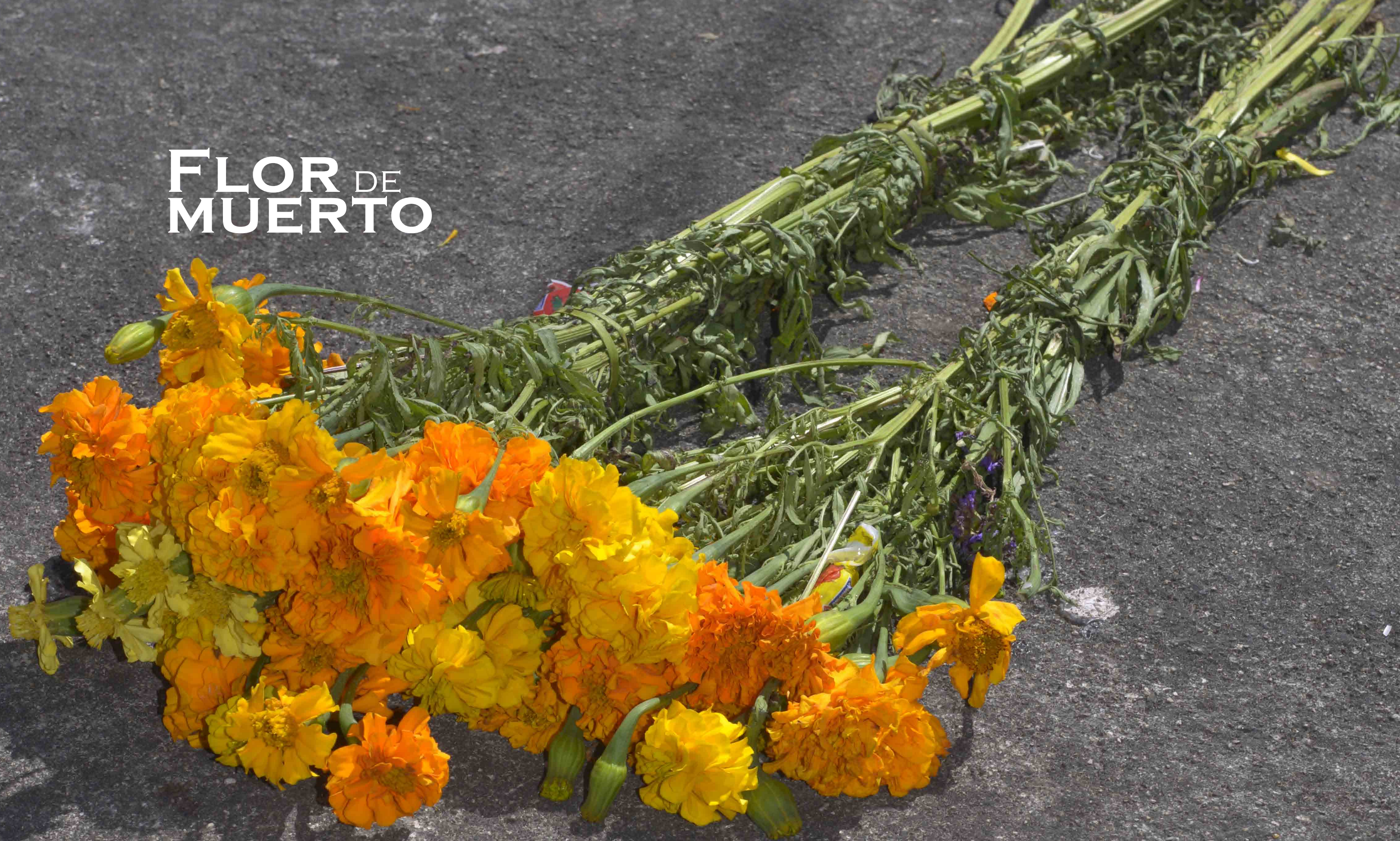
Tagetes species, flor de Muerto, cemetery across river adjacent Panajachel Nov 2014