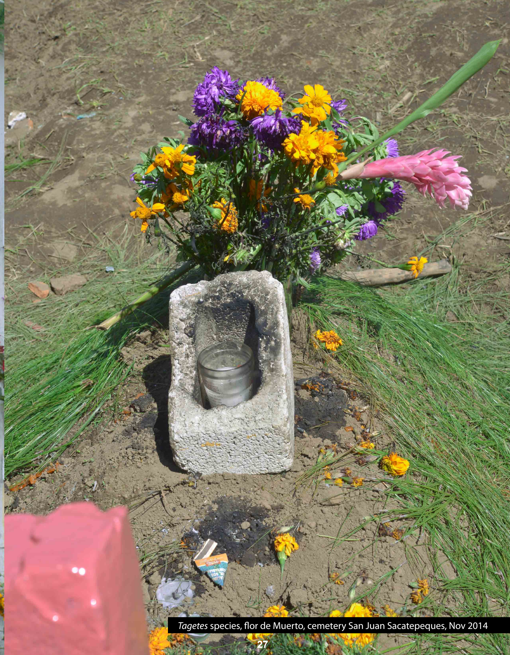
Tagetes species, flor de Muerto, cemetery San Juan Sacatepeques, Nov 2014