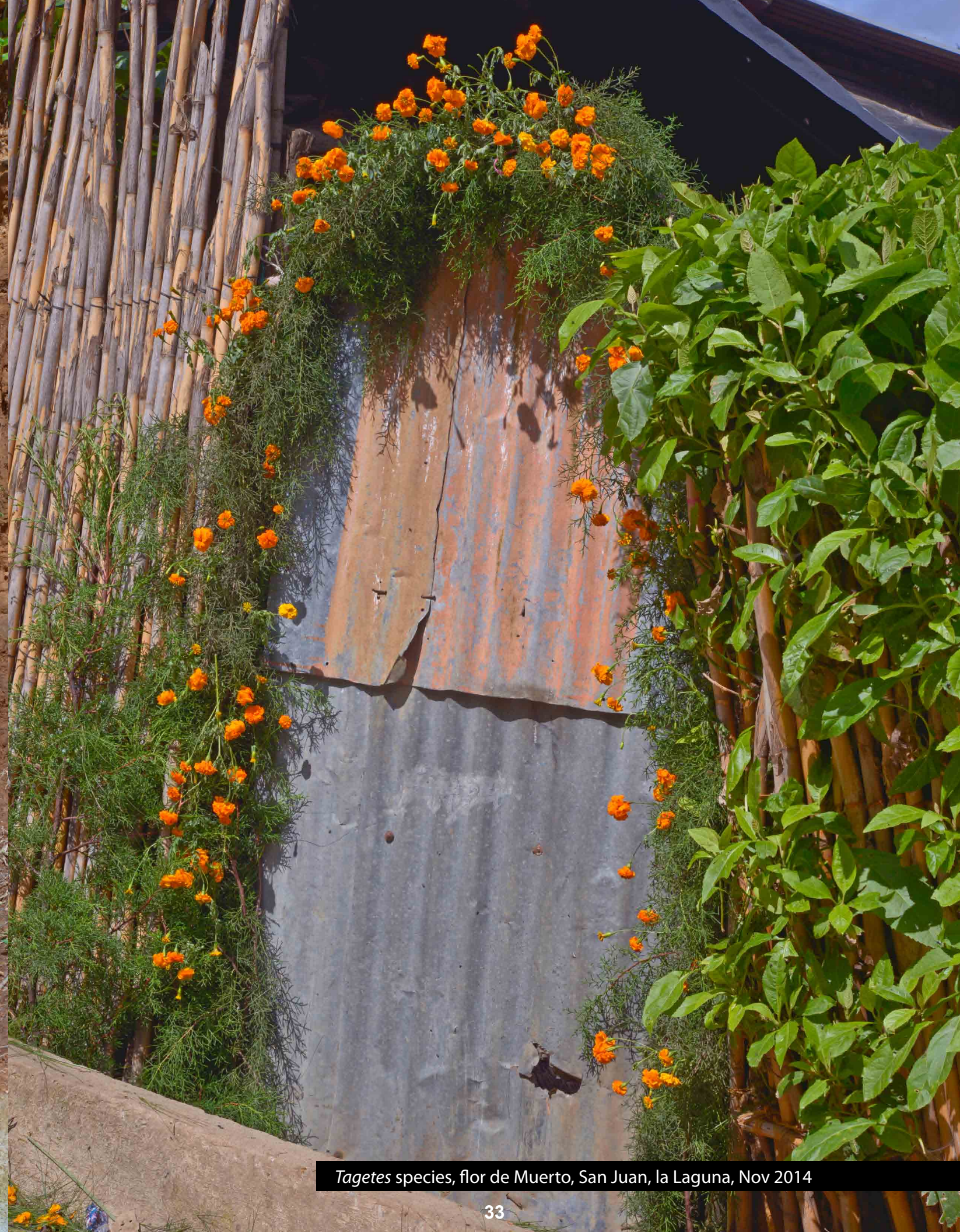
Tagetes species, flor de Muerto, San Juan, la Laguna, Nov 2014