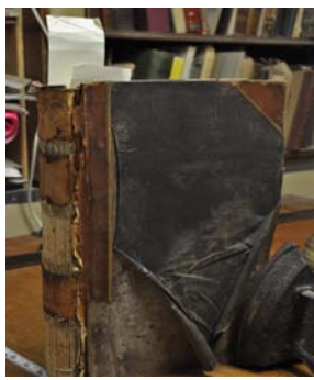
1875 Census Before