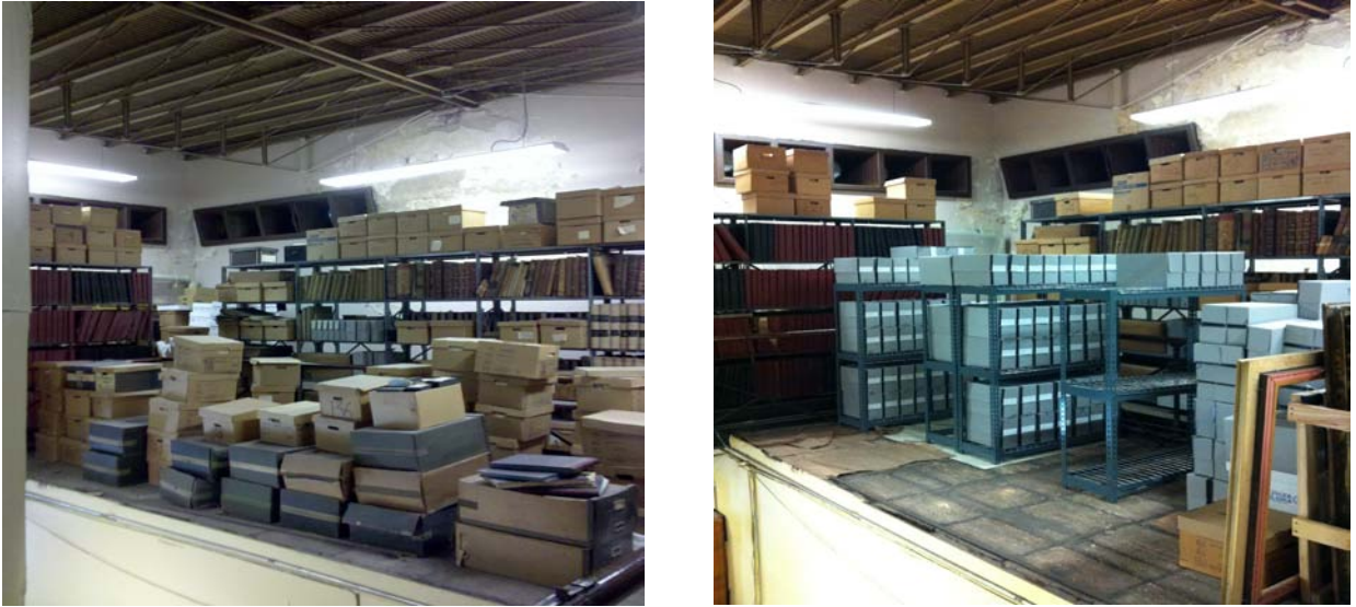
Mezzanine Deck 2010

pursuing the purchase of a dehumidification system designed to stabilize the environment in the archives vault, public research area, as well as the mezzanine and contiguous storage rooms. Controlling humidity levels, however, offers only a partial solution. Optimal conditions require constant temperature and humidity levels (68 degrees F; 50% relative humidity) which would be costly given the present space.