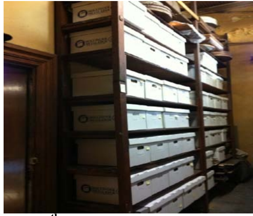
19<sup>th</sup> Century Aldermen Records

In addition, major collections of 19<sup>th</sup> and early 20<sup>th</sup> century City Council and Board of Aldermen records were scattered throughout the archives storage areas and were unavailable for research. During the summer of 2010 the Archivist instituted a program to recruit volunteers to begin processing these important collections. Close collaborations have been formed with the MET School, the West Bay Collaborative, and Providence College. A recent call for volunteers was highly successful, attracting librarians, a retired teacher among others to assist us with various tasks. Currently nine volunteers are working on various projects to improve access to the archives' collections.