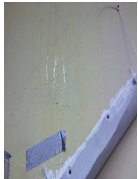
Leaks along Archives Wall