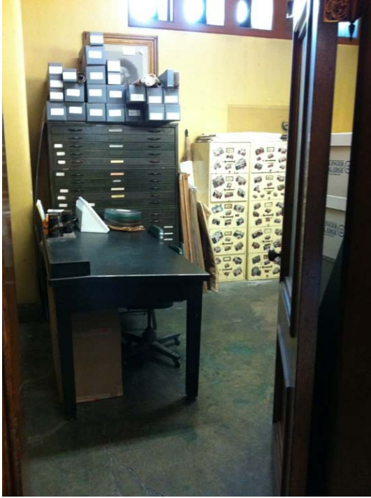
Graphics Room 2010