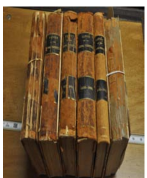
School Reports Before