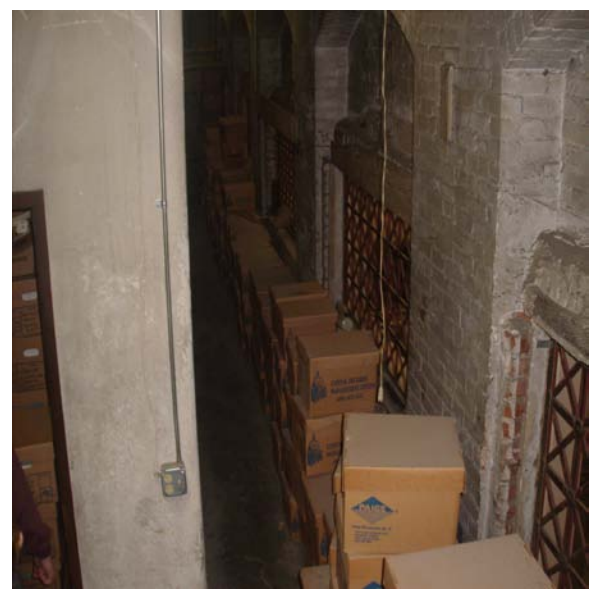
Atrium Storage 2010