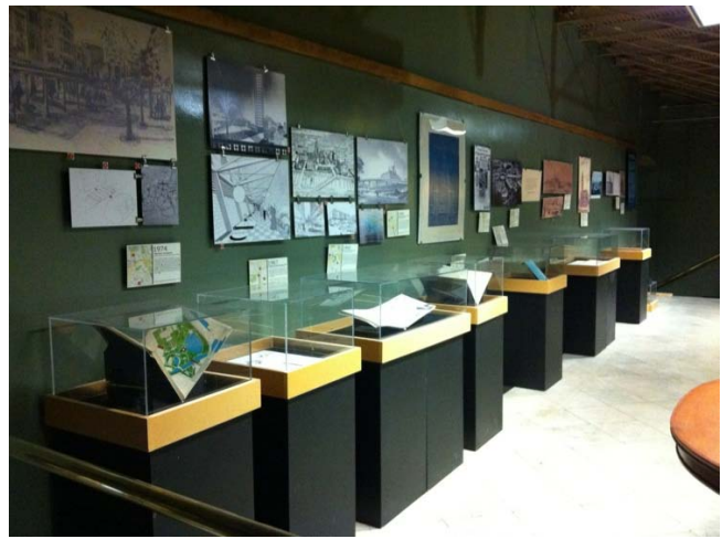
New Archives Exhibit Area

Recently, the lobby entrance to the archives has been transformed into an exhibit area and the "Capital Ideas" exhibit has been re-installed there. Currently, the Archivist is collaborating with Brown University on a new exhibit commemorating Providence's participation in the Civil War. The exhibit opening is tentatively scheduled for May 2013.