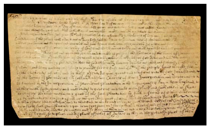
Recently Discovered 1648 Town Charter