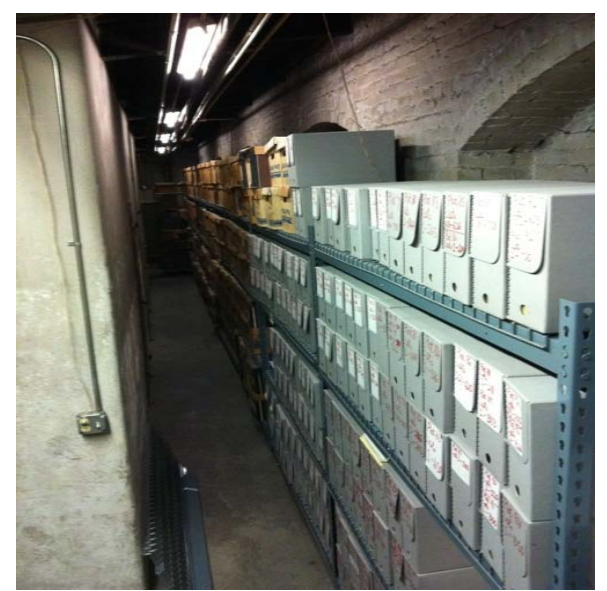
Atrium Storage 2012