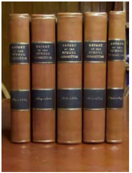
School Reports After