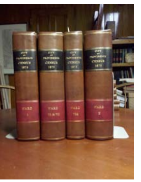
1875 Census After