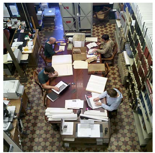
Volunteers at work

The above-mentioned collaborations with the MET School, Providence College and West Bay Collaborative have been mutually beneficial and are expected to continue. In addition, other area colleges have expressed interest in supplying interns and/or work study students to assist the archives. The Archives is also in preliminary discussions with the University of Rhode Island's Graduate Library School with a view towards supplying library school students to assist with