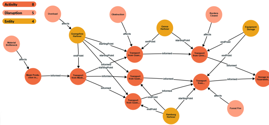
Fig. 2. A subset of the Knowledge Graph describing the supply chain of FFP2 masks

Our basis for the knowledge representation was the consolidated high-level entities and their counterpart PROV-O Starting Point classes: prov:Entity , prov:Activity and prov:Agent [3]. We mapped those through BFO to a useful set of the CCO ontologies, namely: the Event, the Agent and the Artifact ontologies. For the mapping, we extended the alignment between PROV-O and BFO proposed in [4] for core classes.