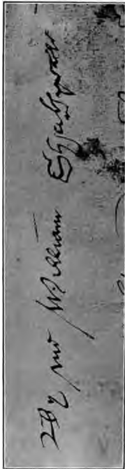
THREE AUTOGRAPH SIGNATURES SEVERALLY WRITTEN BY SHAKESPEARE ON THE THREE SHEETS OF HIS WILL ON MARCH 25, 1616

THE NATIONAL ARCHIVES, COLLEGE PARK, MARYLAND