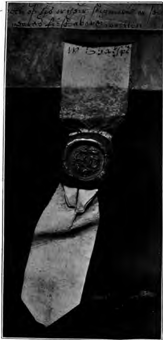
SHAKESPEARE'S AUTOGRAPH SIGNATURE APPENDED TO A DEED MORTGAGING HIS HOUSE IN BLACKFRIARS ON MARCH 11, 1612-13

Reproduced from the original document: now preserved in the British Museum