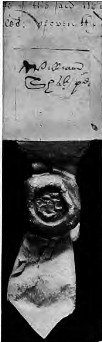
SHAKESPEARE'S AUTOGRAPH SIGNATURE APPENDED TO THE PURCHASE-DEED OF A HOUSE IN BLACKFRIARS ON MARCH 10, 1612-13

Reproduced from the original document now preserved in the Guildhall Library