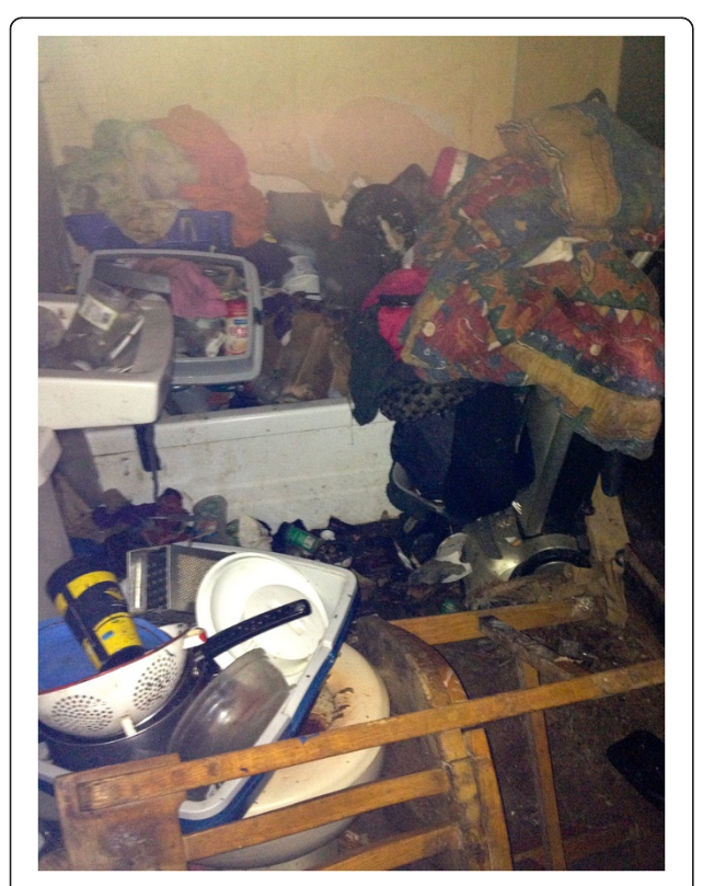
Figure 1 Bathroom. This is the state in which the bathroom was found in the patient's house. The patient had been using the toilet for both toileting and periodically washing her dishes.

Diagnosis of DS can be difficult as no one constellation of symptoms has been established. Hoarding, which can occur in DS, can also be found in many psychiatric conditions such as obsessive-compulsive disorder (OCD), schizophrenia, dementia, and others [11]. The act of accumulation in