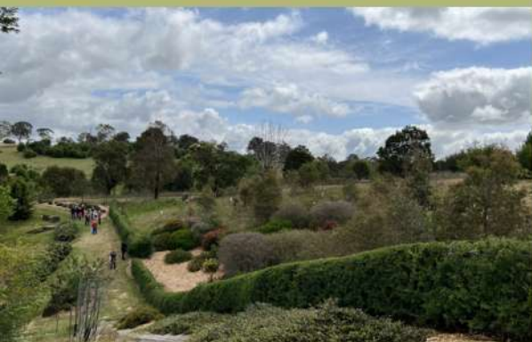
A recent garden of native plants behind a laid hedge of hawthorn, and regenerative farm on the nearby hillside.