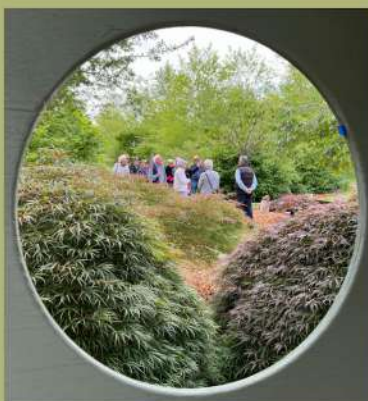
The Japanese inspired garden at Oldbury farm had many different maple species