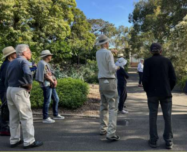
The volunteer guide telling us about the Gadigal people and the first farms of the First Fleet