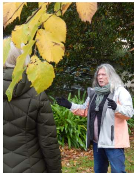
Buninyong Botanic Gardens Elms Tour.