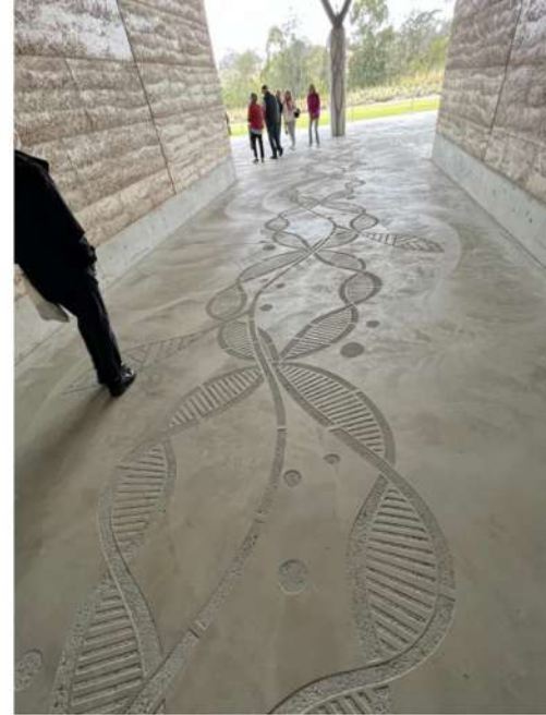
Floor art in a Herbarium corridor leading to gardens of plants in peril.

We are grateful to the people who organized this wonderful tour and the many enthusiastic horticulturalists, gardeners, botanists, custodians and volunteer friends, who look after these treasures and hosted our visits to them.