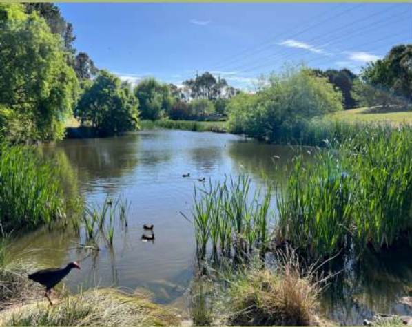
The woodland and its waterway being regenerated at Southern Highlands Botanic Garden