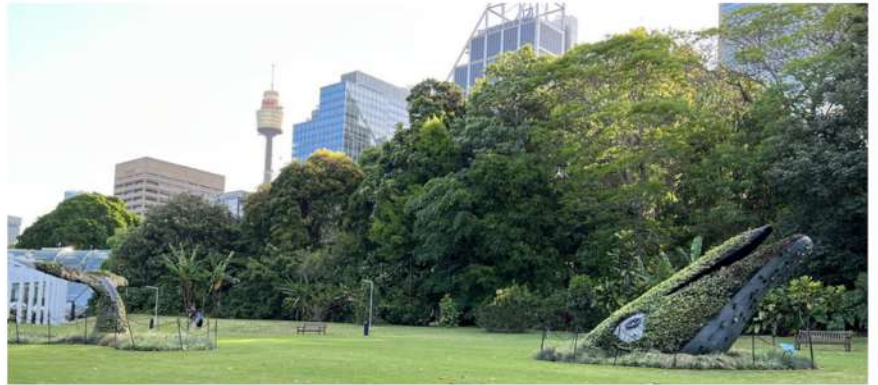
An eye-catching floriferous whale at the Royal Botanic Gardens Sydney

The gardens have been in the headlines over the years, not only for the Garden Palace exhibition pavilions in 1879, but also when they burnt down in 1882. The area now has the Memorial Pioneers Garden and nearby sculptures of Australian fauna featuring Australian flora.