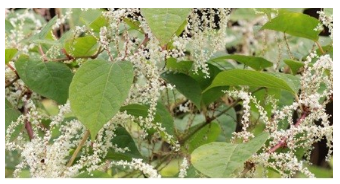
Japanese knotweed in flower (generally July-October)

Plants within their native range are usually controlled by a variety of natural pests and diseases. When these plants are introduced into new areas that are free from these pests and diseases, they can become larger and more vigorous. The spread of Japanese knotweed is a serious threat to our countryside, and the native plants and animals that rely upon it. Rivers, hedges, roadsides and railways form important corridors for native plants and animals to migrate, and large infestations of nonnative weeds can block these routes for wildlife.