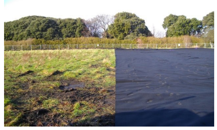
WMA—Lining before waste is stockpiled

Chemical herbicide treatment should then be carried out as normal on the growth which emerges from the WMA.