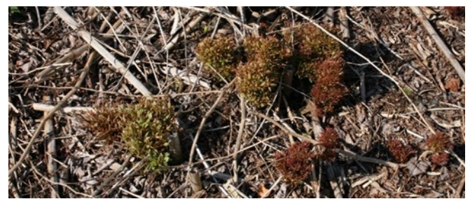
Bonsai' growth of Japanese knotweed

Glyphosate is a non-selective herbicide, and will harm or kill other broadleaf species and grasses that it is applied to. Because Japanese knotweed is tall and bushy, it often overhangs other species or areas of grass which may be affected by herbicide which drips or drifts on to them. This should be taken in to account when planning the application methods.