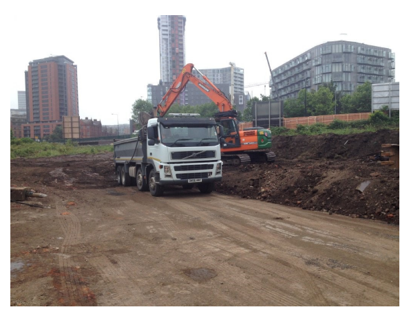
Dig and dump method

Further information on your responsibilities in relation to waste can be found at <u>https://www.gov.uk/managing-your-waste-an-overview</u>