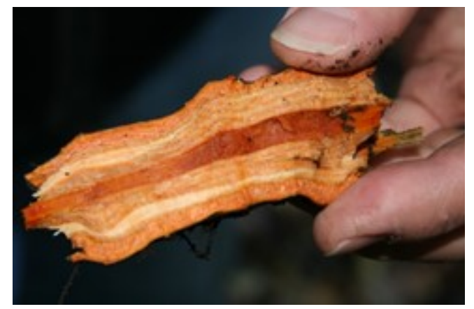
Cross-section of Japanese knotweed rhizome