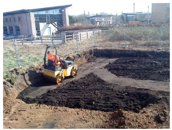
Compaction of a burial chamber

Given that the rhizomes may remain dormant for 20 years, it is important that the supplier of the membrane gives a guarantee exceeding this, with a minimum specification of 50 years or greater.