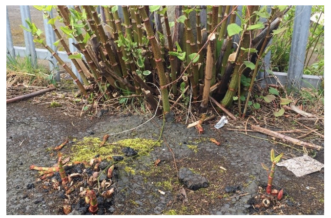
Japanese knotweed breaking through a hard surface