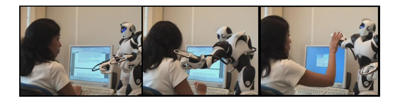
Figure 1: Selected screenshots. Left: interaction between user and robot, as in all conditions.Middle: shoulder pat, touch condition. Right: high five, touch condition.