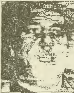
Jibril: waiting for the word from Gaddafi

Although nearly all Arab states halted Libyan flights yesterday, most took no action against Libyan diplomats, as required by the UN