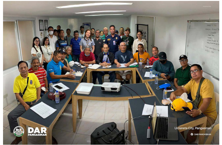
Urdaneta City, Pangasinan