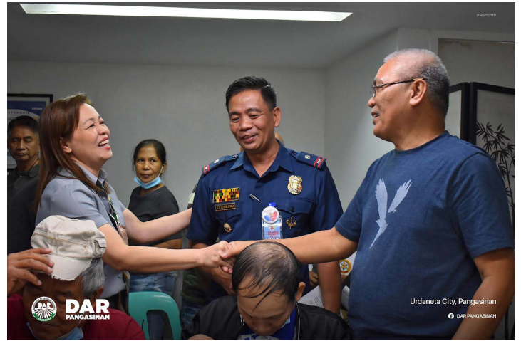
Urdaneta City, Pangasinan

All interested applicants were encouraged to visit the Legal Division before applying for the program so they can first be oriented on the Department’s policy on land acquisition and distribution.